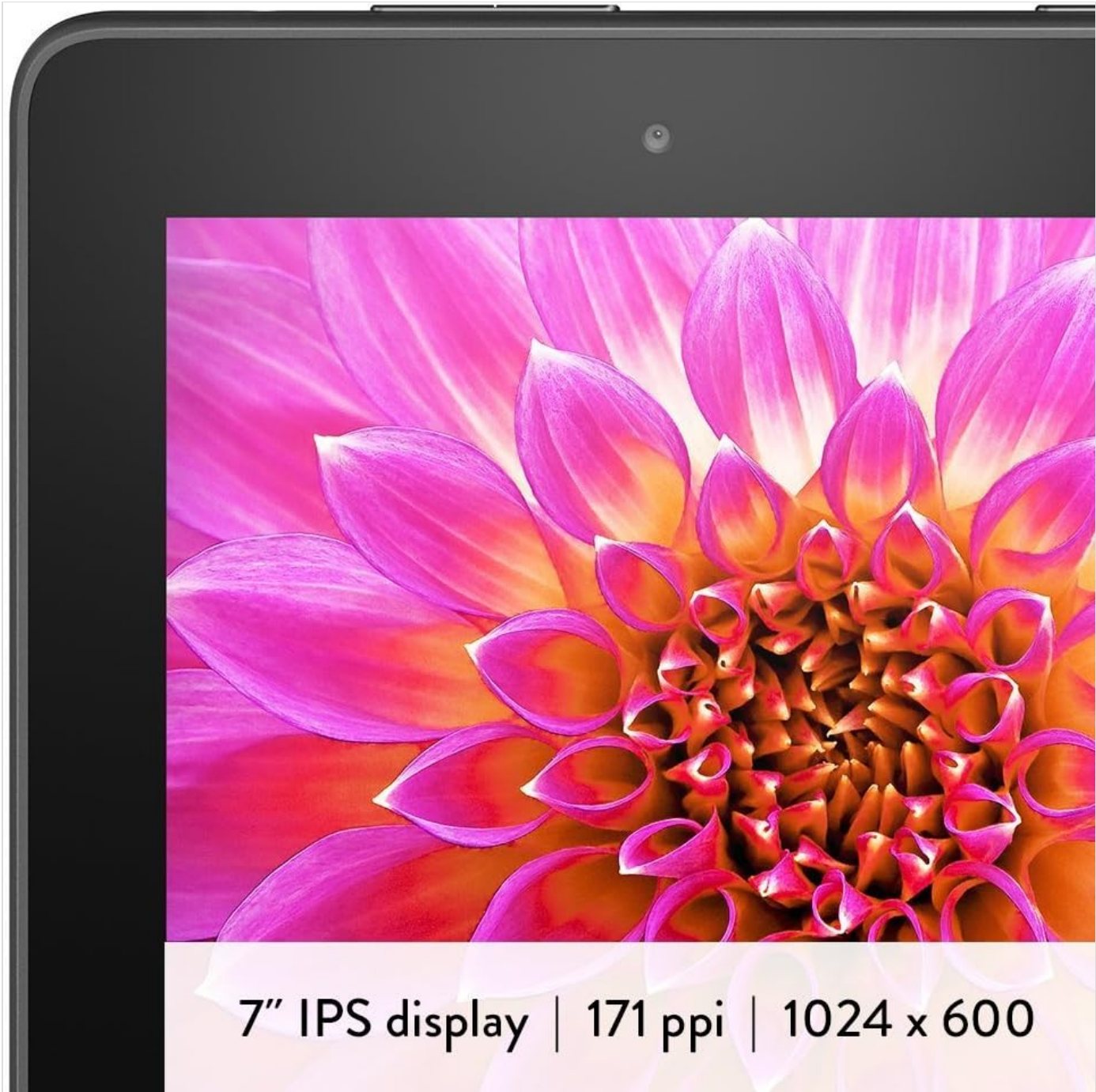
Image: A detailed view of the Fire tablet's 7-inch IPS display, highlighting its resolution and pixel density.

Refer to the "Battery Life Optimization" section (3.1). If the issue persists, contact customer support.