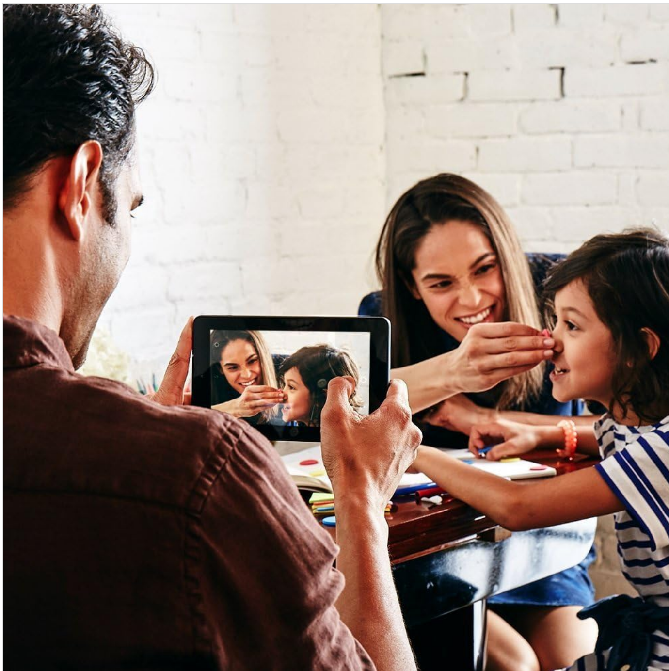
Image: A user capturing a moment with the Fire tablet's camera, highlighting its photo-taking feature.