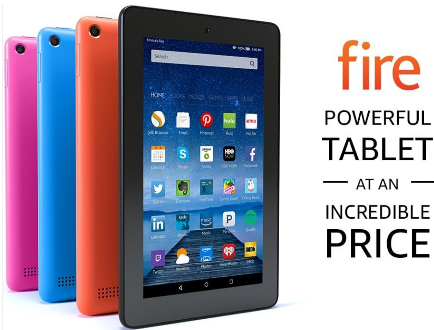
Image: Multiple Fire tablets displaying the user interface with app icons for Silk Browser, Email, Pinterest, Hulu, Netflix, and more.

The Fire tablet features a 7-inch IPS touchscreen for intuitive navigation. Swipe up, down, left, and right to move between screens and content categories. Physical buttons for power and volume are located on the top edge of the device.