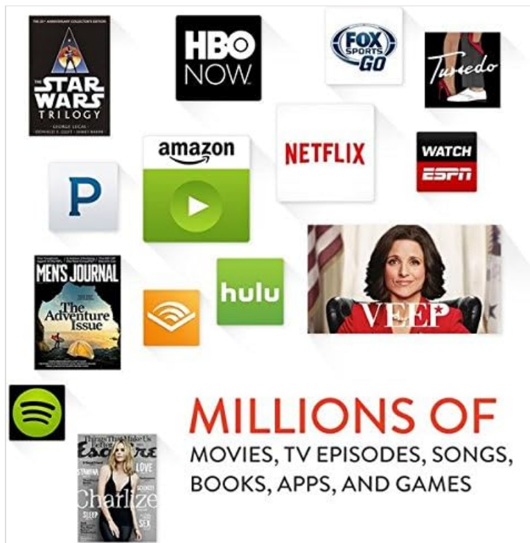
Image: Various application and content service logos, such as Netflix, Hulu, and Amazon, indicating the range of entertainment available on the tablet.