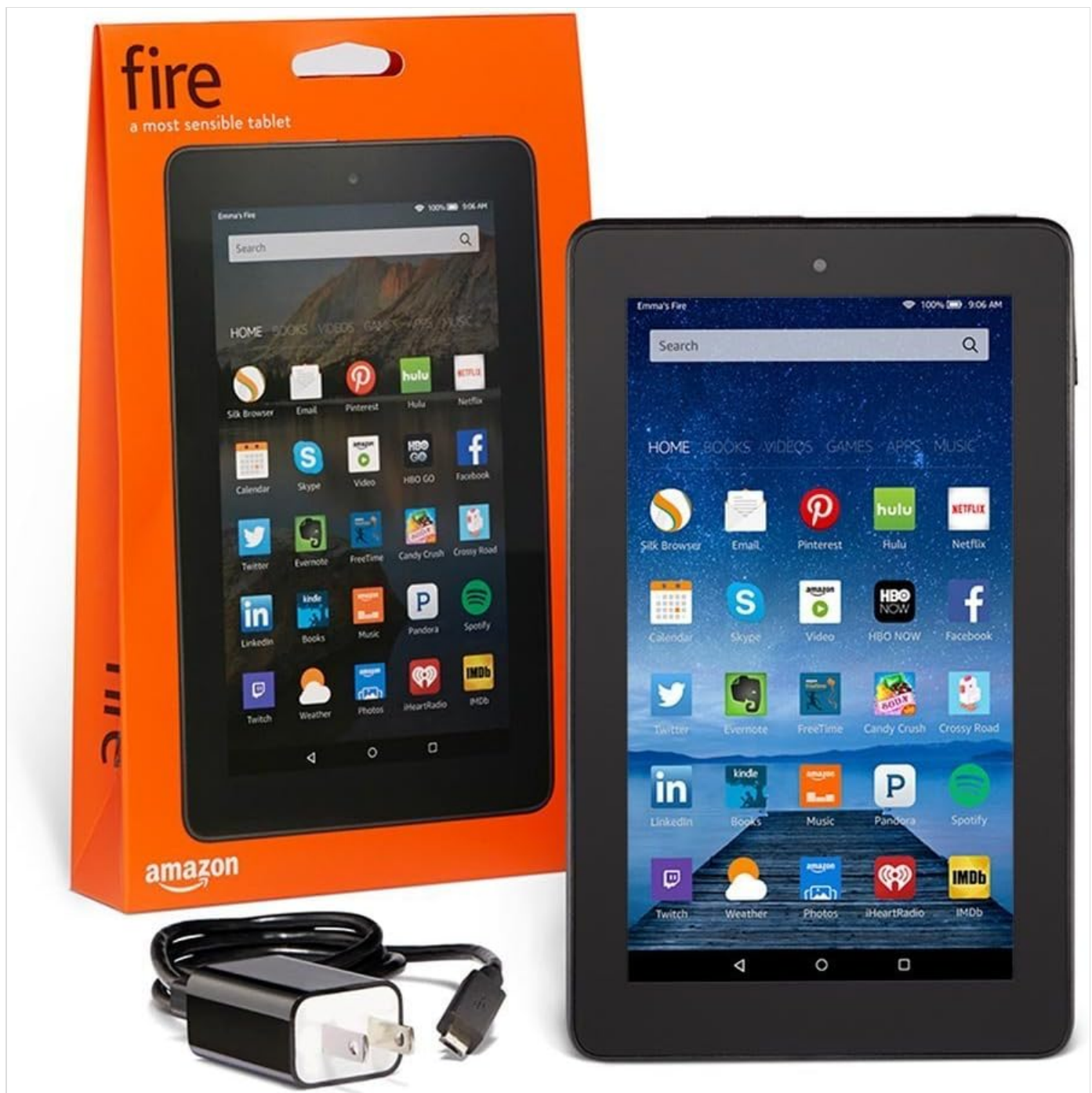
Image: The Fire tablet, its USB cable, and power adapter are shown alongside the product packaging.