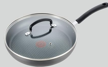
11.5 in Fry Pan