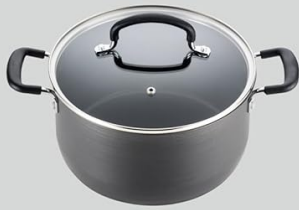
5 qt Covered Dutch Oven