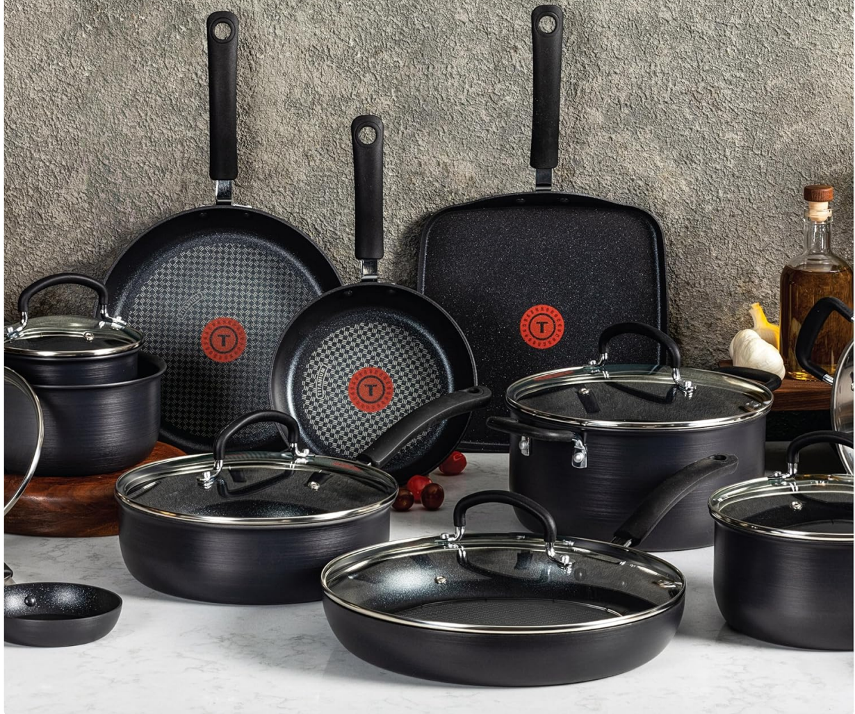
Image: Illustrates the robust hard anodized exterior of the cookware.

HARD ANODIZED EXTERIOR: With forged construction for ultimate durability