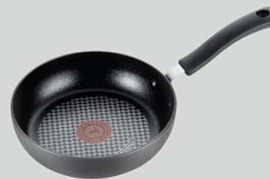
8 in Fry Pan