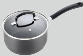
2 qt Covered Saucepan