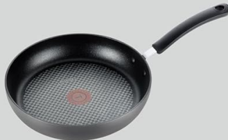
10 in Fry Pan