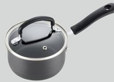
1 qt Covered Saucepan