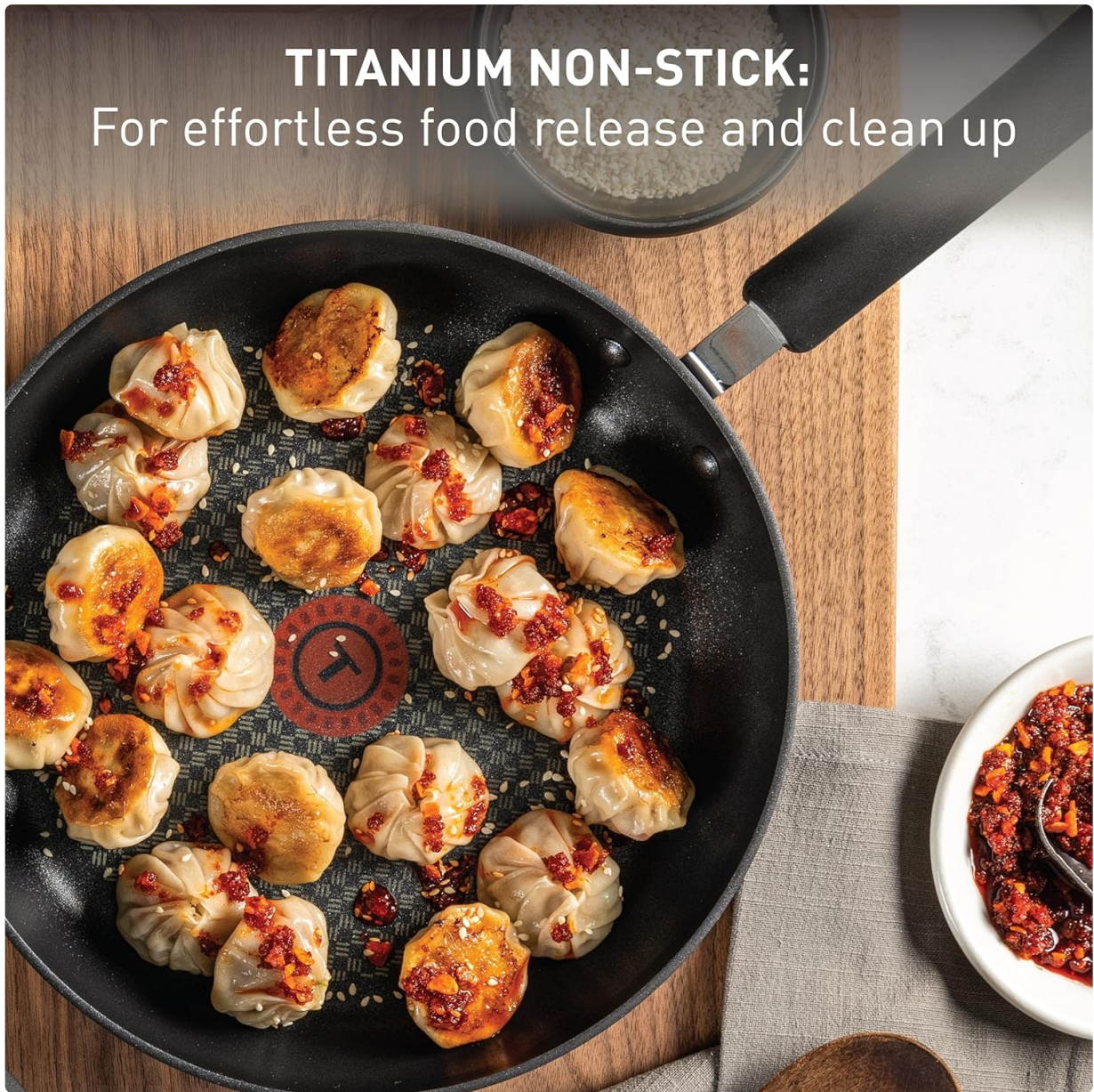
Image: Shows the titanium non-stick surface with food cooking, demonstrating its effectiveness.