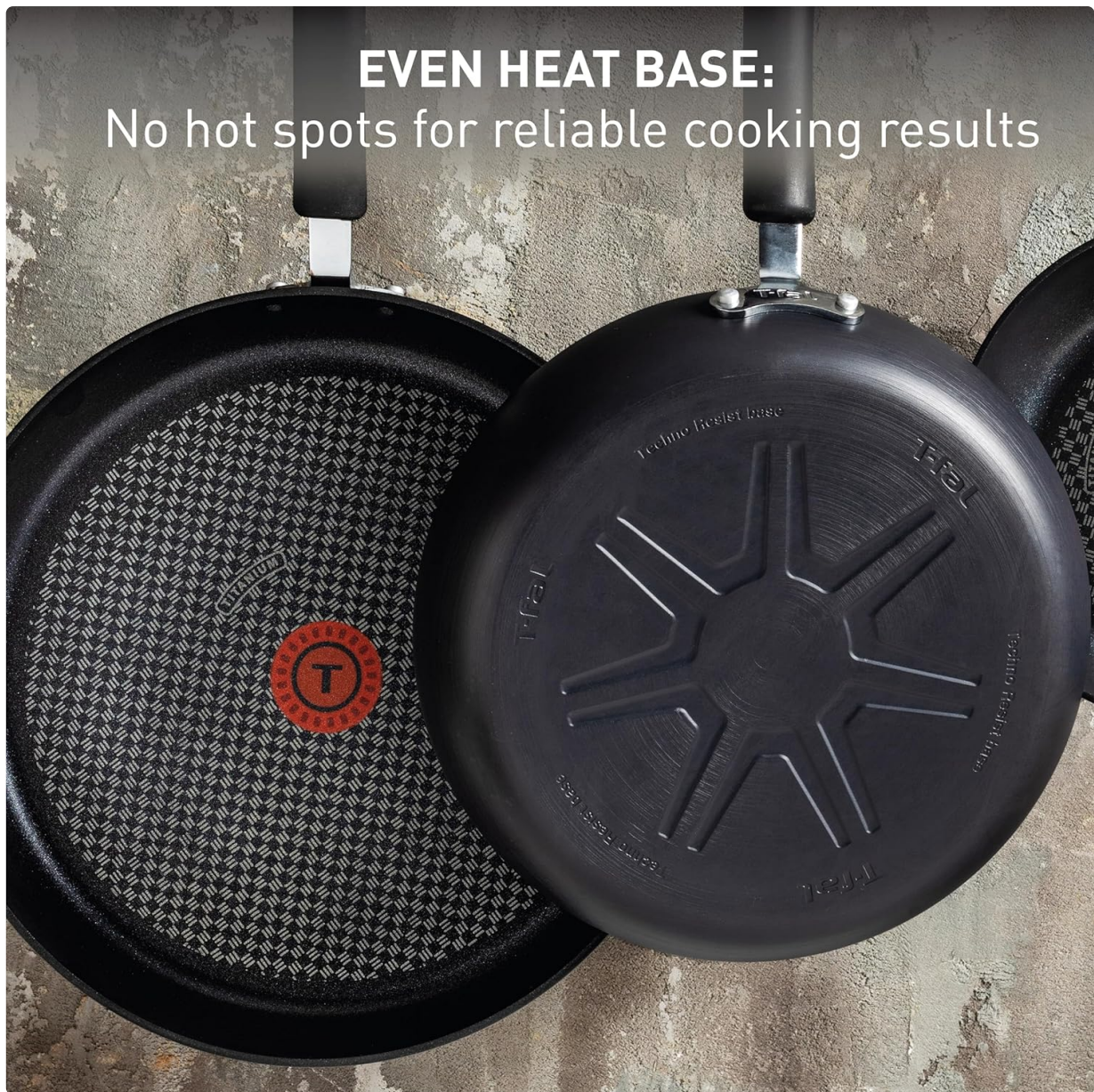
Image: Shows the base of the pans, designed for even heat distribution.