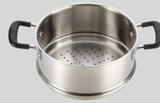
3 qt Steamer Insert