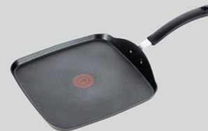
10.25 in Square Griddle

Image: Visual representation of the complete 14-piece cookware set.