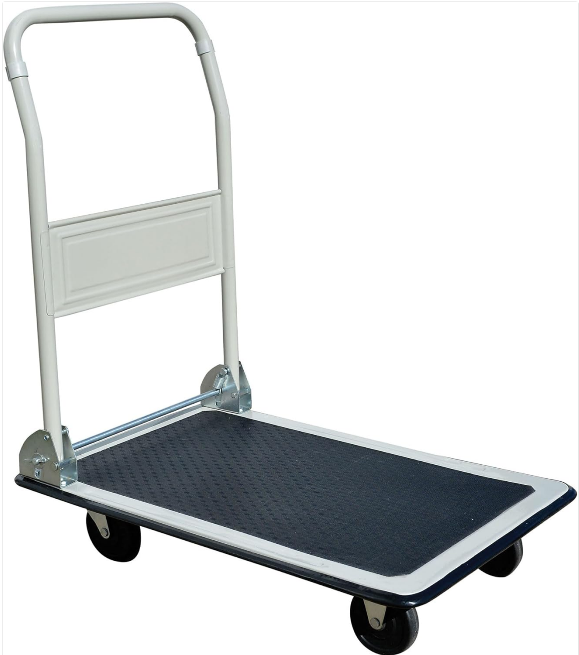
Image: The Buffalo Tools FPTRUCK Folding Platform Truck shown fully unfolded and ready for use. The handle is in the upright position, and the platform is flat.

Locate the handle mechanism at the rear of the platform. Gently pull the handle upwards until it locks securely into the upright position. Ensure the locking pins or levers (if present) are fully engaged to prevent accidental folding during use.