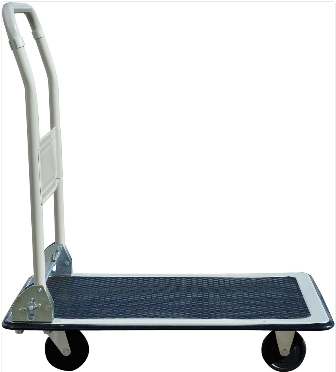
Image: A side view of the platform truck, highlighting the wheels and the low-profile design of the platform.