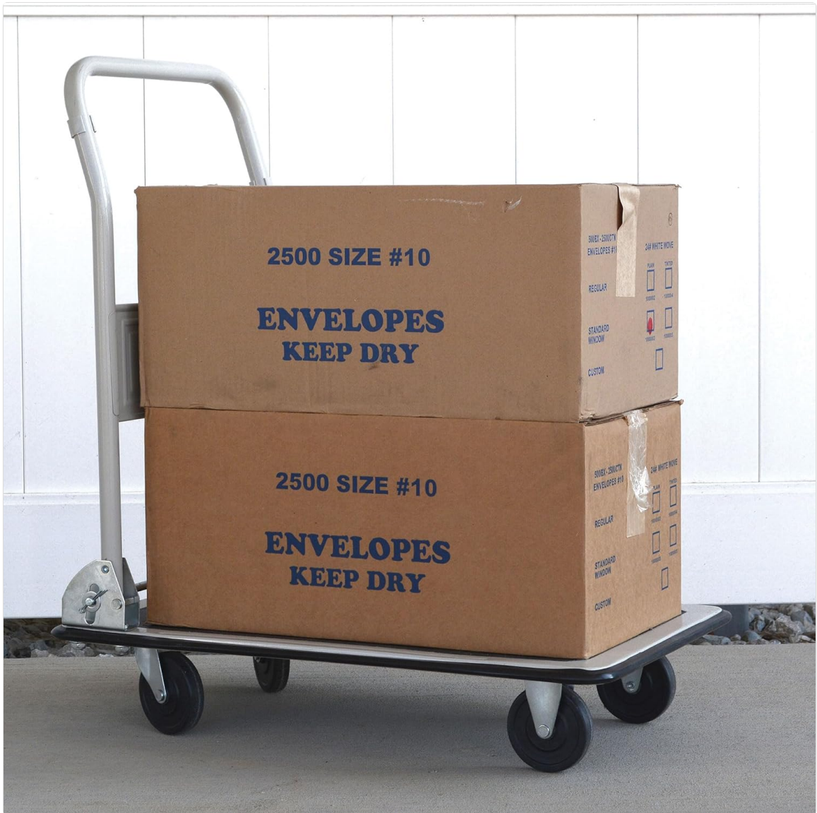
Image: The platform truck in use, transporting two stacked cardboard boxes. This demonstrates proper load placement and the truck's functionality.