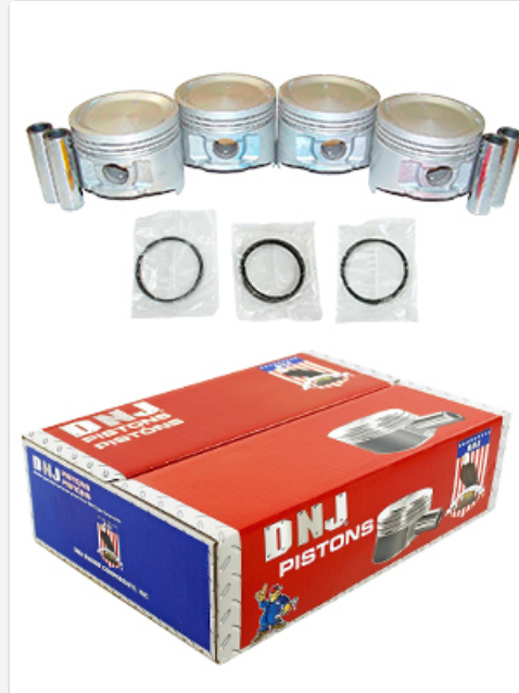
Image: A collection of pistons and piston rings, illustrating the components involved in the installation process.