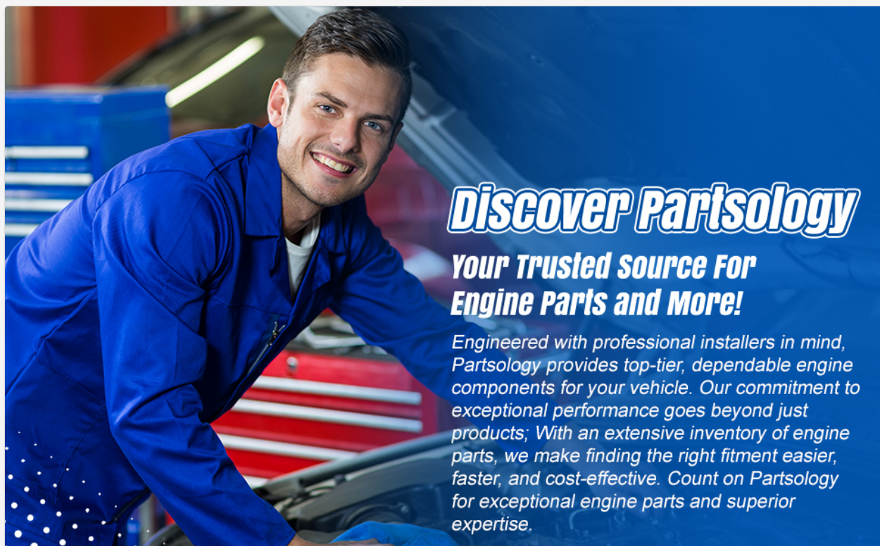
Image: A mechanic in blue overalls is shown working on an open car engine, emphasizing the need for professional