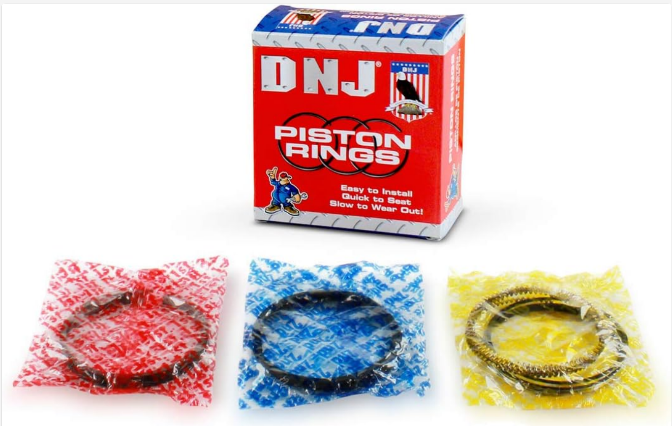
Image: DNJ PR900 Piston Rings in their packaging, alongside three individual sets of piston rings, each sealed in a clear plastic bag with color-coded inserts (red, blue, yellow).

The DNJ PR900 Piston Rings are precision-engineered components designed for optimal engine performance and longevity. This set provides a complete solution for engine rebuilds, ensuring proper compression and oil control within the cylinders.