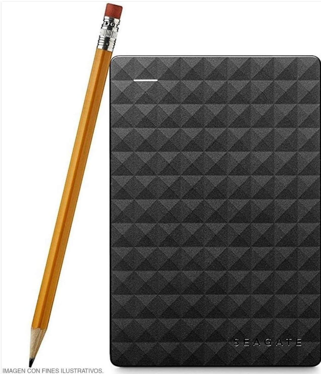
IMAGEN CON FINES ILUSTRATIVOS.