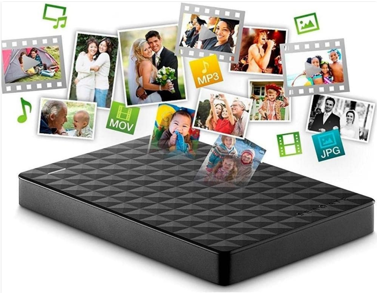
Figure 5: Conceptual representation of data transfer to the hard drive