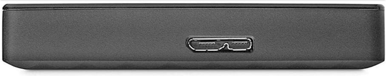
Figure 4: Close-up of the USB 3.0 port for connection

Your computer should automatically recognize the drive, and it will appear as a new drive letter in 'My Computer' or 'This PC'.