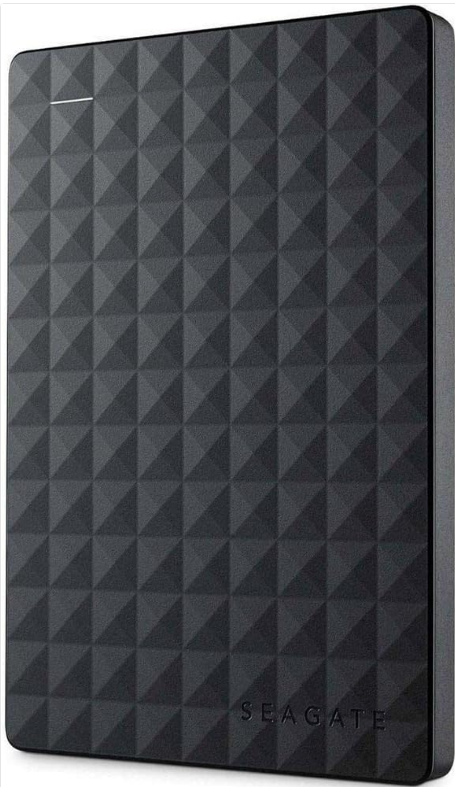
Figure 2: Slim profile of the Seagate Expansion Portable Hard Drive