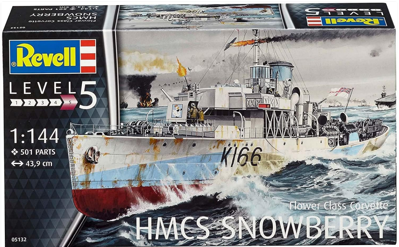
Image: A fully assembled and painted model of the HMCS Snowberry, displayed on its stand, showcasing the intricate details and overall completed appearance.