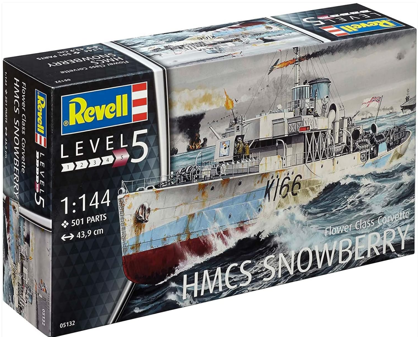
Image: The retail box for the Revell HMCS Snowberry Model Kit, showcasing the detailed artwork of the corvette at sea and indicating "Level 5" difficulty with 501 parts and a 1:144 scale.