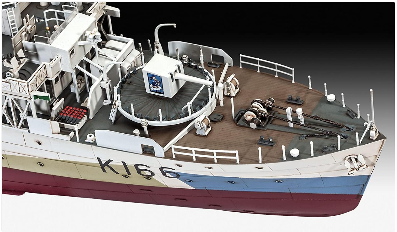
Image: A detailed view of the mid-ship section of the assembled HMCS Snowberry model, showing the bridge, lifeboats, and various deck structures.