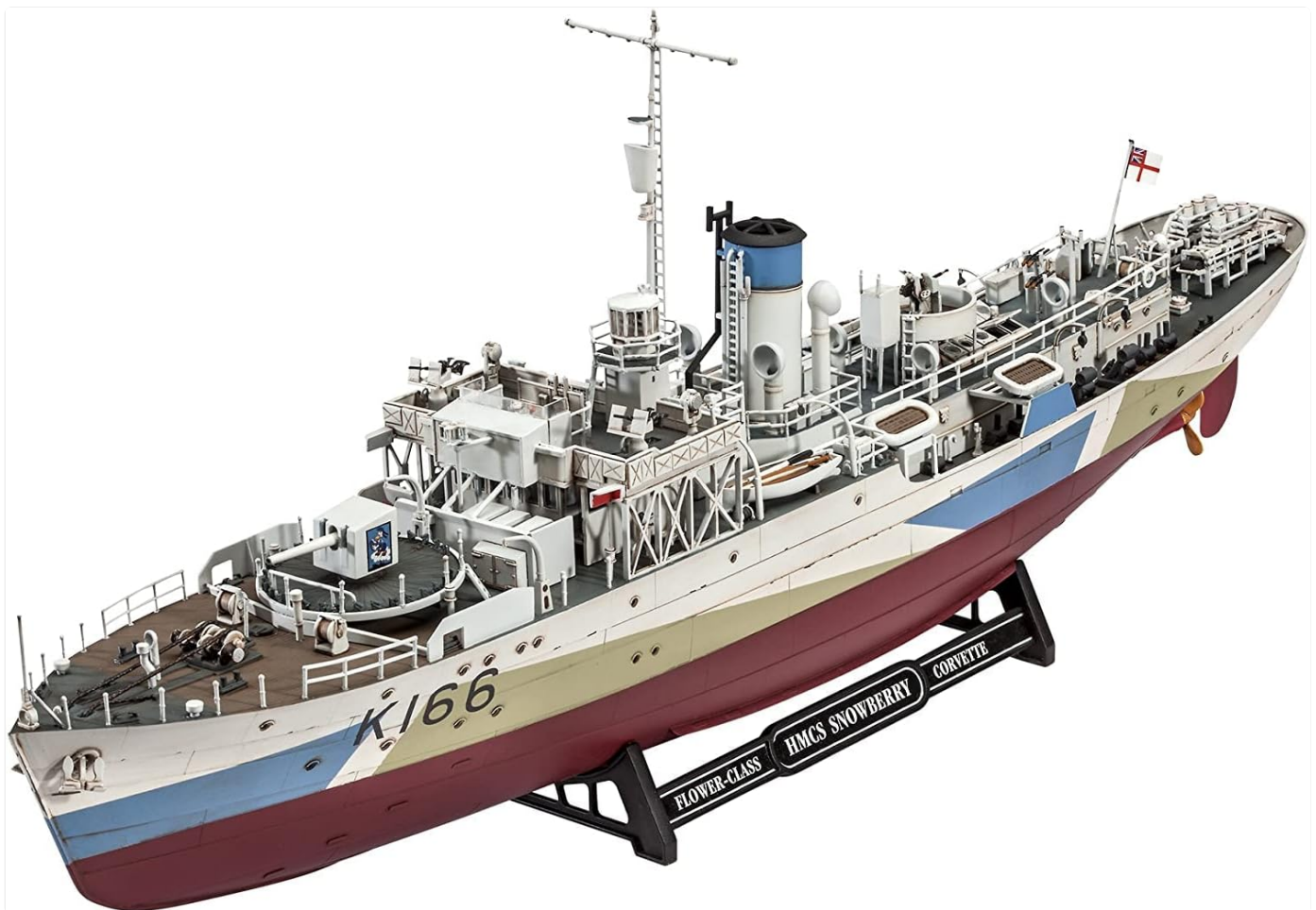
Image: A detailed close-up of the front (bow) section of the assembled HMCS Snowberry model, highlighting the main gun turret, anchor chains, and deck details.