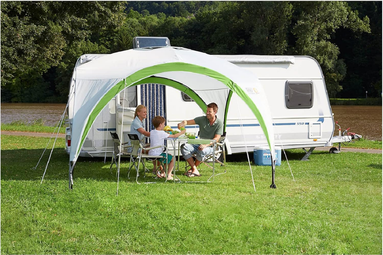
Image 3: A family enjoying an outdoor meal under the shelter, demonstrating its use for various outdoor activities.