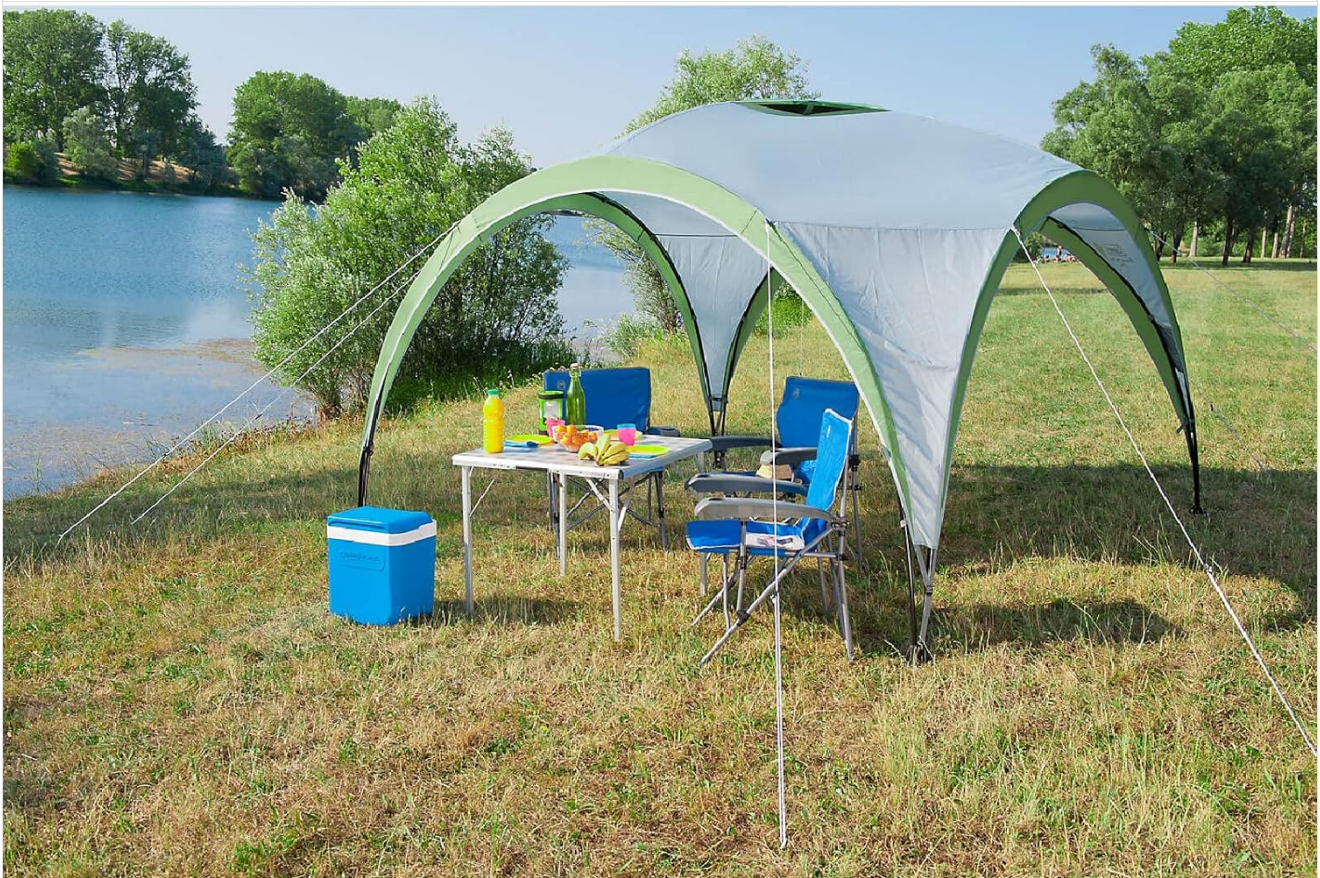
Image 1: The Coleman Event Shelter L Pro set up by a lake, providing shade for a table and chairs.