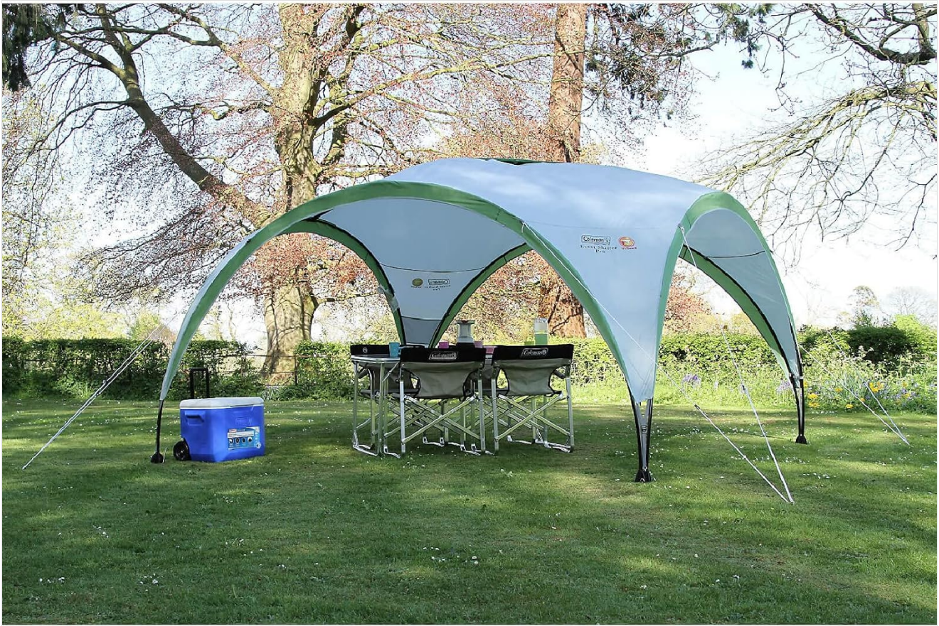
Image 2: The Coleman Event Shelter L Pro providing shade in a garden setting.