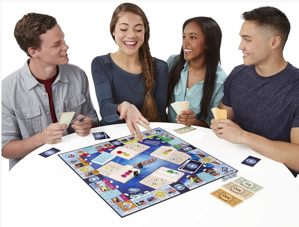
Players engaged in a game of Monopoly Here and Now World Edition, with the board and components visible.