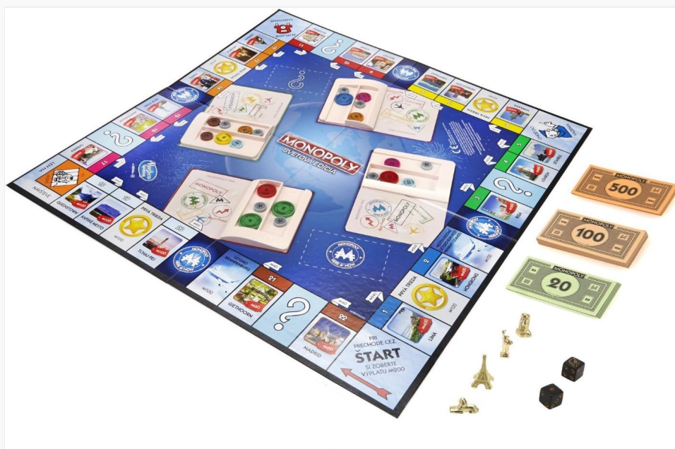
The game board laid out with tokens, passports, money, and cards in their starting positions.