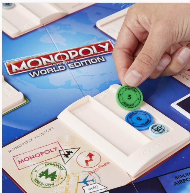
A player placing a colored stamp into their plastic passport, signifying ownership of a location or a first-class acquisition.