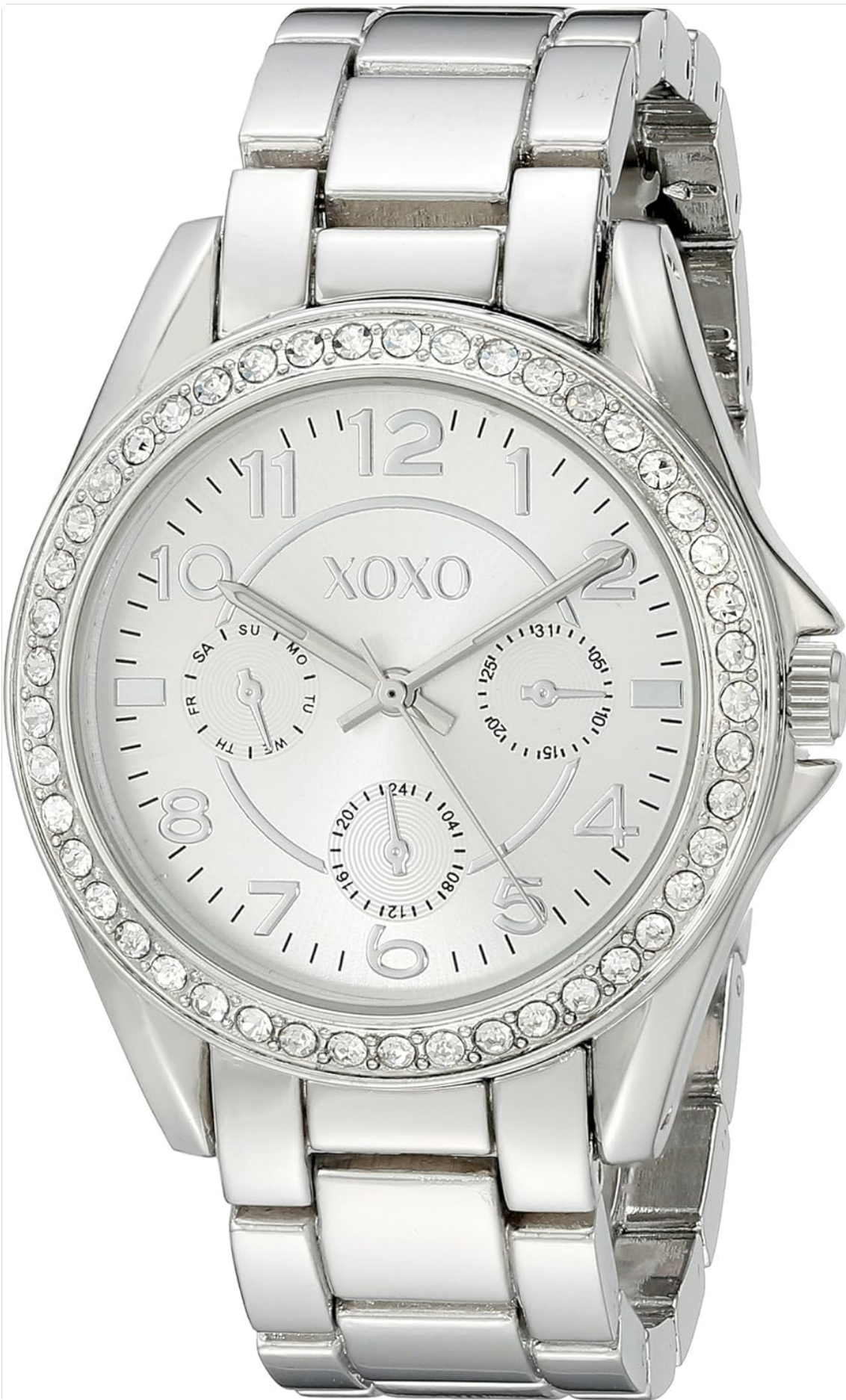
Image: Front view of the XOXO Women's Silver-Tone Bracelet Watch, showcasing the silver-tone finish, crystal-accented bezel, and multi-dial face.