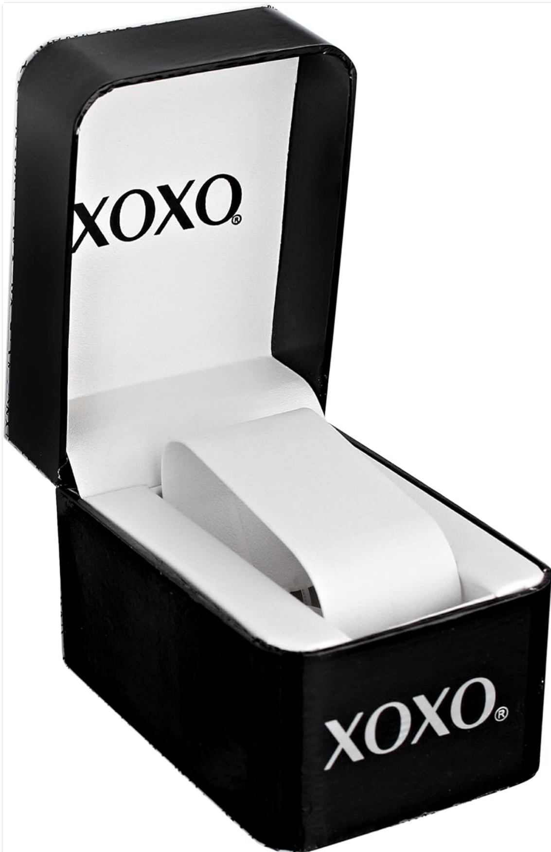
Image: The XOXO Women's Watch presented inside its black branded gift box with white interior.

Carefully remove the watch from its packaging. The watch is typically presented in an official XOXO branded gift box.