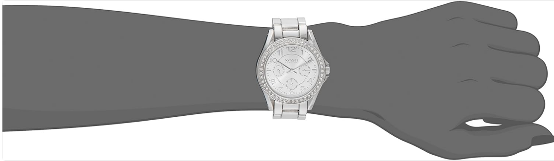
Image: The XOXO Women's Silver-Tone Bracelet Watch worn on a wrist, demonstrating its fit and appearance.

The alloy link bracelet features an adjustable fold-over clasp designed for a secure and comfortable fit. If the bracelet is too loose, it may require professional adjustment to remove links. It is recommended to visit a qualified jeweler for this service to avoid damage to the watch or bracelet.