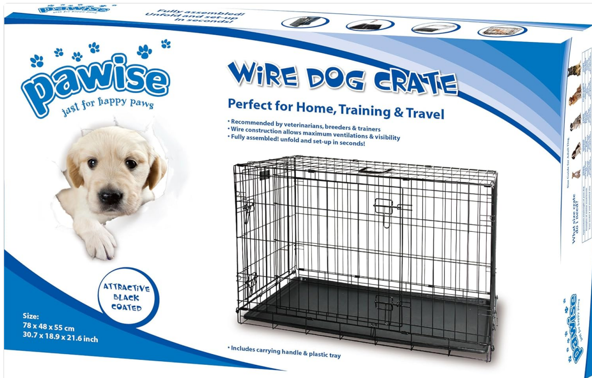
Image: The product packaging box, featuring the Pawise logo, a puppy, and an illustration of the wire dog crate. The box indicates "Fully assembled! Unfold and set-up in seconds!" and highlights features like "Wire construction allows maximum ventilations & visibility" and "Includes carrying handle & plastic tray."