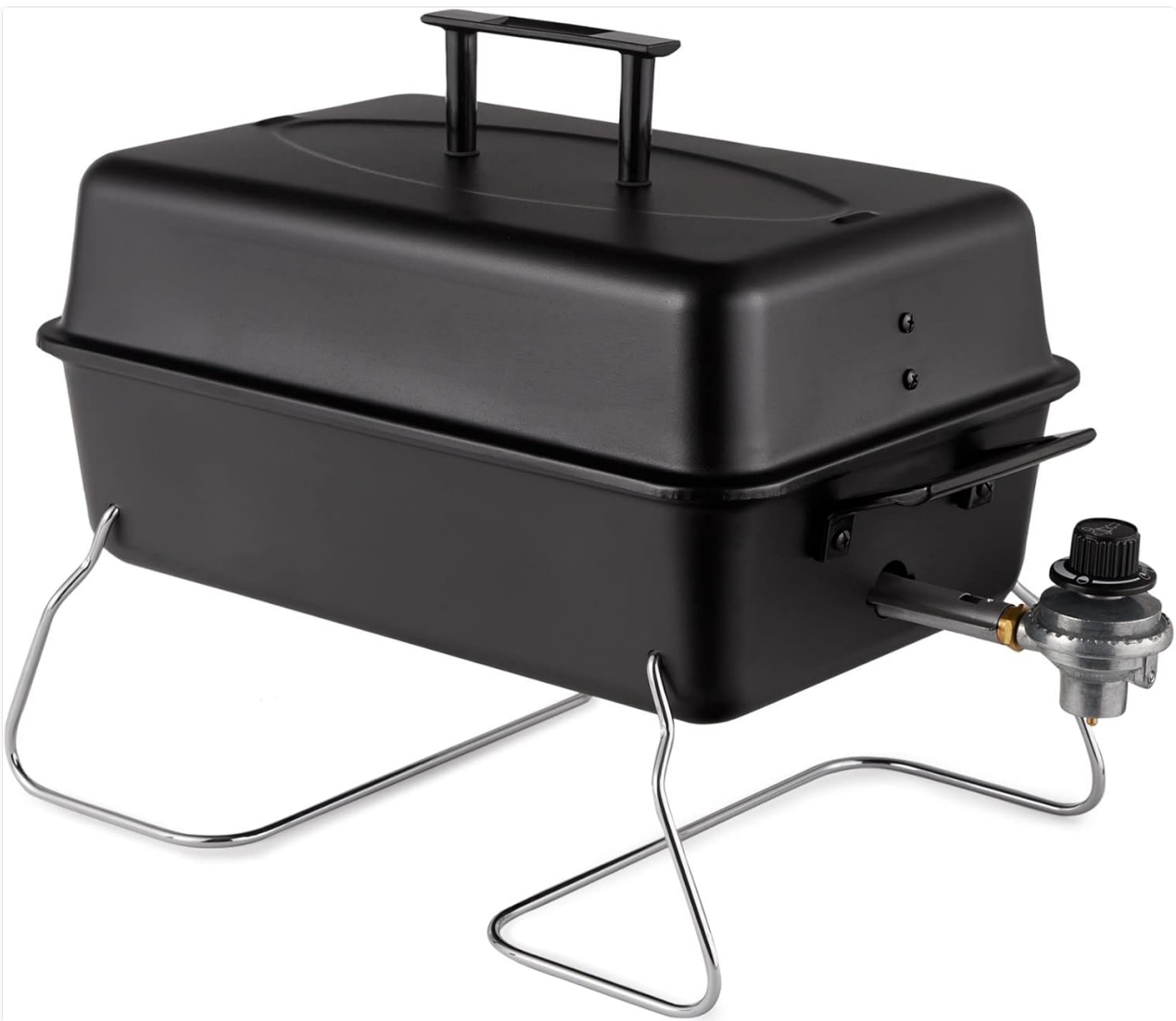
Image: The Char-Broil Table Top Portable Gas Grill in its compact, closed state with its folding legs extended, ready for use or transport.