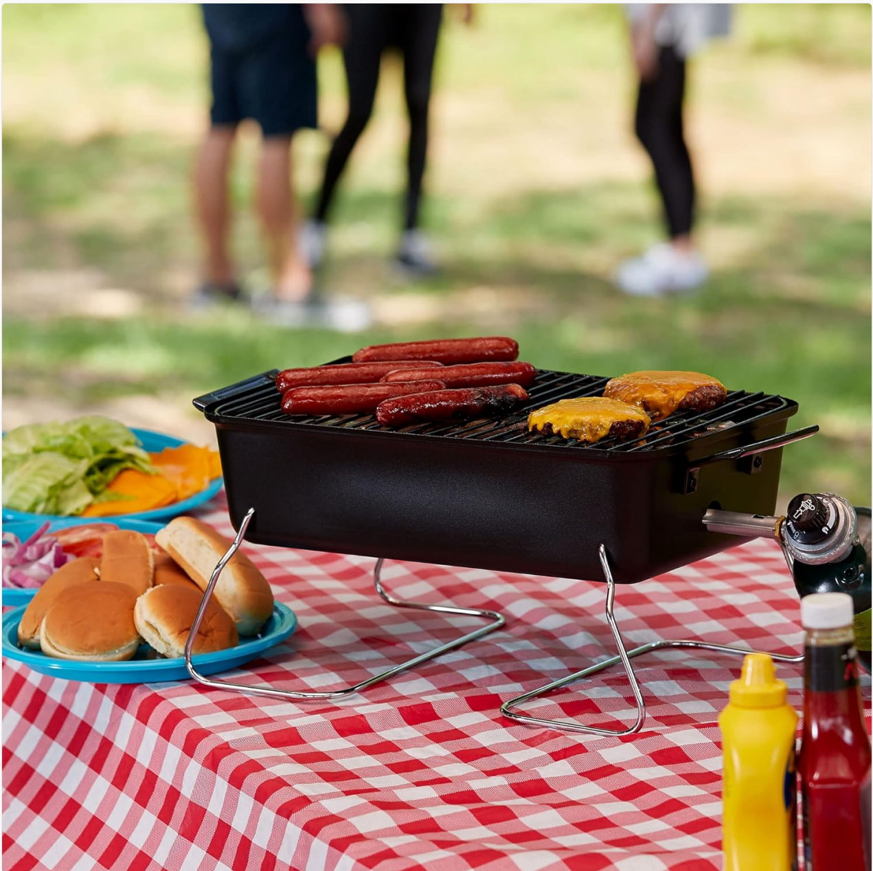
Image: The Char-Broil Portable Gas Grill actively in use on a red and white checkered picnic table, grilling hot dogs and hamburgers, demonstrating its outdoor functionality.