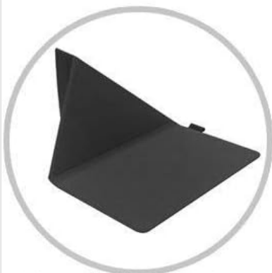
Magnetic Leather Case for Keyboard