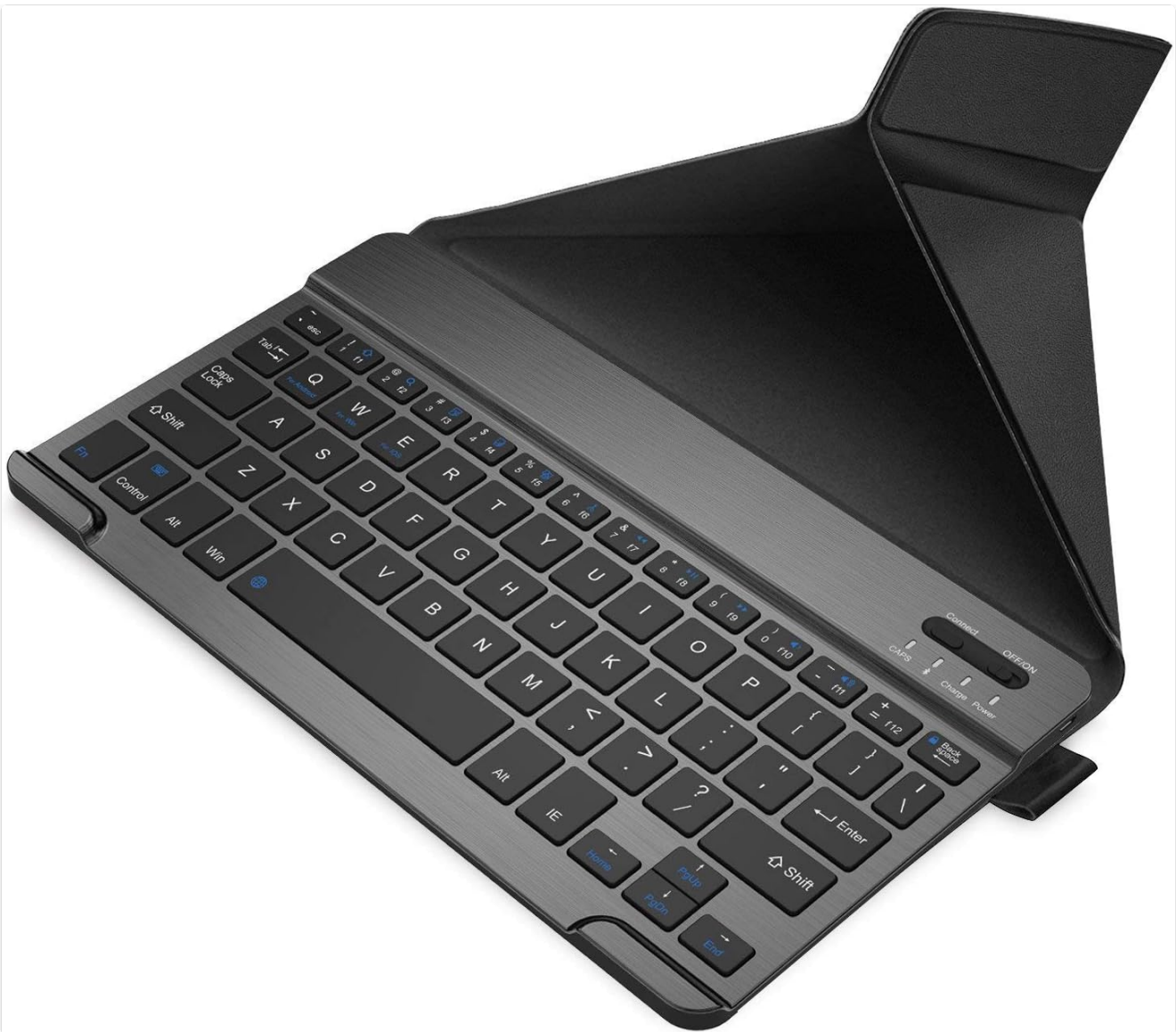
Image: The Nulaxy KM12 Bluetooth Keyboard, shown with its magnetic detachable leather cover. The keyboard features a sleek, dark grey finish with black keys, and the cover is folded back to reveal the keyboard.