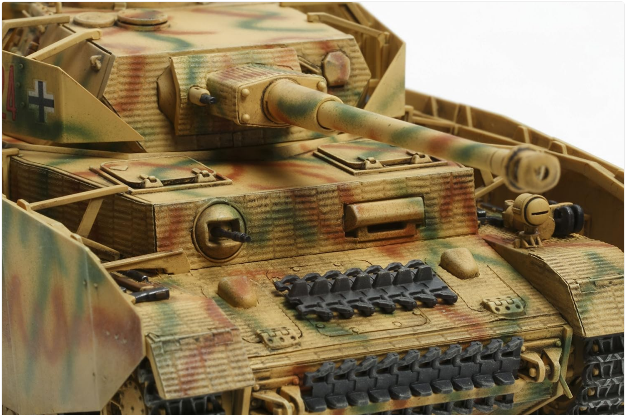
Image: Detailed view of the Tamiya 1/48 German Panzer IV AUSF.H model's turret, main gun, and front hull, showcasing intricate details and track links.