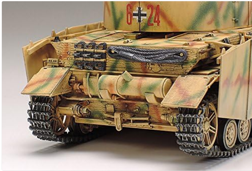
Image: Rear view of the Tamiya 1/48 German Panzer IV AUSF.H model, highlighting the auxiliary engine muffer, towing pintle, and track details.