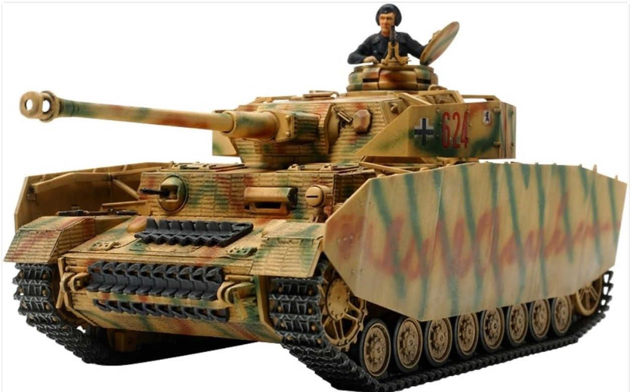
Image: Completed Tamiya 1/48 German Panzer IV AUSF.H model kit with desert camouflage and a commander figure.

This manual provides detailed instructions for the assembly, painting, and care of your Tamiya 32584 1/48 German Panzer IV AUSF.H plastic model kit. The Panzer IV was a significant German tank during WWII, with the Ausf. H variant featuring a L/48 75mm gun and "Schurzen" armor side skirts for enhanced protection. This kit accurately replicates the late production Ausf. H, including specific track designs and other unique features.