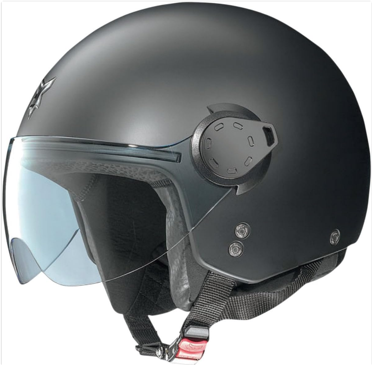
Image: The Nolan N20 Outlaw Helmet in matte black, featuring an open-face design with a clear visor. The helmet includes a chin strap and ventilation details.