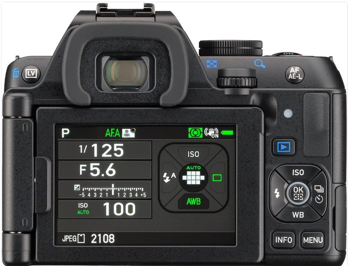
Figure 1: Rear view of the Pentax K-S2 DSLR camera, showing the LCD screen, control buttons, and mode dial. The LCD displays current shooting settings including aperture (F5.6), shutter speed (1/125), and ISO (100).

Use the front and rear e-dials to adjust settings like aperture, shutter speed, and exposure compensation depending on the selected mode.