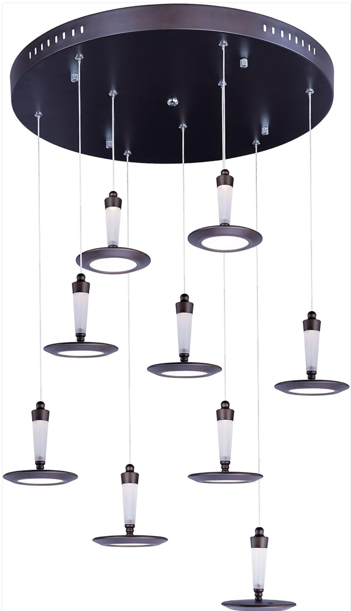
Image 3.2.1: Fully assembled ET2 Hilite Large Pendant (Model E21169-01BZ) showing the overall design and