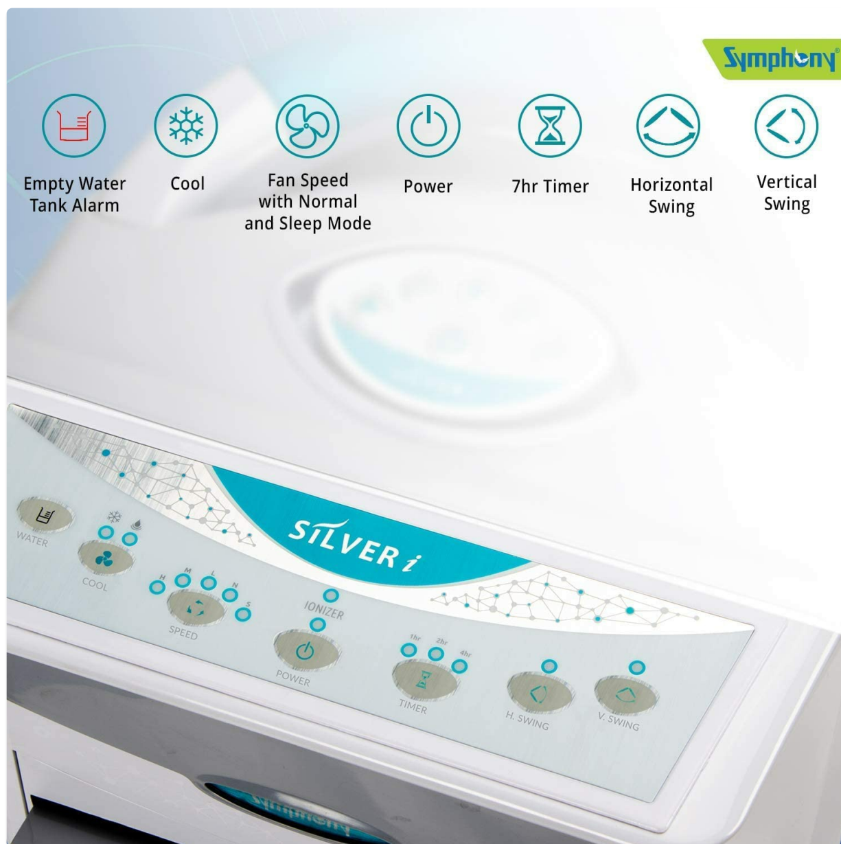
Image: Detailed view of the control panel icons, illustrating various functions.

Swing' button to activate or deactivate vertical oscillation. When the cooler is switched off, the louvers close completely to prevent dust and insects from entering.