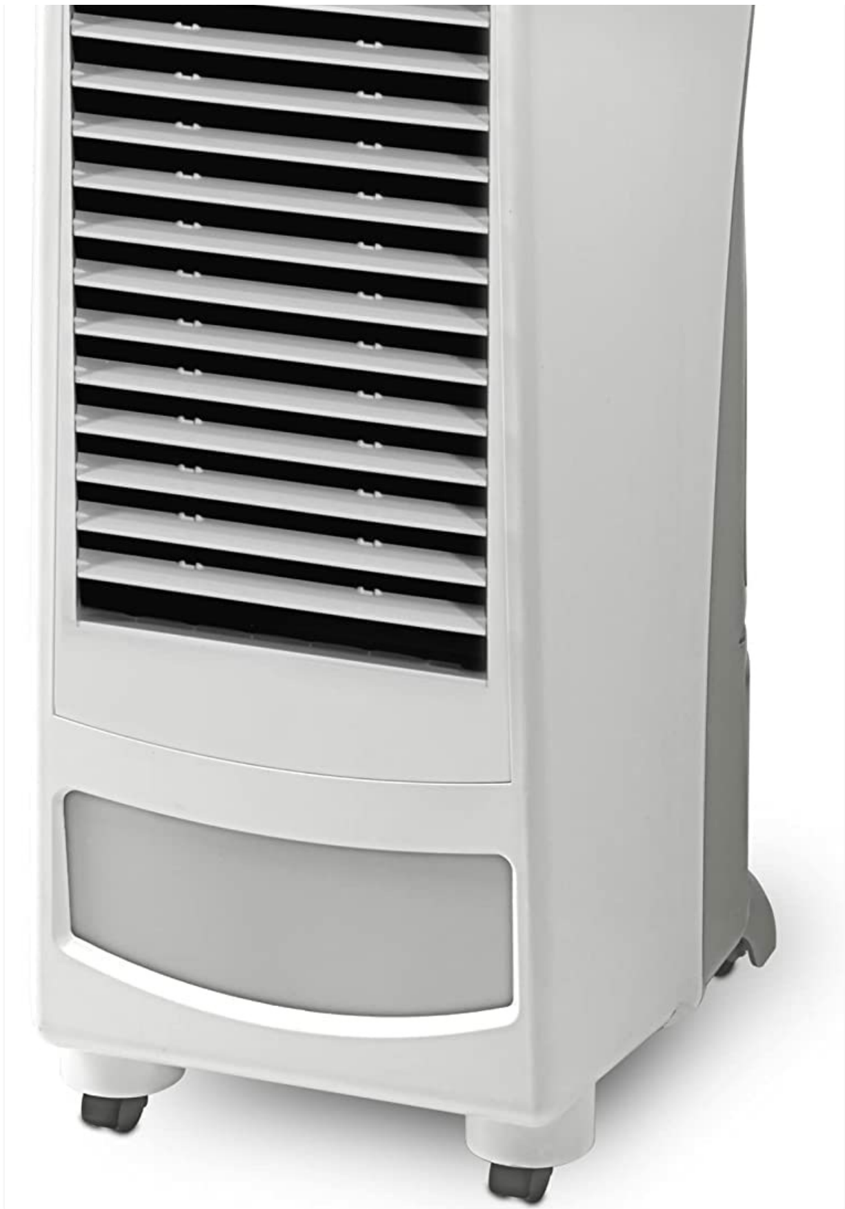
Image: Front view of the Symphony Silver-i Air Cooler.