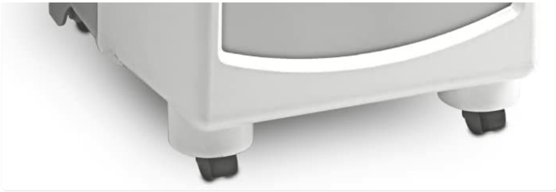
Image: Side view of the Symphony Silver-i Air Cooler, showing the removable back panel for filter access.