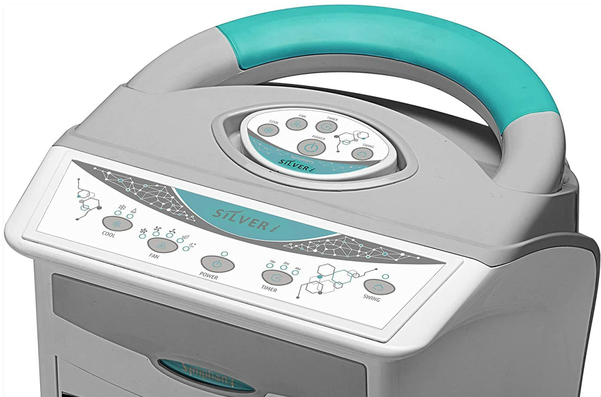
Image: Close-up of the feather touch digital control panel on the Symphony Silver-i Air Cooler.