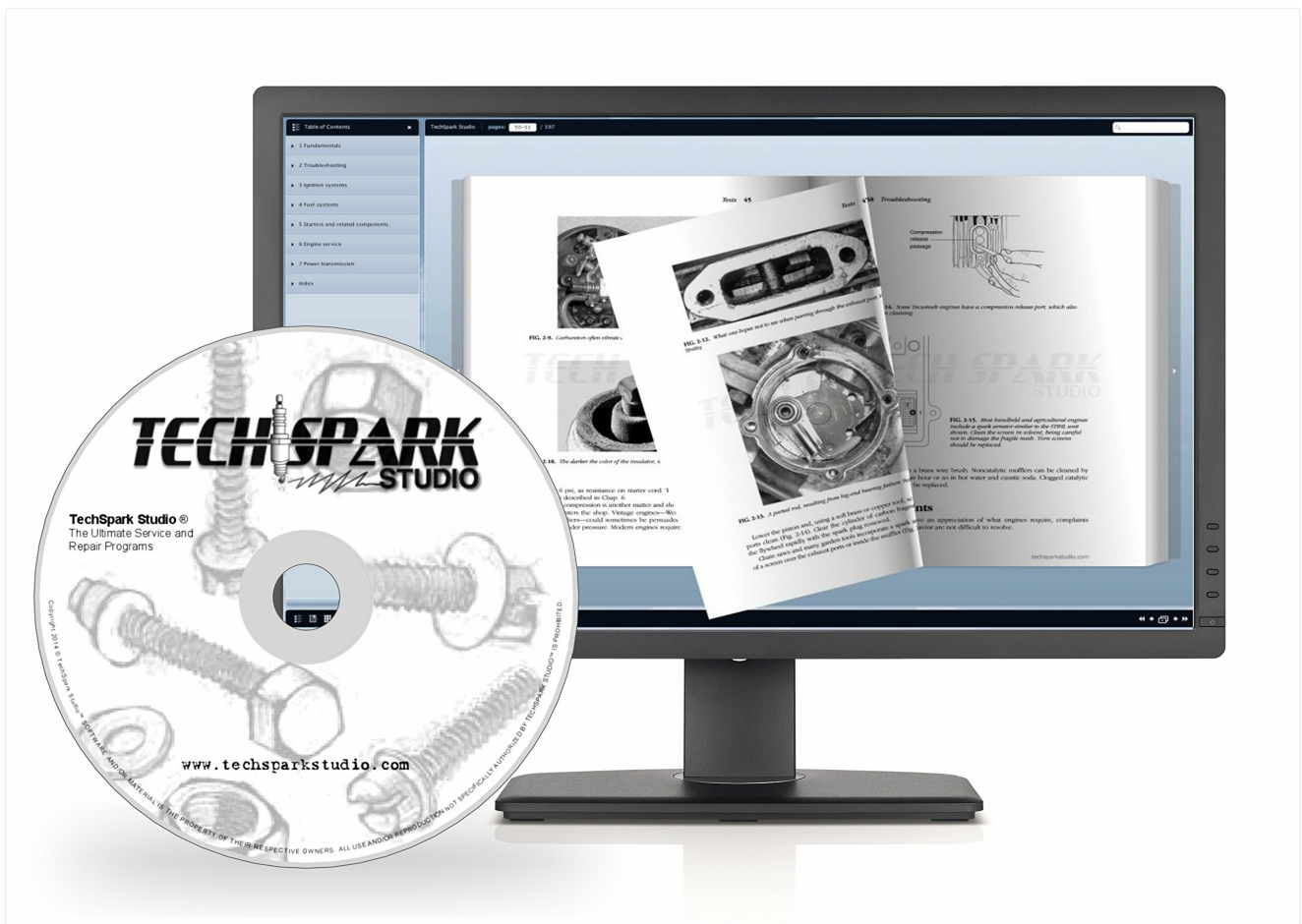
Figure 1.1: Digital service manual displayed on a laptop screen, showing detailed repair instructions.