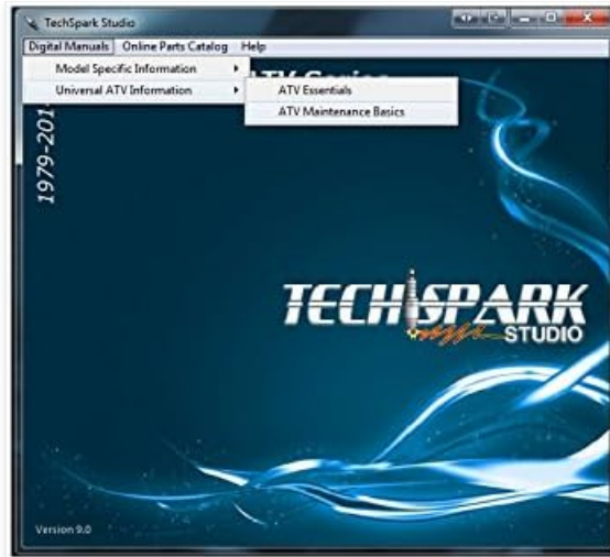
Figure 2.1: TechSpark Studio software main interface, showing navigation menus.