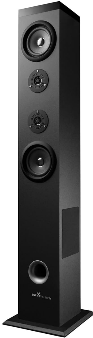
Image 1.1: Front view of the Energy System Tower 5 Bluetooth Speaker.