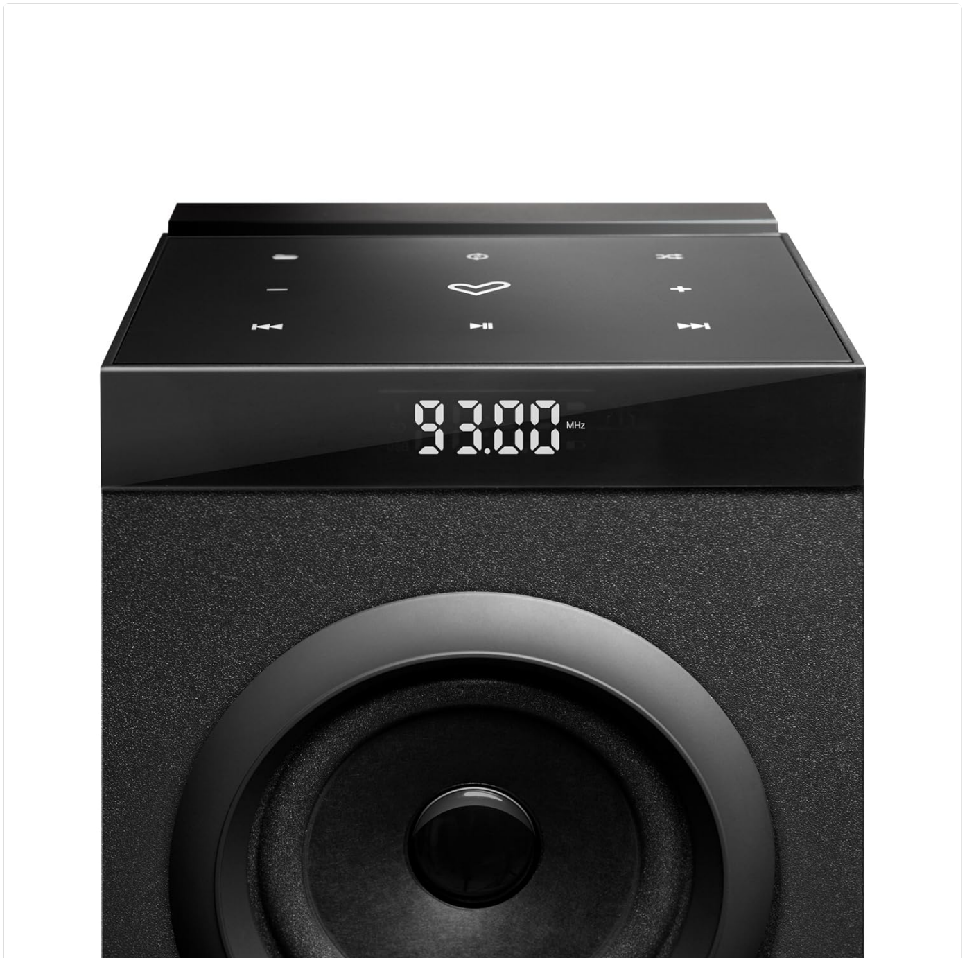
Image 2.1: Top panel with touch controls and digital display, showing FM radio frequency.