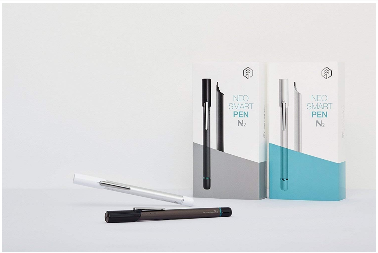
Figure 2: Neo Smartpen N2 and included accessories.