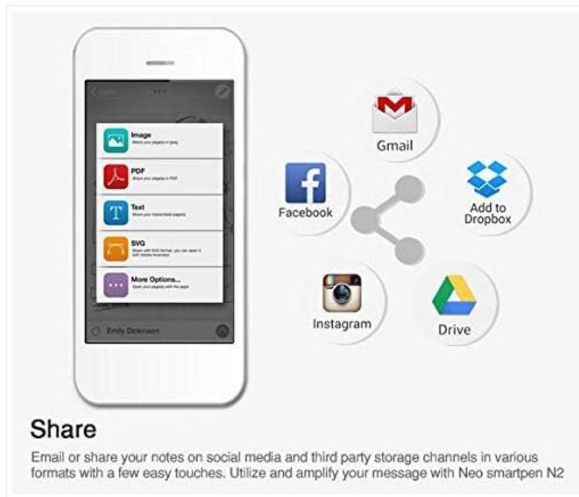
Figure 6: Sharing options available in the Neo Studio app.