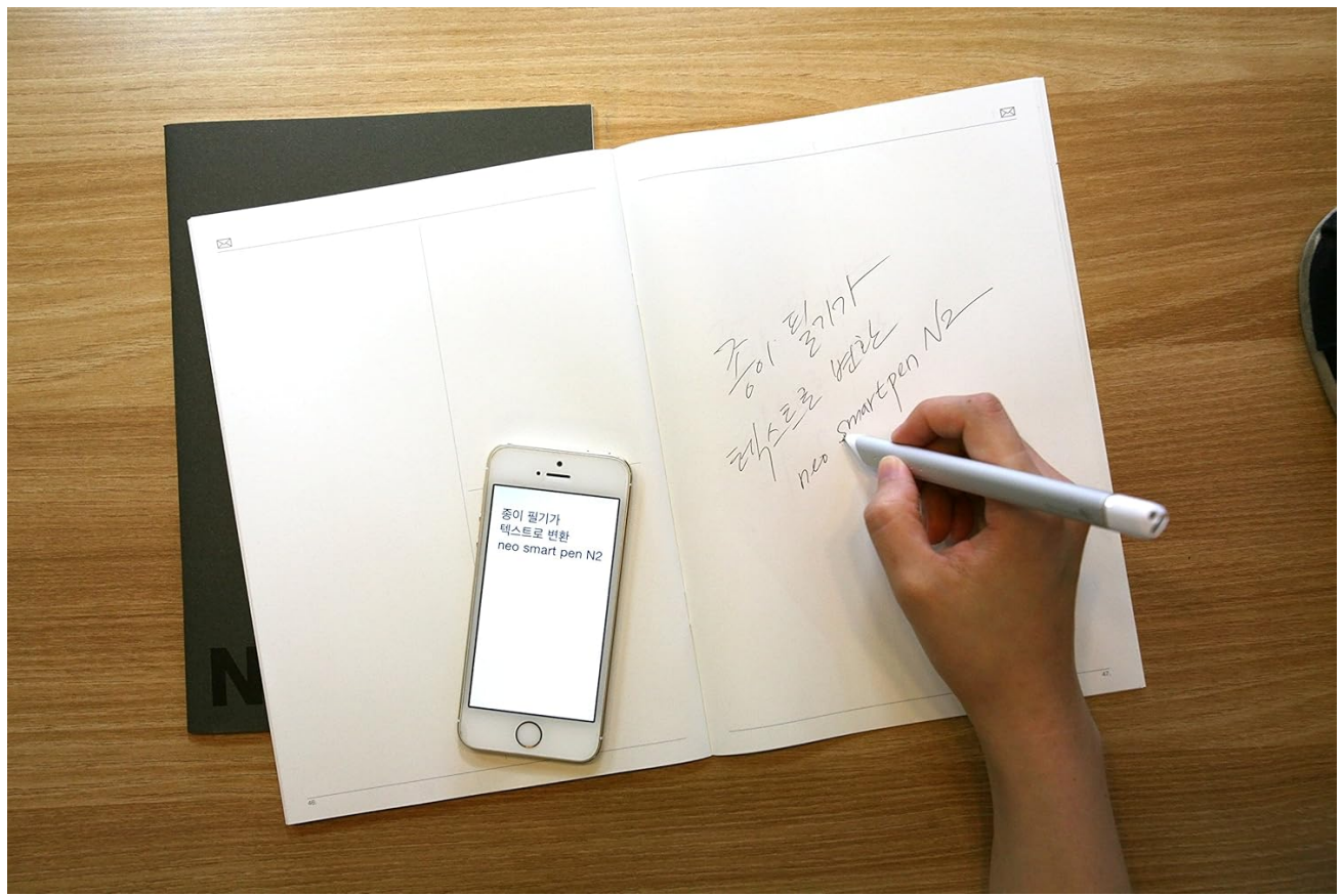
Figure 5: Real-time digitization of notes from paper to the Neo Studio app.

Use the Neo Smartpen N2 with Ncode paper (such as the N Pocket Notebook). Simply start writing as you would with a regular pen. The pen's infrared camera recognizes the Ncode patterns on the paper, digitizing your notes in real-time within the Neo Studio app.