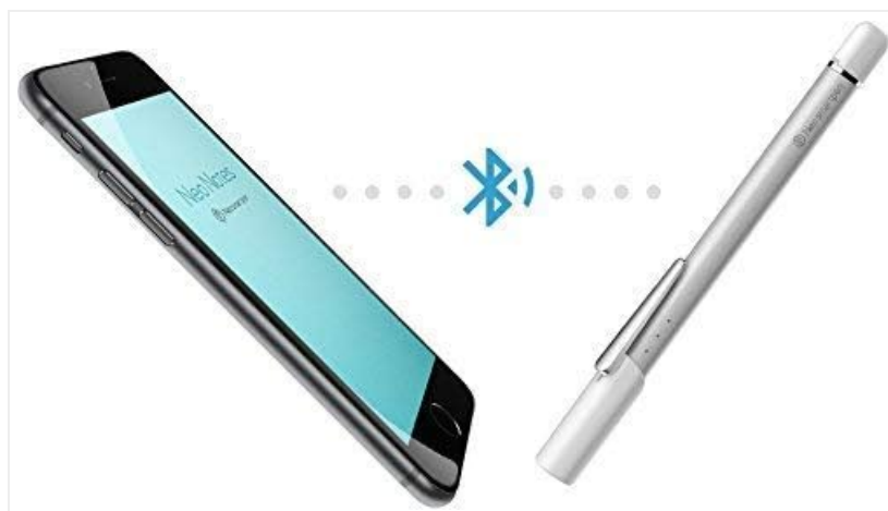
Figure 4: Bluetooth pairing process between the smartpen and a mobile device.

Open the Neo Studio app. If Bluetooth is not enabled, the app will prompt you to turn it on. Follow the on-screen instructions to register your Neo Smartpen N2. The app will search for the pen, and once connected, the pen icon in the app will stop blinking and turn white.