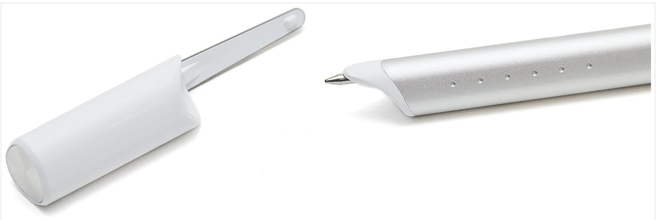
Figure 1: Front view of the Neo Smartpen N2.