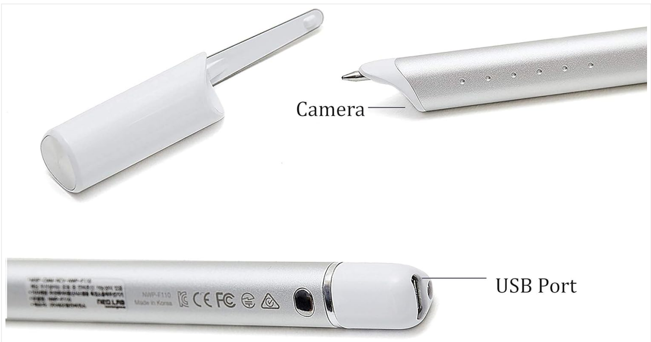
Figure 3: The Neo Smartpen N2 showing the camera and USB port.