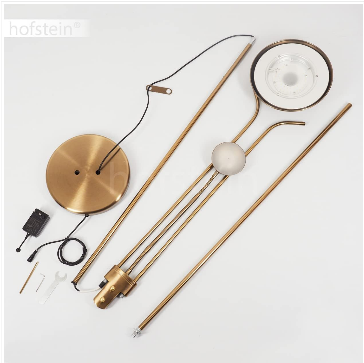
Figure 2: Overview of all parts included in the package, laid out for easy identification prior to assembly.