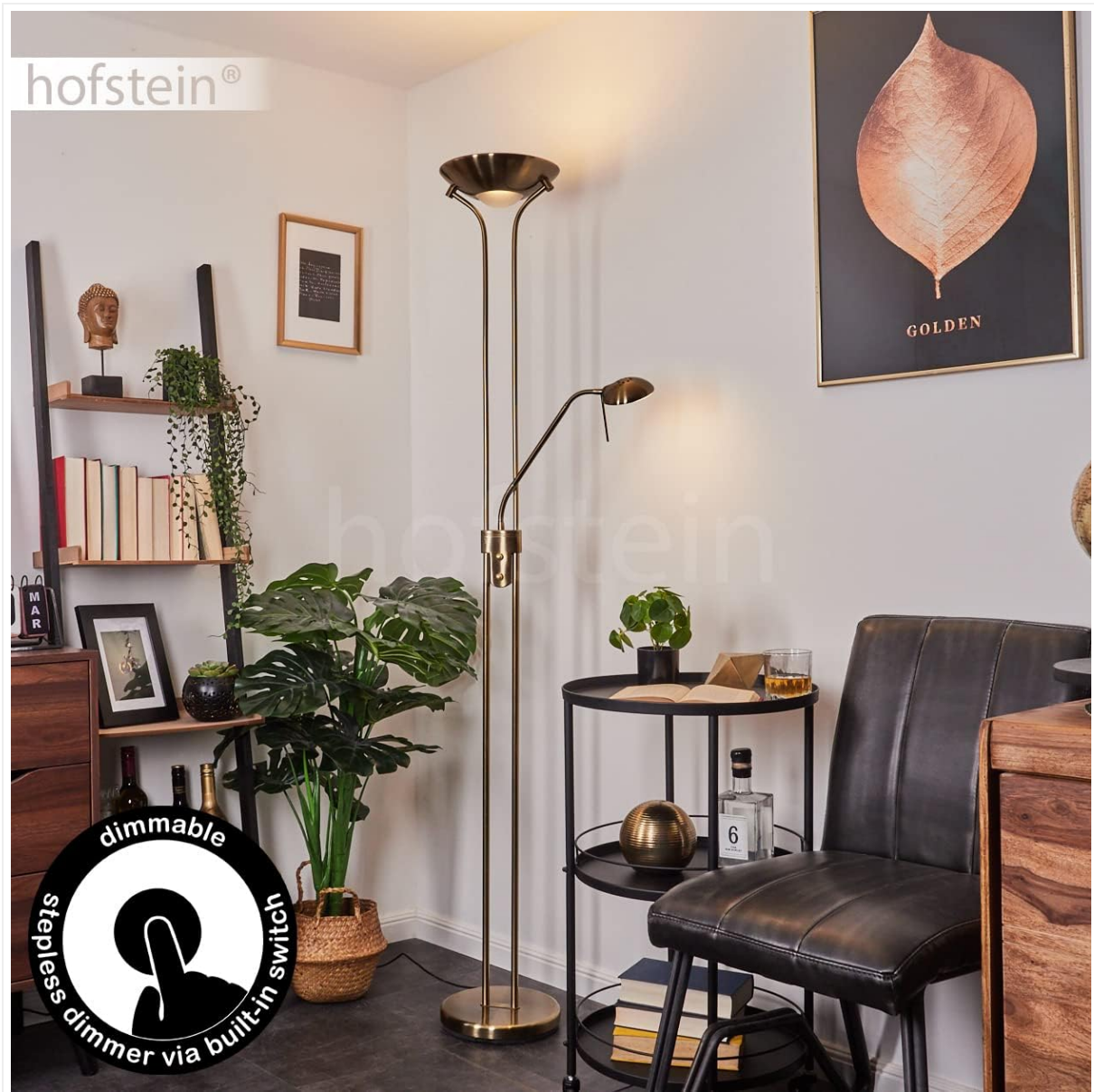
Figure 1: The Hofstein Rom LED Floor Lamp in a modern living room environment, showcasing its bronze finish and dual light sources.