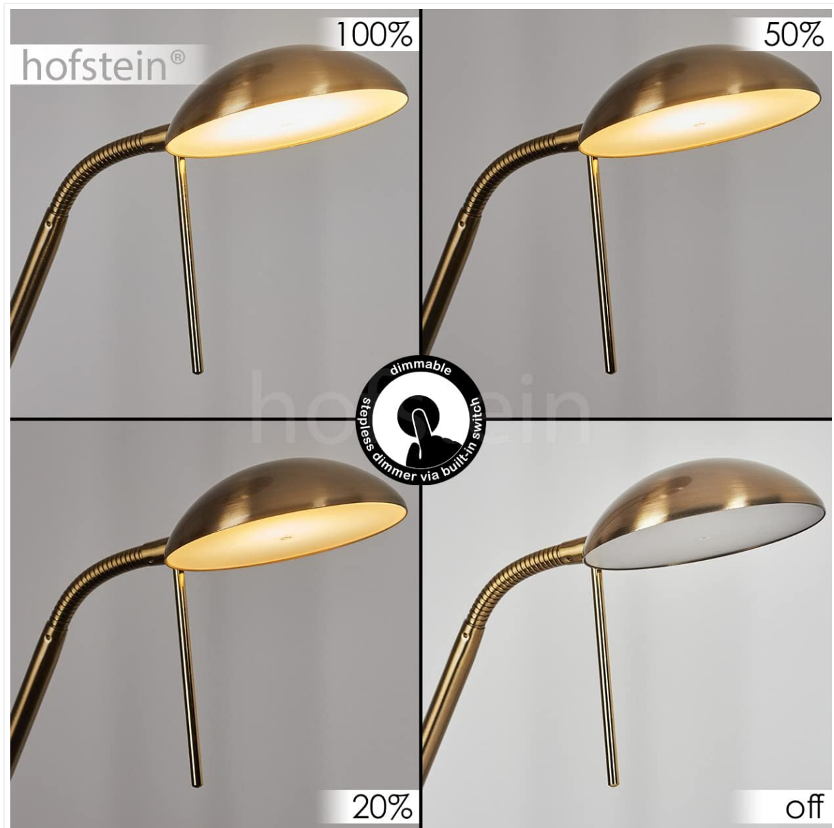
Figure 4: Visual representation of the stepless dimmer functionality, demonstrating light output from 100% to off.

The reading arm is flexible and can be adjusted to direct light precisely where needed. Gently bend the arm to position the light for reading or other tasks. Avoid excessive force or bending beyond its natural range of motion.