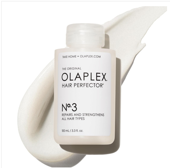
Image of the Olaplex No. 3 Hair Perfector bottle, 3.3 fl oz size.