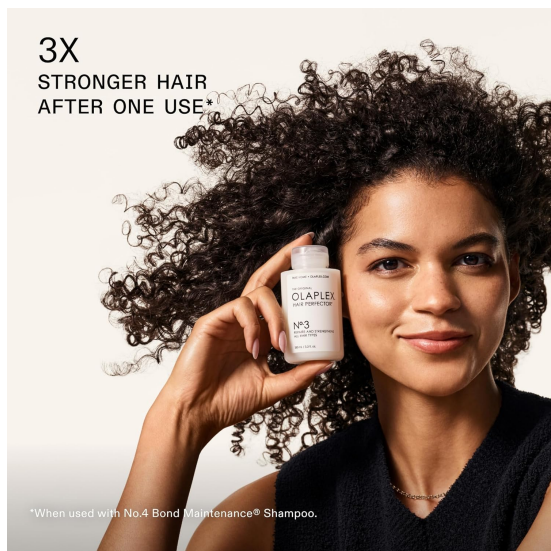
A woman with curly hair holding the Olaplex No. 3 bottle, illustrating the product's use for strengthening hair.