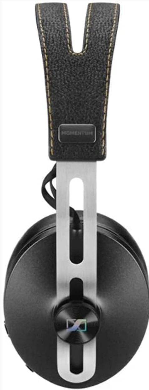
Top view showing the comfortable, padded headband and adjustable frame of the headphones.