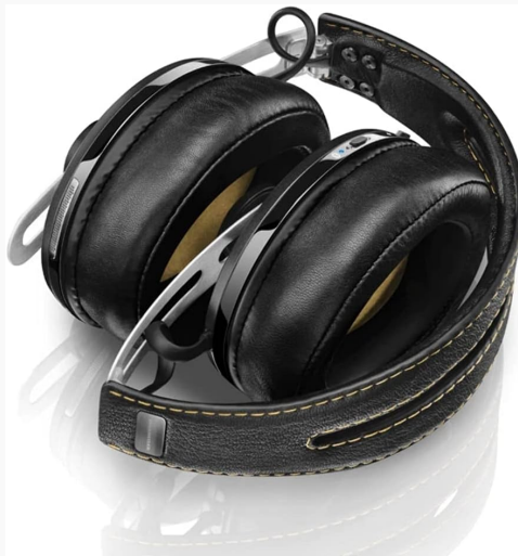
Front view of the Sennheiser Momentum 2.0 Wireless headphones, showcasing the over-ear design and premium materials.