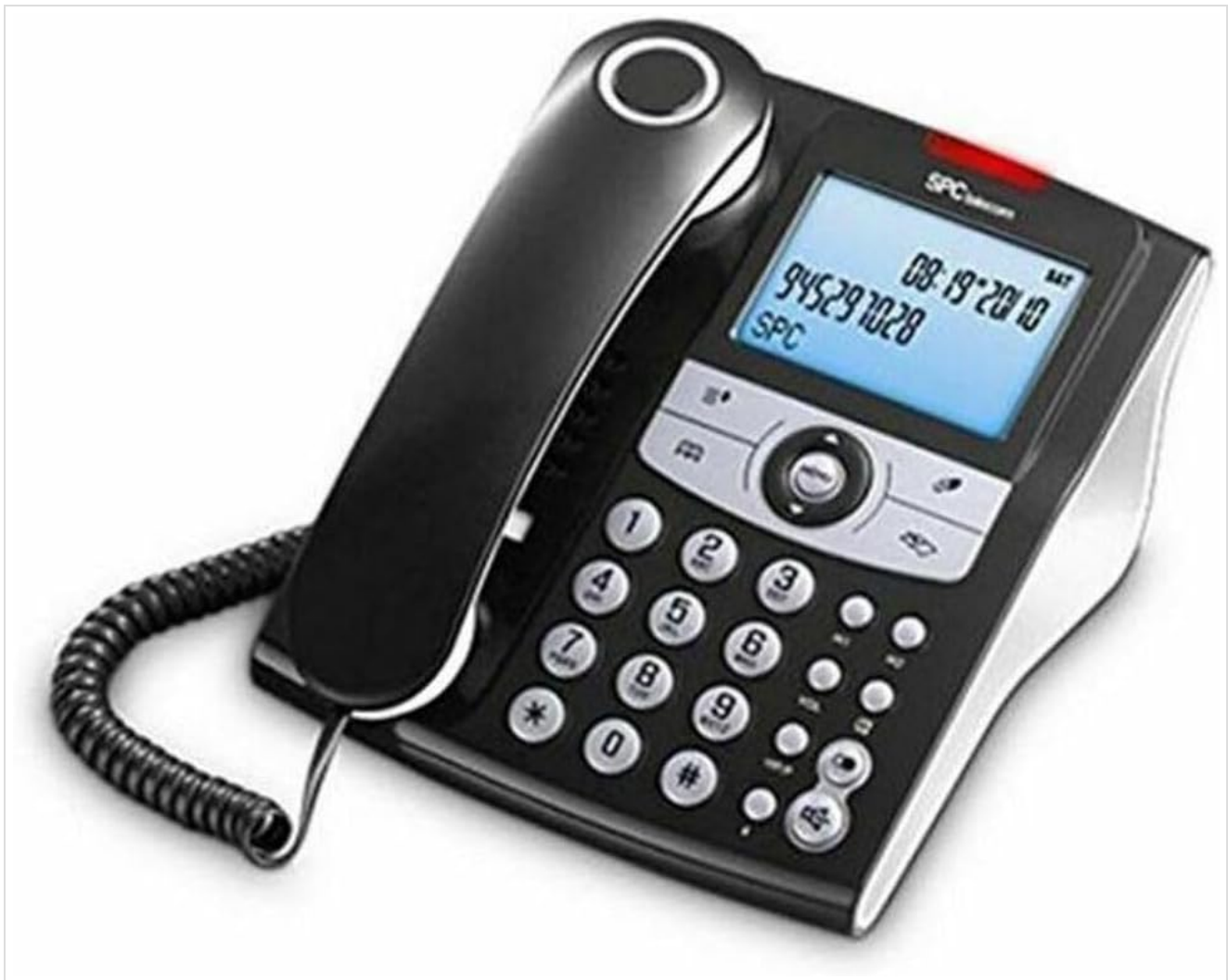
Figure 3.1: SPC Elegance ID Landline Telephone. This image shows the black telephone unit with its handset resting on the base. The blue backlit display shows a phone number and the current date and time. The numeric keypad and various function buttons are clearly visible.