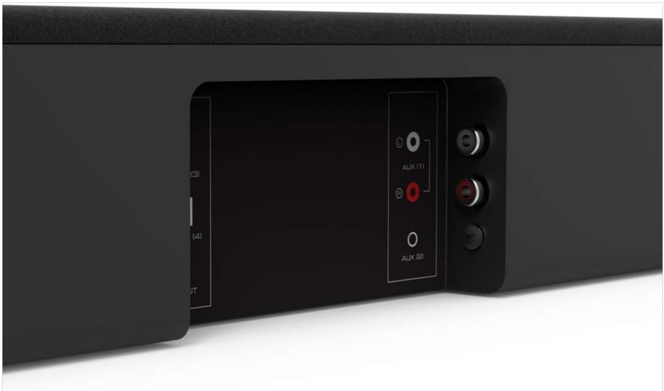
Figure 4: Close-up of the rear panel showing AUX (1) and AUX (2) input ports.