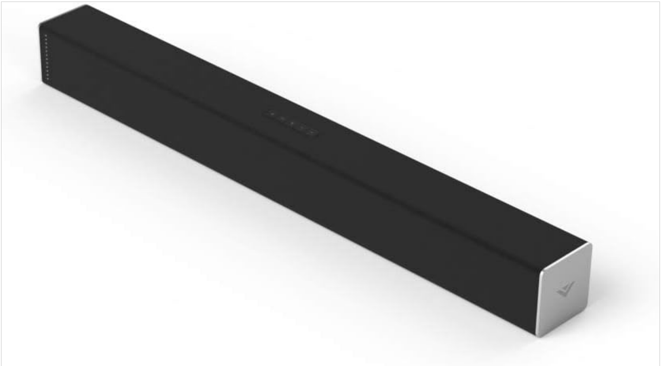
Figure 1: Front view of the VIZIO SB2920-C6 Sound Bar, showcasing its sleek, black design.