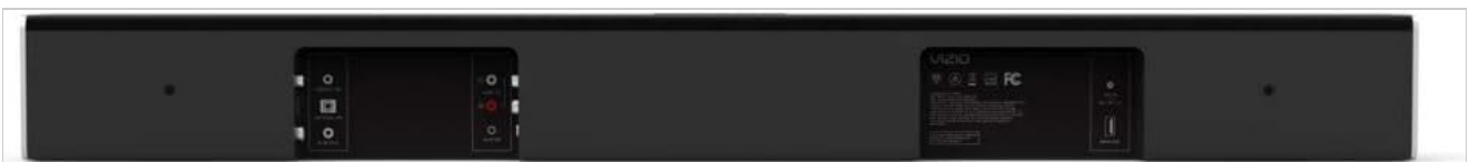
Figure 3: Full rear view of the sound bar, illustrating all available input and output ports.