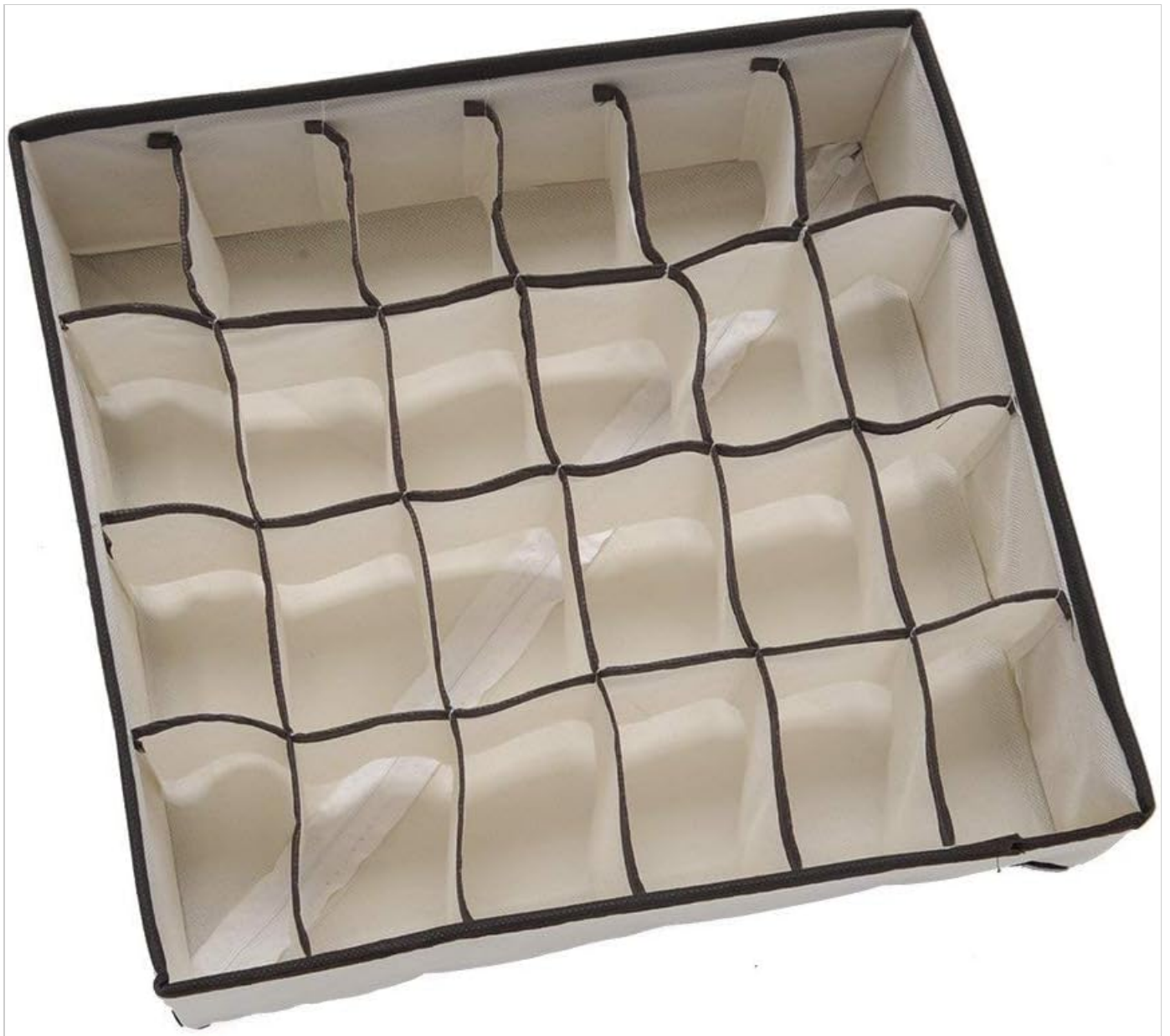
Image 3: A top-down view of the 24-grid organiser, highlighting its numerous compartments for small items.