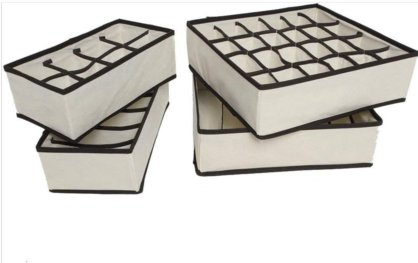
Image 2: The organisers are foldable, allowing for compact storage when not in use, as shown by these two stacked units.