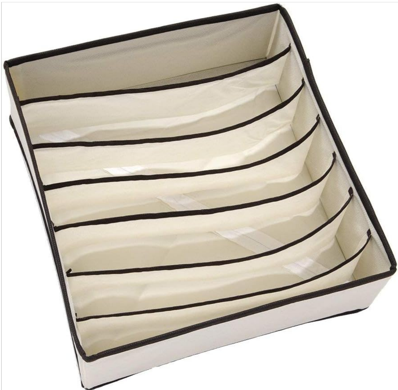
Image 4: A top-down view of the 6-grid organiser, demonstrating its larger compartments suitable for bras or scarves.