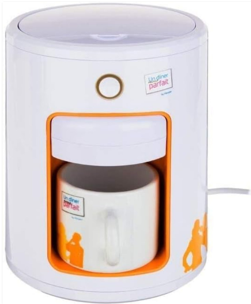
Figure 4.1: The two included coffee filters.