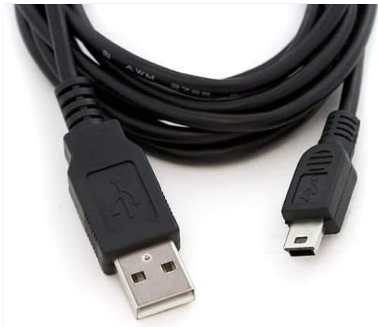
Image: Close-up of the USB-A and mini-USB connectors on the cable.

The cable features two distinct connectors: a standard USB-A connector (the larger, rectangular end) and a smaller mini-USB connector (the trapezoidal end).