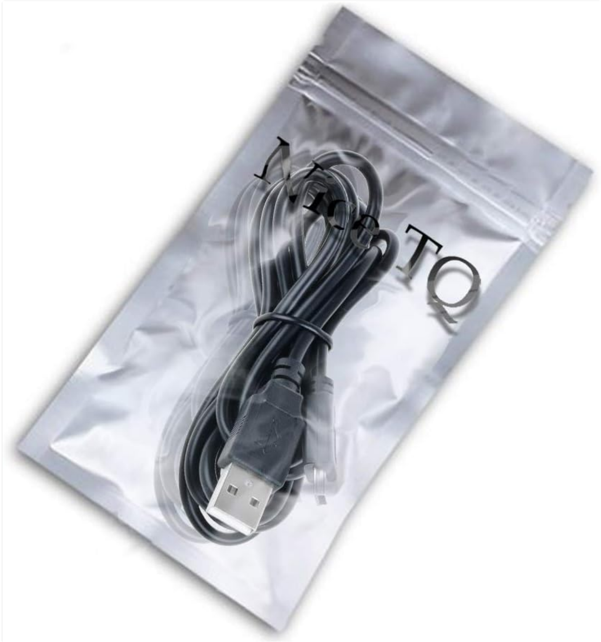
Image: The NiceTQ USB cable stored in its packaging, demonstrating proper care.