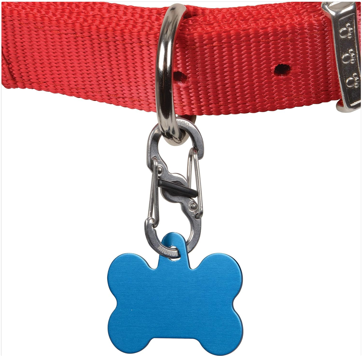
Image: The Nite Ize S-Biner TagLock securely attached to a red pet collar, holding a blue bone-shaped identification tag. This demonstrates the product in use on a pet's collar.