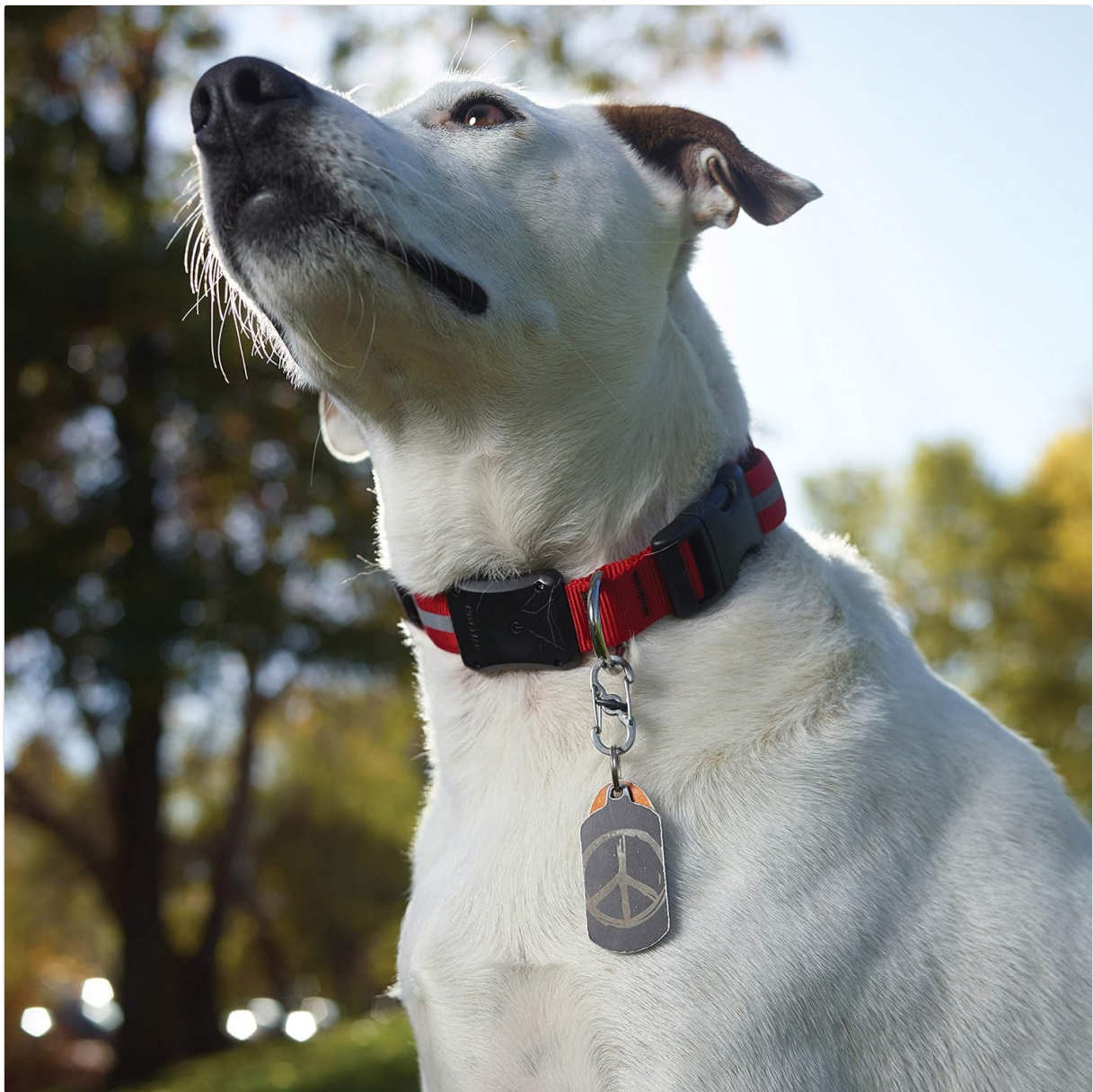
Image: A white dog with brown markings wearing a red collar, featuring the Nite Ize S-Biner TagLock holding a rectangular identification tag. The dog is looking upwards in an outdoor setting.