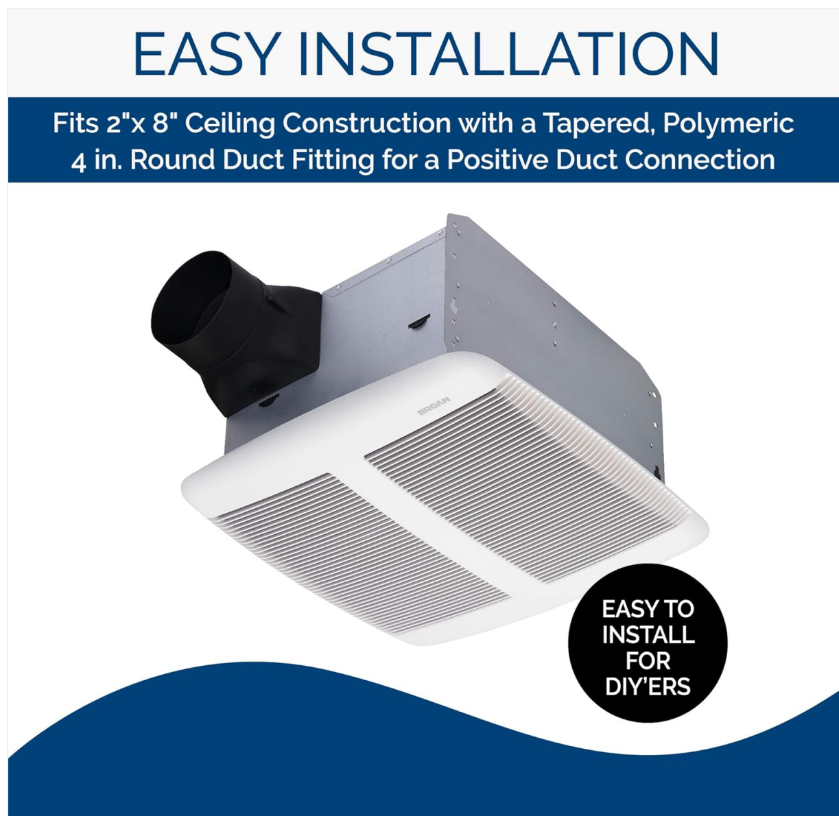
Image 5.1: The Broan-NuTone SPK110 fan housing with its duct connector, illustrating the easy installation process.

Video 5.1: An official video from Broan-NuTone demonstrating the features and installation of the Sensonic Bathroom Exhaust Fan with Bluetooth Speaker. This video highlights the product's quiet operation, powerful ventilation, and integrated Bluetooth audio capabilities, showing how it removes humidity and odor