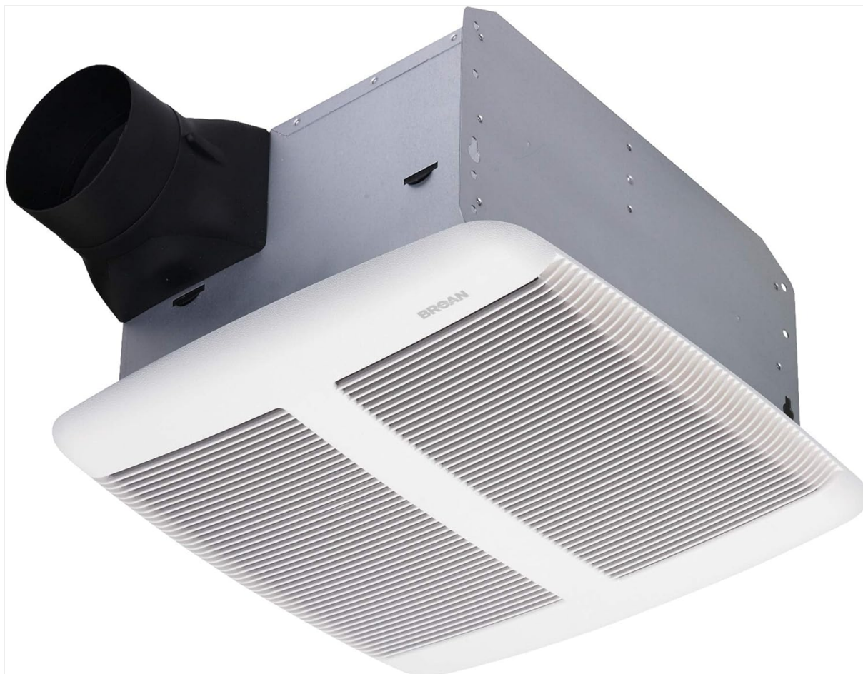
Image 1.1: The Broan-NuTone SPK110 Bluetooth Speaker Ventilation Fan, showcasing its sleek design and integrated grille.