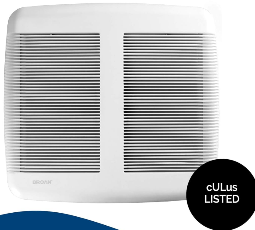
Image 6.1: The Broan-NuTone SPK110, highlighting its Bluetooth speaker functionality for seamless audio streaming.

Bathroom Exhaust Fan Equipped with Dual, High-Fidelity Sensonic™ Speakers with Bluetooth™ Functionality