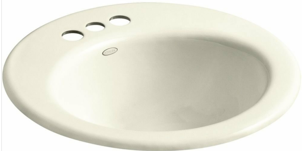
Image 1: KOHLER K-2917-4-FD Radiant Drop-In Bathroom Sink in Cane Sugar finish.