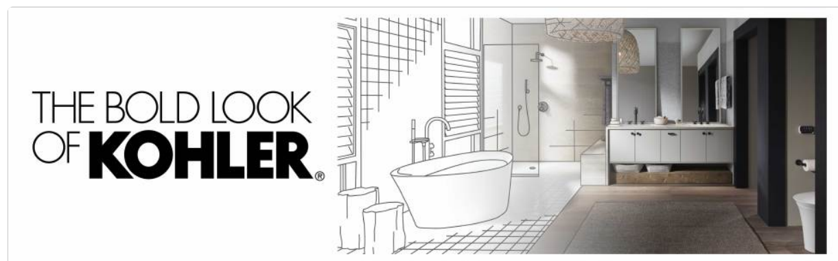
Image 2: General brand image showcasing 'The Bold Look of Kohler' with a bathroom design sketch.