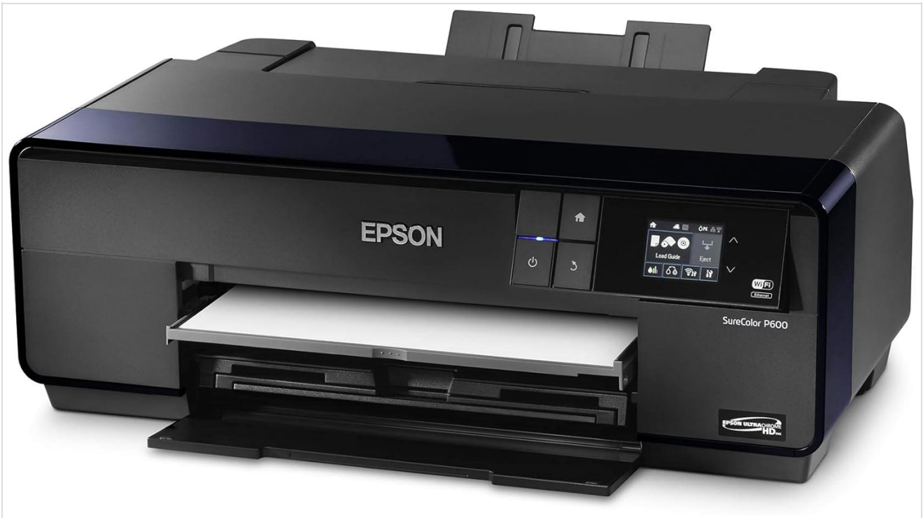
Figure 2: The front tray opened to access ink cartridge slots for installation.