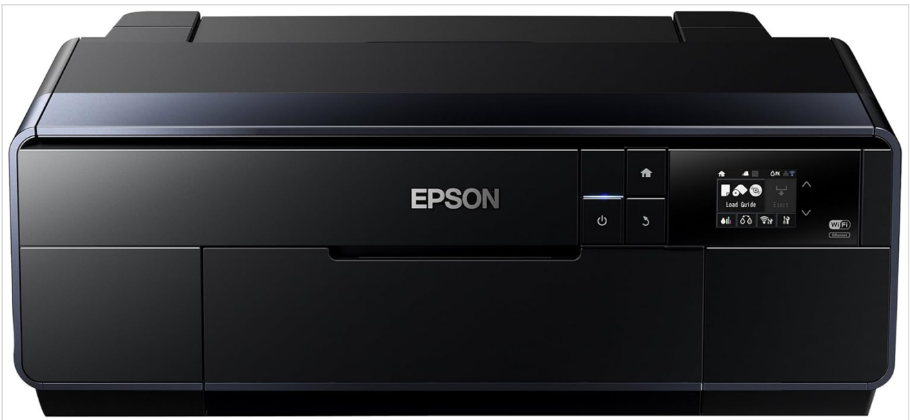
Figure 1: Front view of the Epson SureColor P600 Inkjet Printer.

This manual provides detailed instructions for the setup, operation, maintenance, and troubleshooting of your Epson SureColor P600 Inkjet Printer. Designed for professional-quality photo and fine art printing, this printer offers advanced features and versatile media handling capabilities.