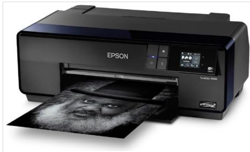
Figure 6: A black and white print being produced by the Epson SureColor P600, showcasing its versatility.