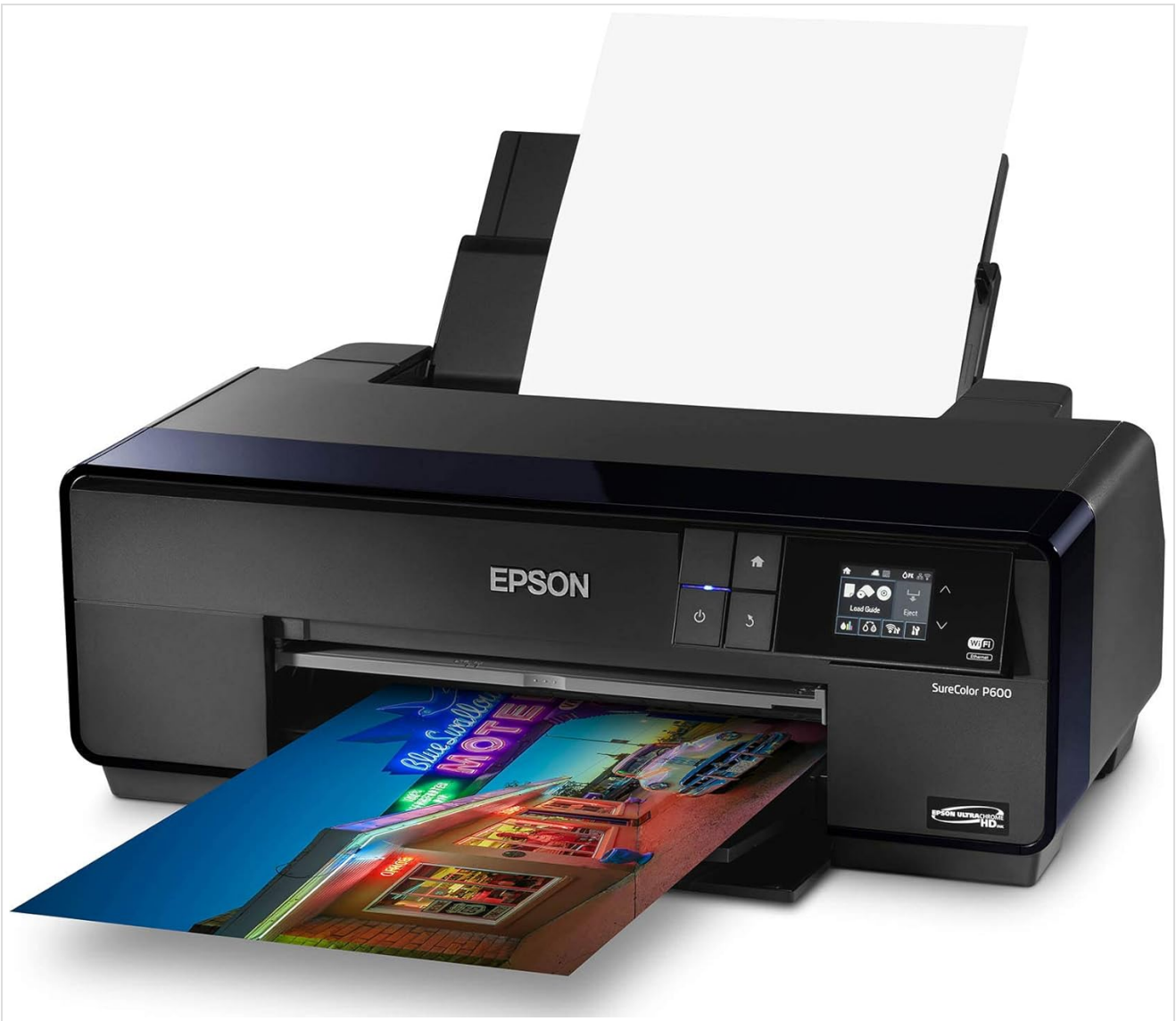
Figure 3: Paper loaded into the rear auto-sheet feeder.