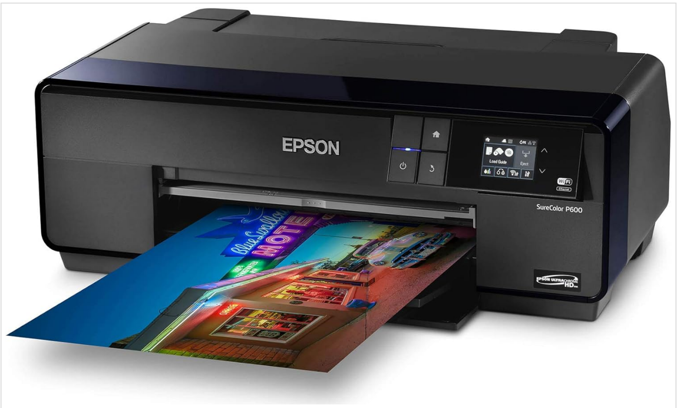
Figure 5: The Epson SureColor P600 in operation, producing a high-quality print.