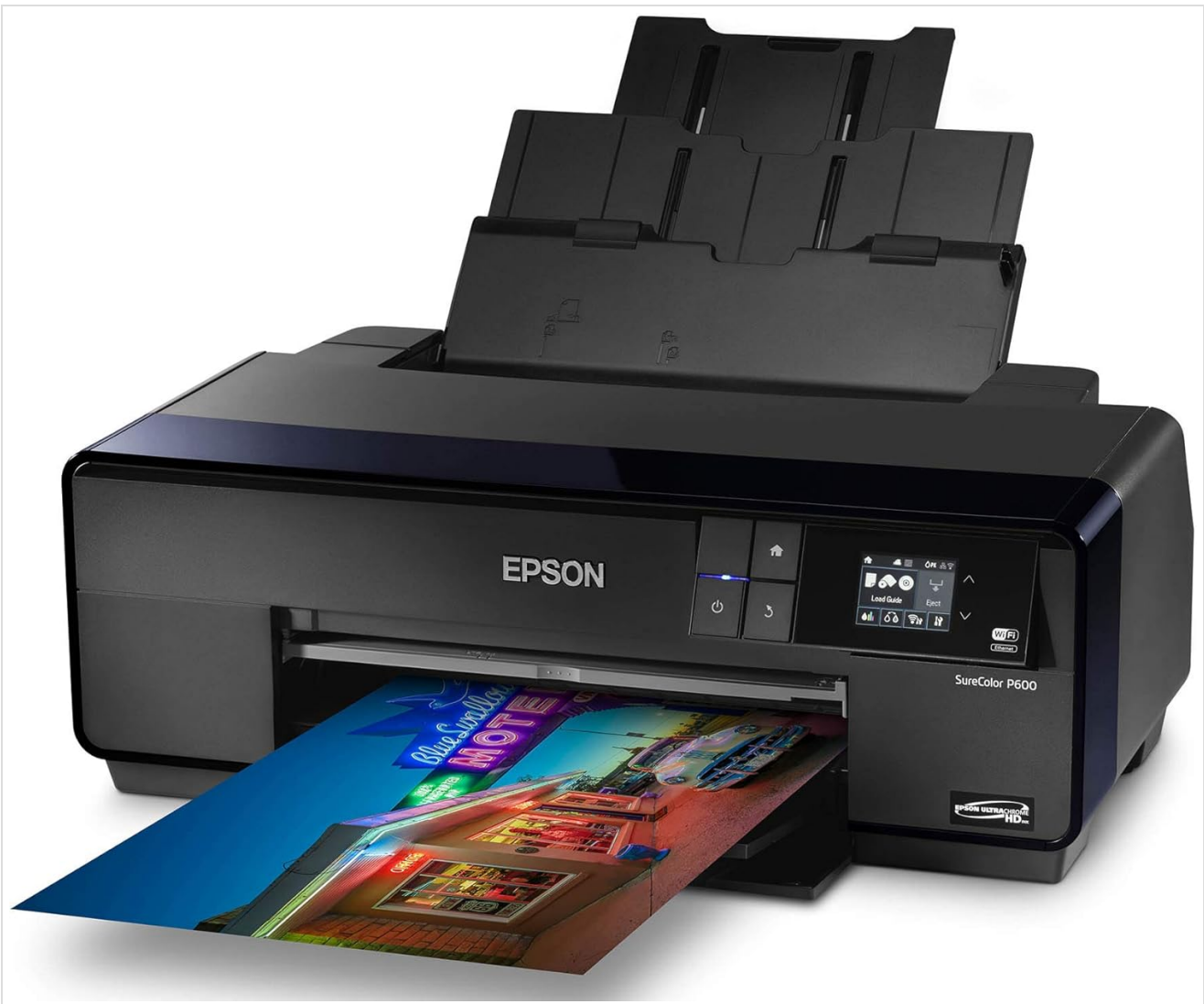
Figure 4: Printer with paper loaded and output trays extended, ready for printing.