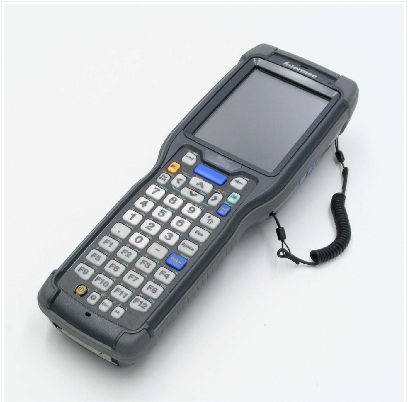
Figure 1: Front view of the Intermec CK71 Ultra-Rugged Mobile Computer. This image displays the device's robust design, including its numeric keypad, display screen, and the integrated scanner at the top. A wrist strap is visible on the right side.