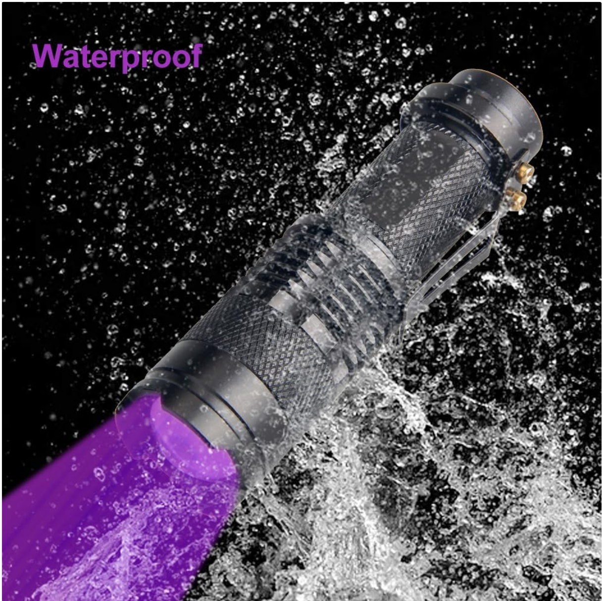
Image 6: The WINDFIRE SK68-UV flashlight is shown with water splashing over it, indicating its water-resistant design. This feature helps protect the device from splashes and light rain.