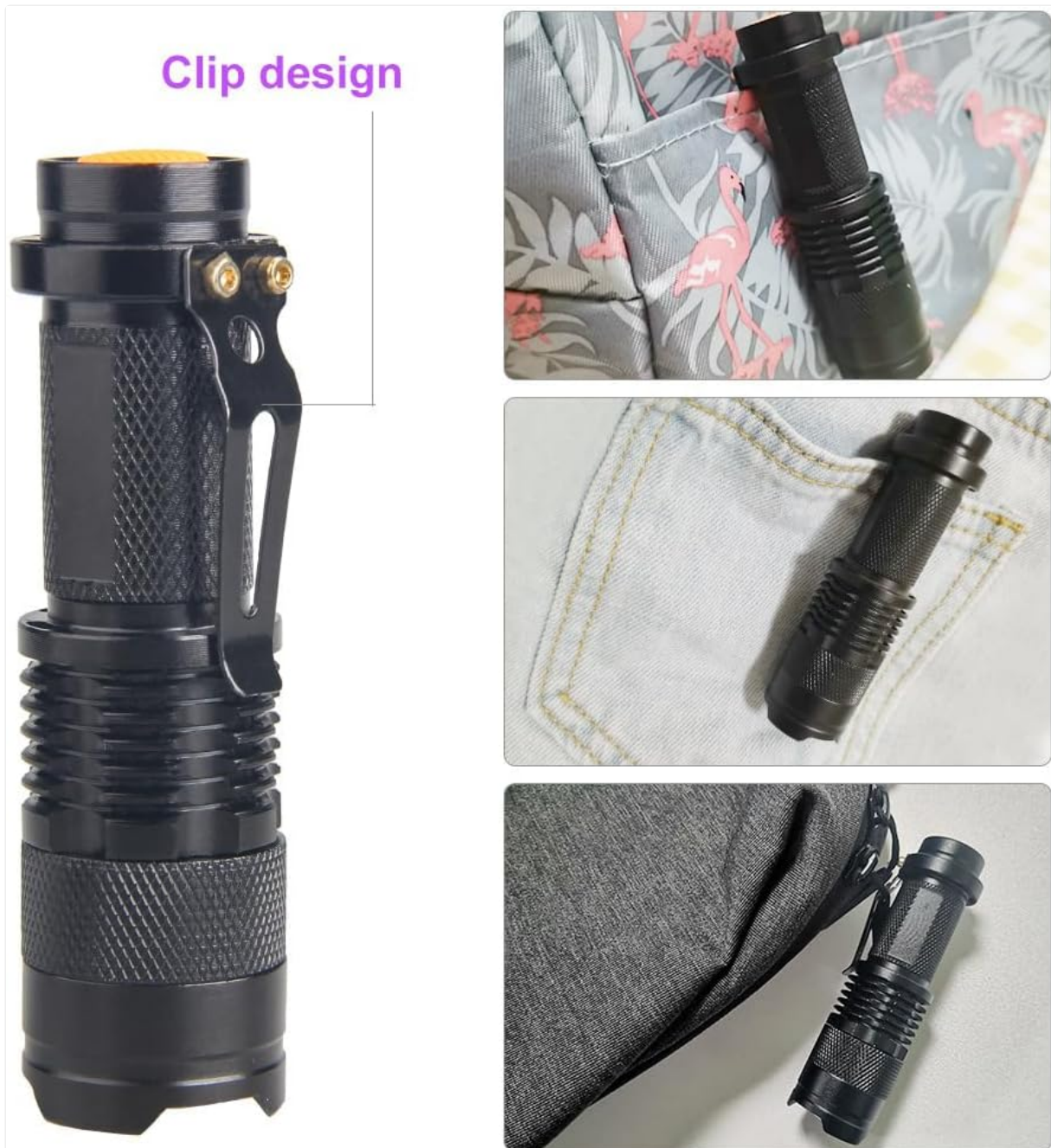
Image 3: Highlights the integrated clip design of the flashlight, illustrating how it can be conveniently carried by attaching it to a hat, pocket, or bag.

The flashlight includes a durable clip for easy attachment to pockets, belts, or bags, enhancing its portability.