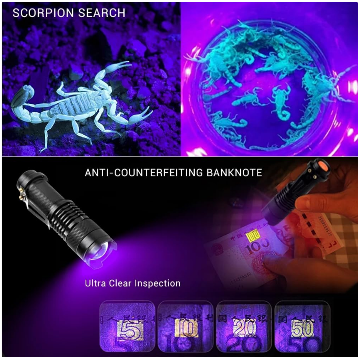
Image 5: Shows the flashlight being used for "SCORPION SEARCH," where scorpions glow brightly under UV light, and for "ANTI-COUNTERFEITING BANKNOTE" inspection, highlighting security features on currency.