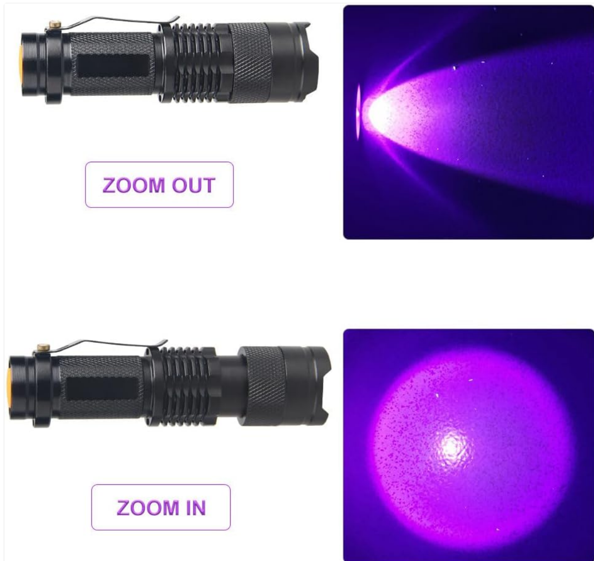
Image 2: Demonstrates the zoom functionality of the flashlight, showing a wide, diffused UV beam when "ZOOM OUT" and a concentrated, focused UV beam when "ZOOM IN".