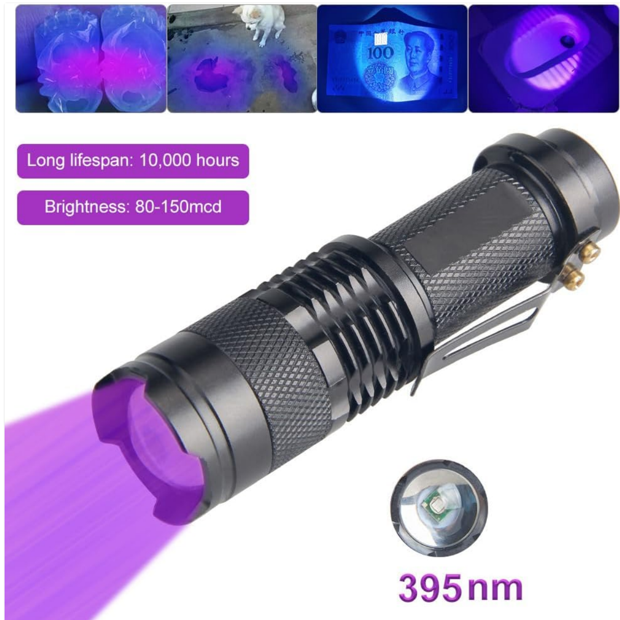
Image 1: WINDFIRE SK68-UV UV Flashlight showcasing its purple beam and various applications such as detecting pet urine, counterfeit money, and scorpions. Key specifications like 10,000 hours lifespan, 80-150mcd brightness, and 395nm wavelength are highlighted.