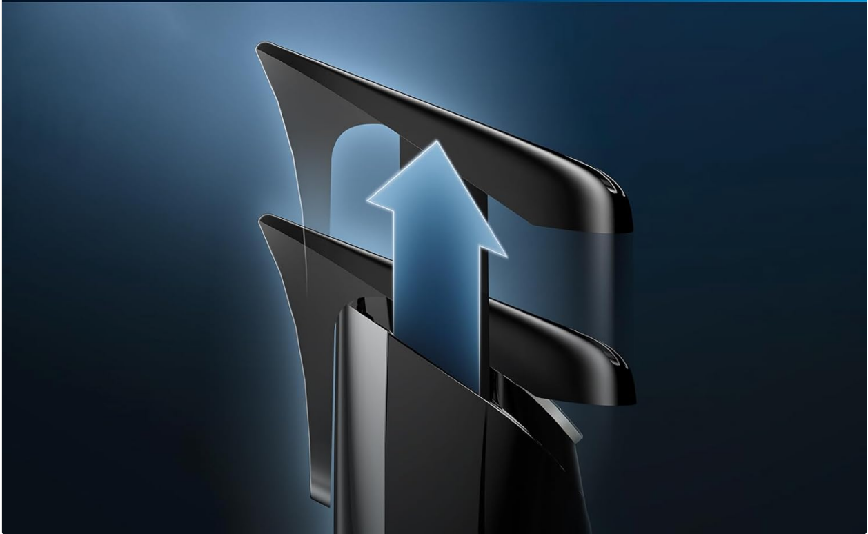
Image: The memory function button, allowing users to save preferred length settings.