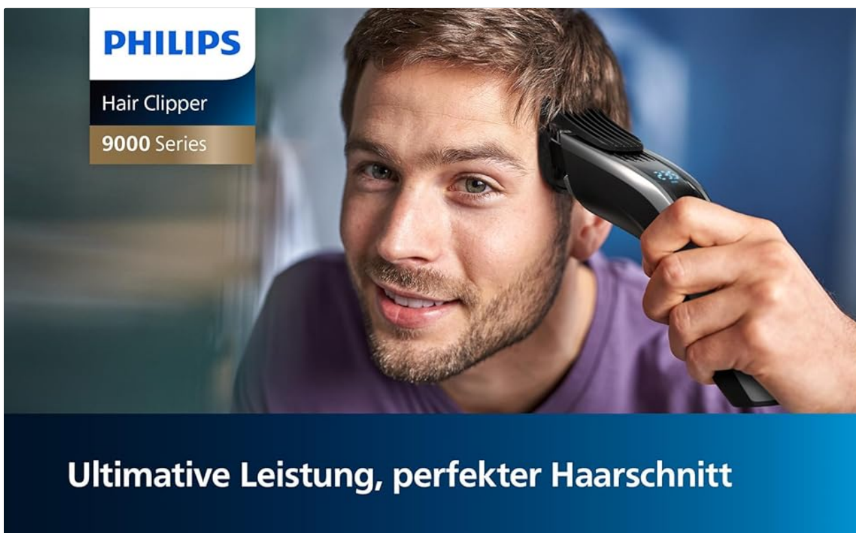
Image: A user demonstrating the Philips Hair Clipper in action, highlighting its ease of use for a perfect haircut.

The PowerAdapt sensor automatically activates the turbo function when it detects thicker hair, increasing motor speed for an effortless cut. No manual activation is required for this feature.