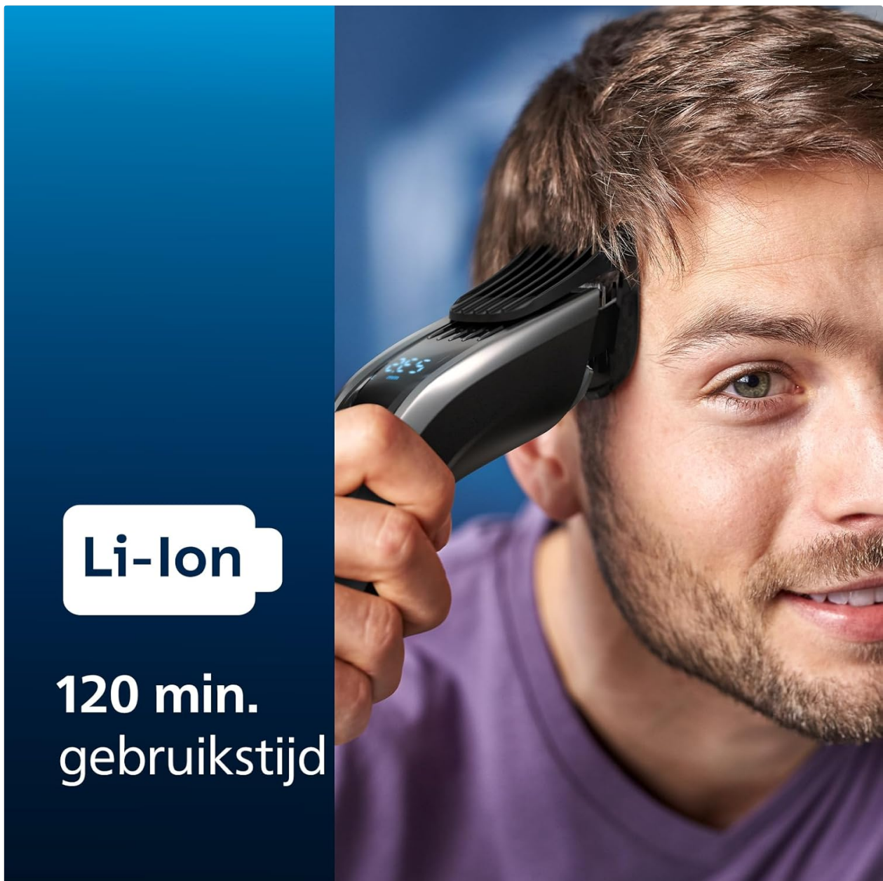
Image: The clipper with an overlay indicating its 120-minute cordless operating time thanks to its Li-ion battery.