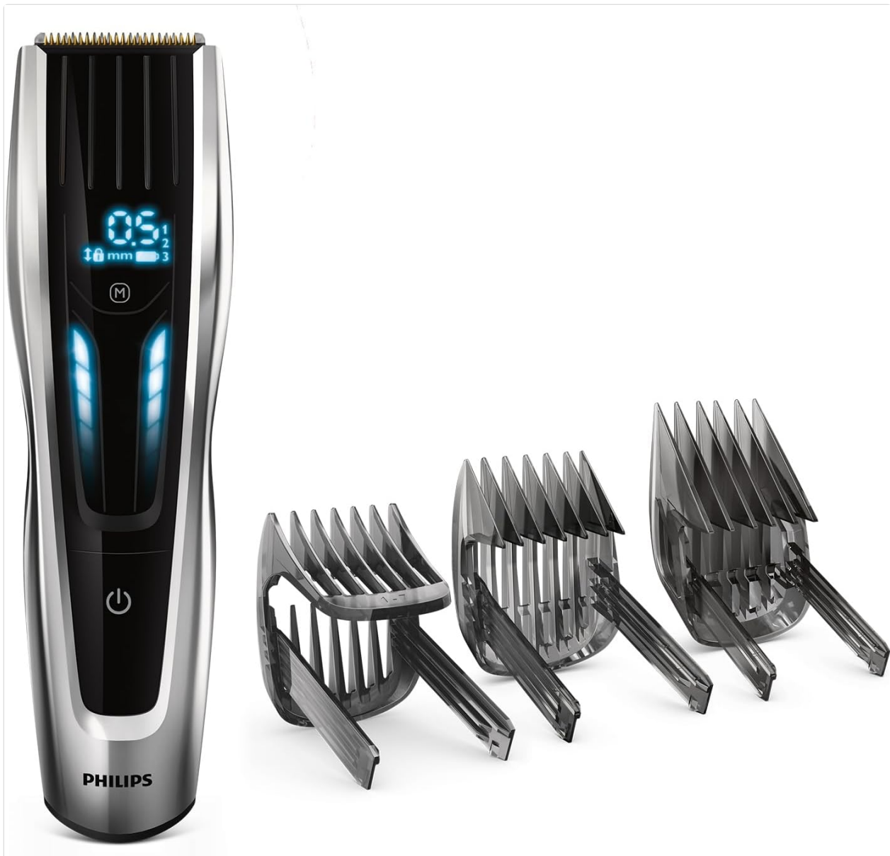
Image: The Philips Hair Clipper Series 9000 unit shown alongside its three adjustable comb attachments.