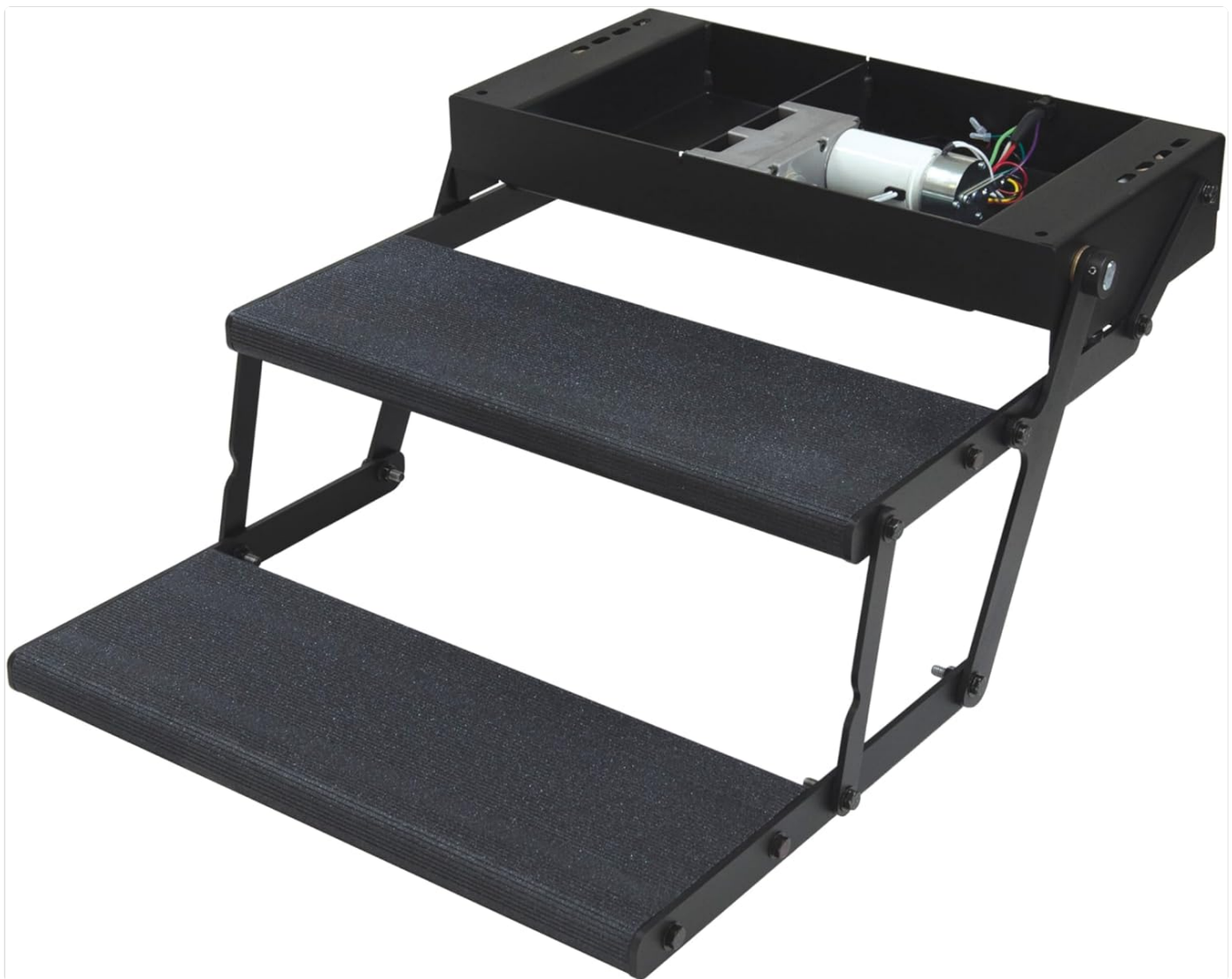
Image: The Lippert Tread Lite RV Power Steps in a 24-inch double electric foldout configuration, showcasing the robust design and integrated motor housing.