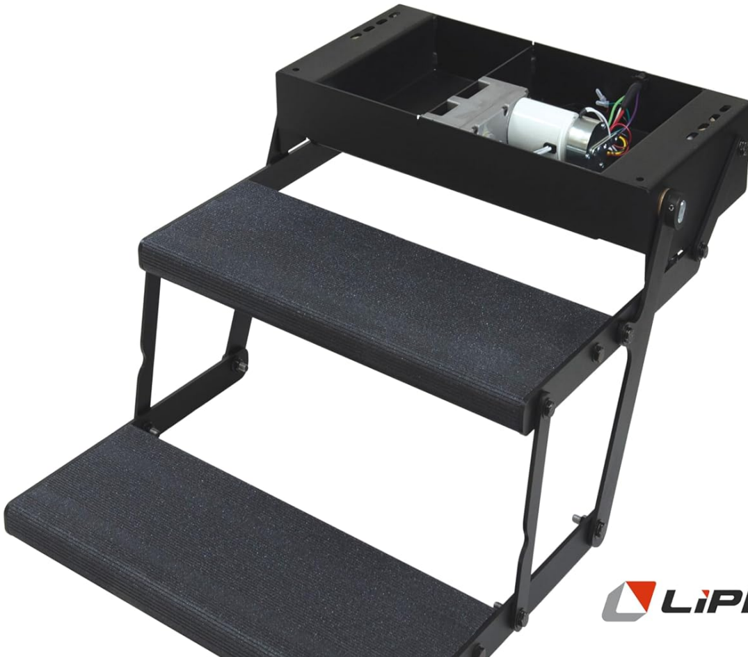
Image: Close-up view of the RV steps, illustrating the integrated LED lights that illuminate the stepping surface for night operation.

Integrated LED lights activate automatically as the steps extend