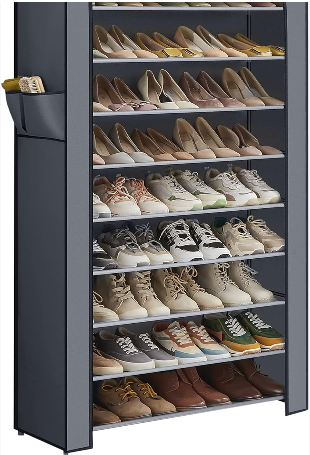
Figure 2.1: Fully assembled SONGMICS 9-Tier Shoe Rack, showcasing its capacity and design.