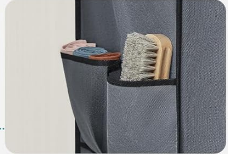
Extra Side Pockets