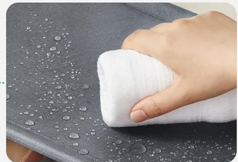
Water-Resistant Fabric Shelf