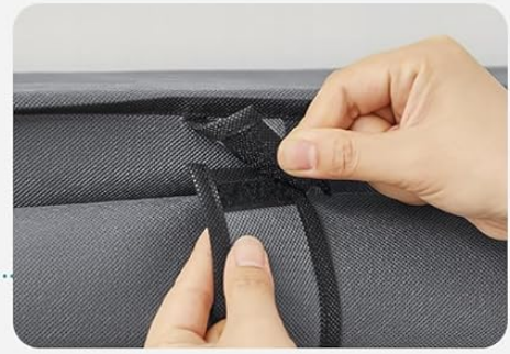
Hook and Loop Fastener