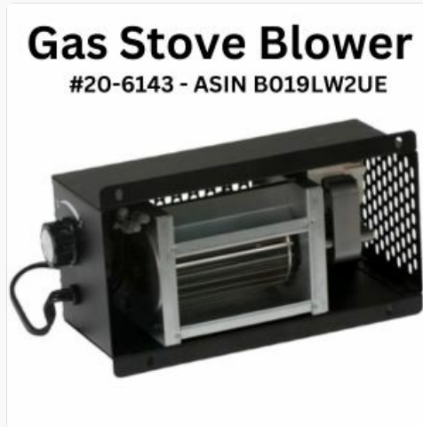
Image 5.1: Optional Gas Stove Blower for improved heat distribution.

For enhanced heat circulation, an optional blower (Model #20-6143, ASIN B0119LW2UE) can be installed. Refer to the blower's separate instruction manual for installation details.