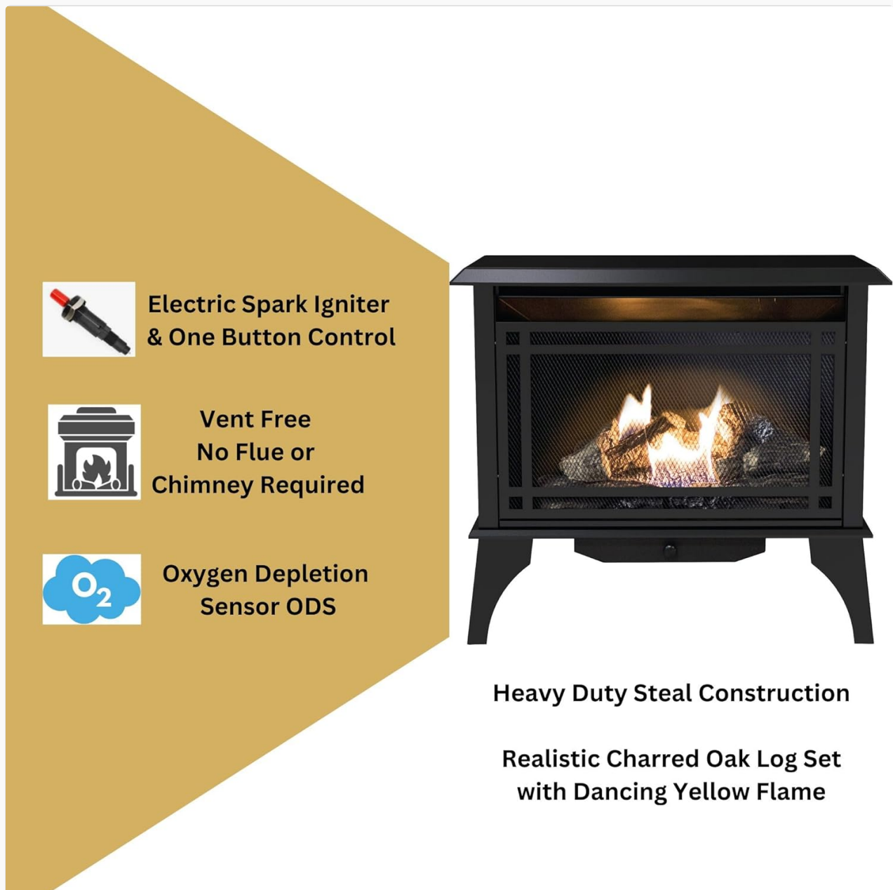
Image 5.2: Key features of the Comfort Glow Monterey GSD2846, including its vent-free design and safety sensors.