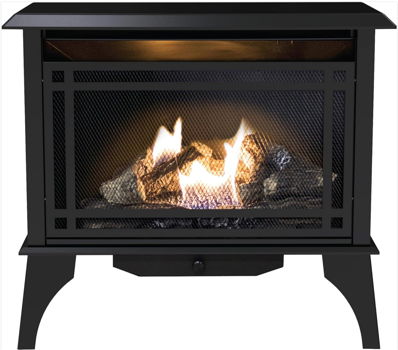
Image 1.1: The Comfort Glow Monterey GSD2846 Ventless Gas Fireplace in operation, showcasing its realistic oak log set and dancing yellow flames.