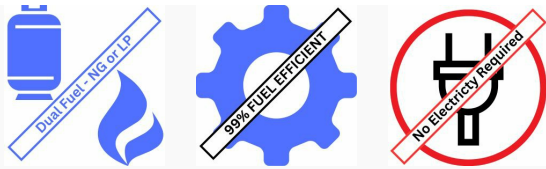
Image 5.3: Icons illustrating Dual Fuel capability, 99% fuel efficiency, and no electricity requirement for basic operation.