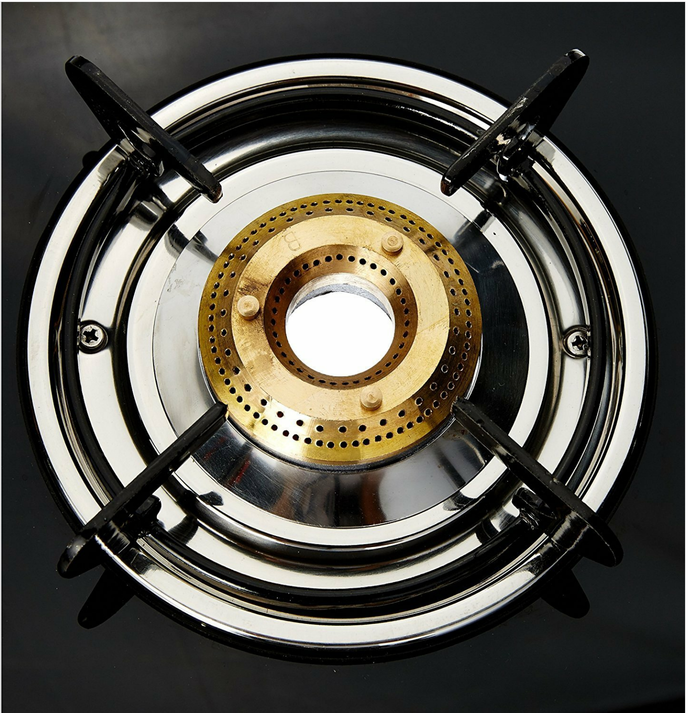
Figure 3: Detailed view of a brass burner and its surrounding pan support, highlighting the design for even flame distribution.