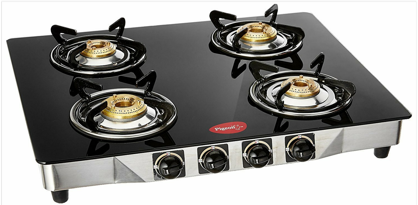
Figure 1: Top view of the Pigeon by Stovekraft 4 Burner Gas Stove, showcasing the black toughened glass top, four brass burners, and control knobs.