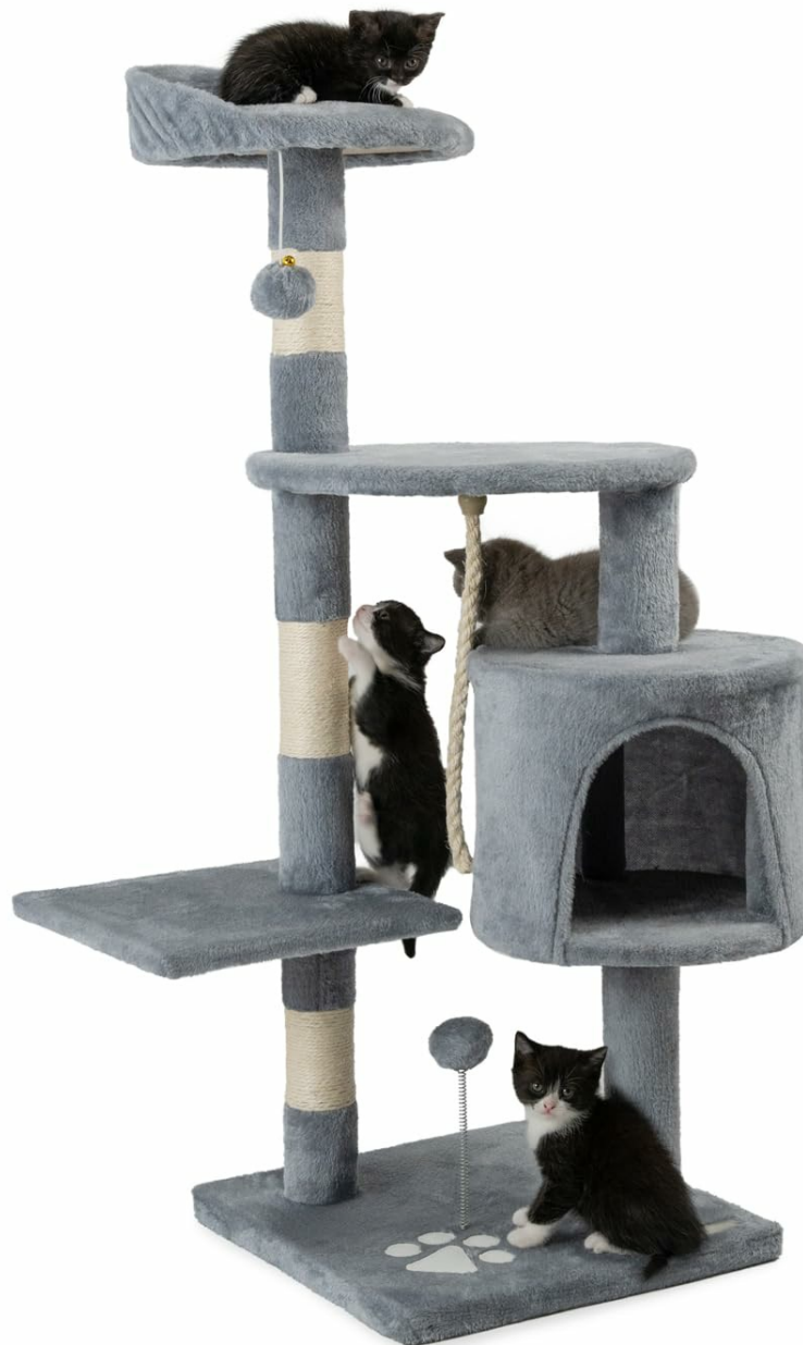
Image: The fully assembled lionto Cat Scratching Tree, showing its multi-level design and integrated cat cave.