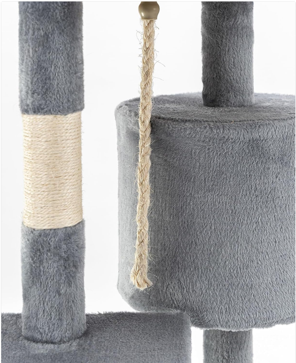
Image: Sisal-wrapped post for scratching and a hanging rope toy for engagement.