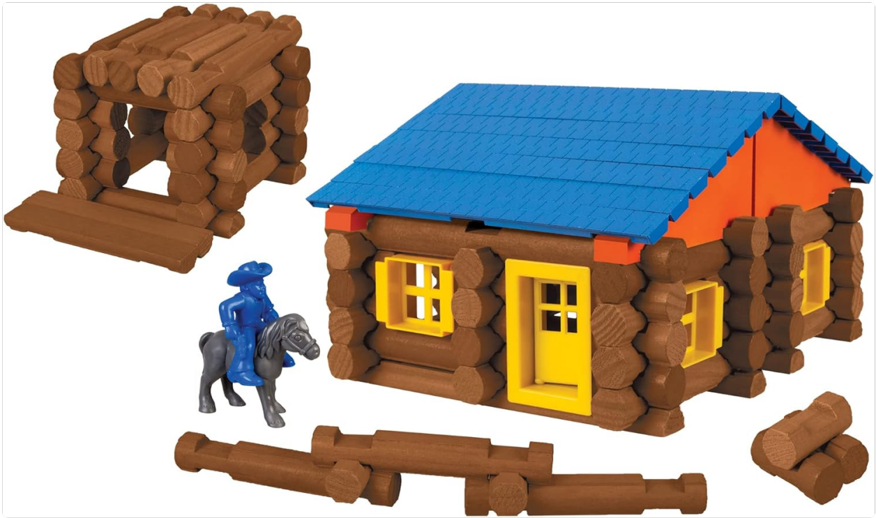
Image: All 137 pieces of the LINCOLN LOGS Oak Creek Lodge set are displayed, showing the variety of wooden logs, blue and orange plastic roof components, yellow plastic windows and doors, and the cowboy and horse figures.