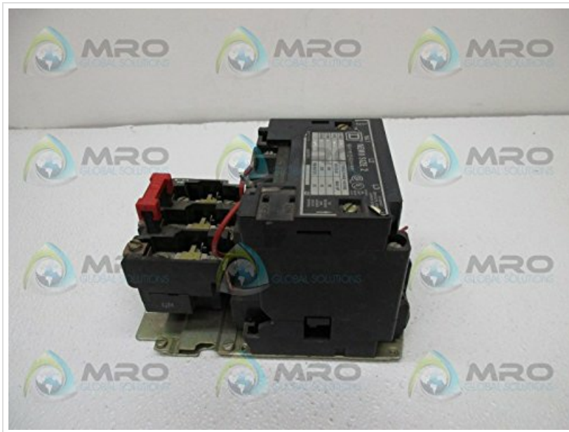
Figure 3.2: Side view of the Square D 8536-SD01 Series A Motor Starter. This perspective highlights the depth and mounting points of the unit, showing the robust construction and terminal block arrangement.