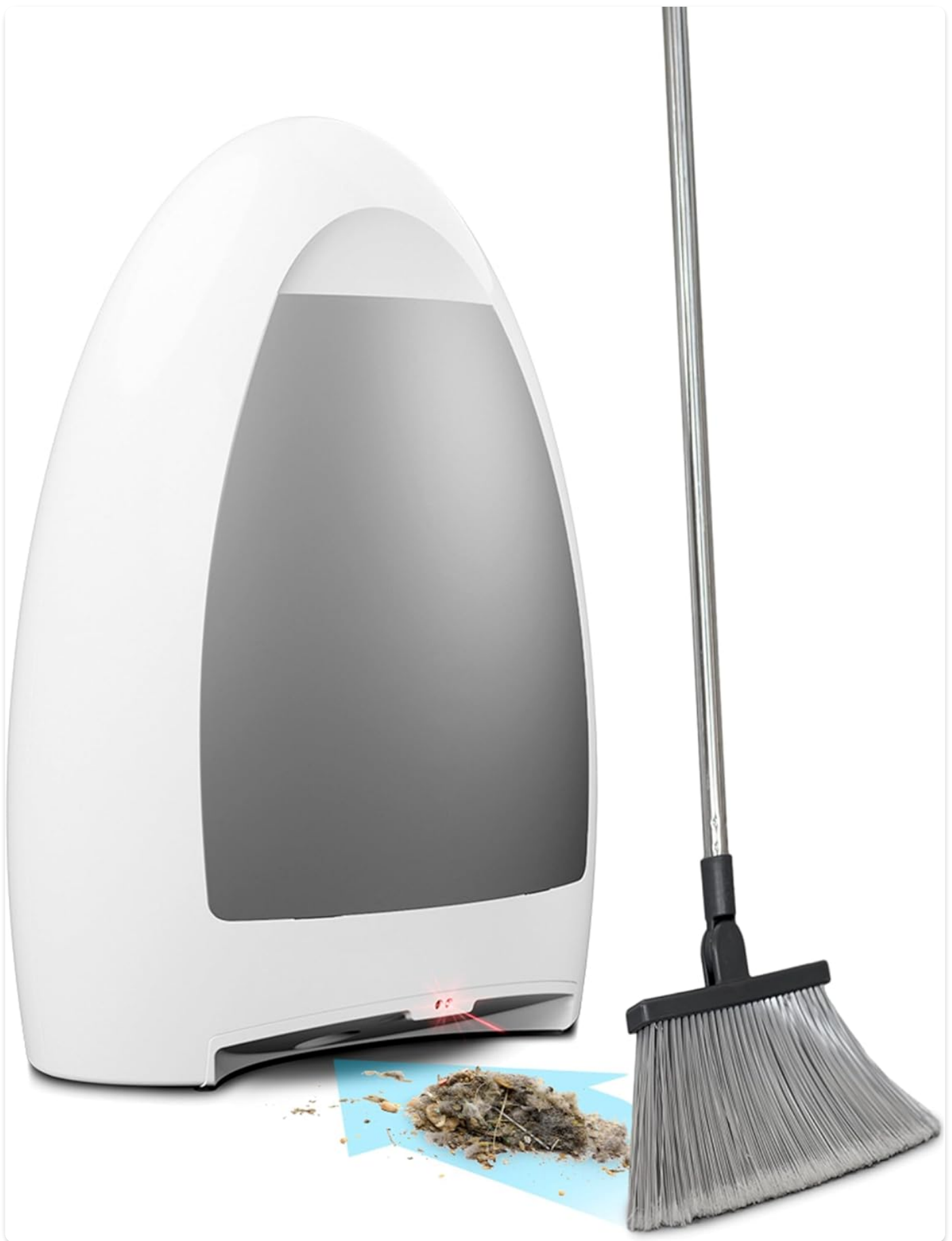
The EYE-VAC Home Touchless Vacuum, designed for effortless floor cleaning.