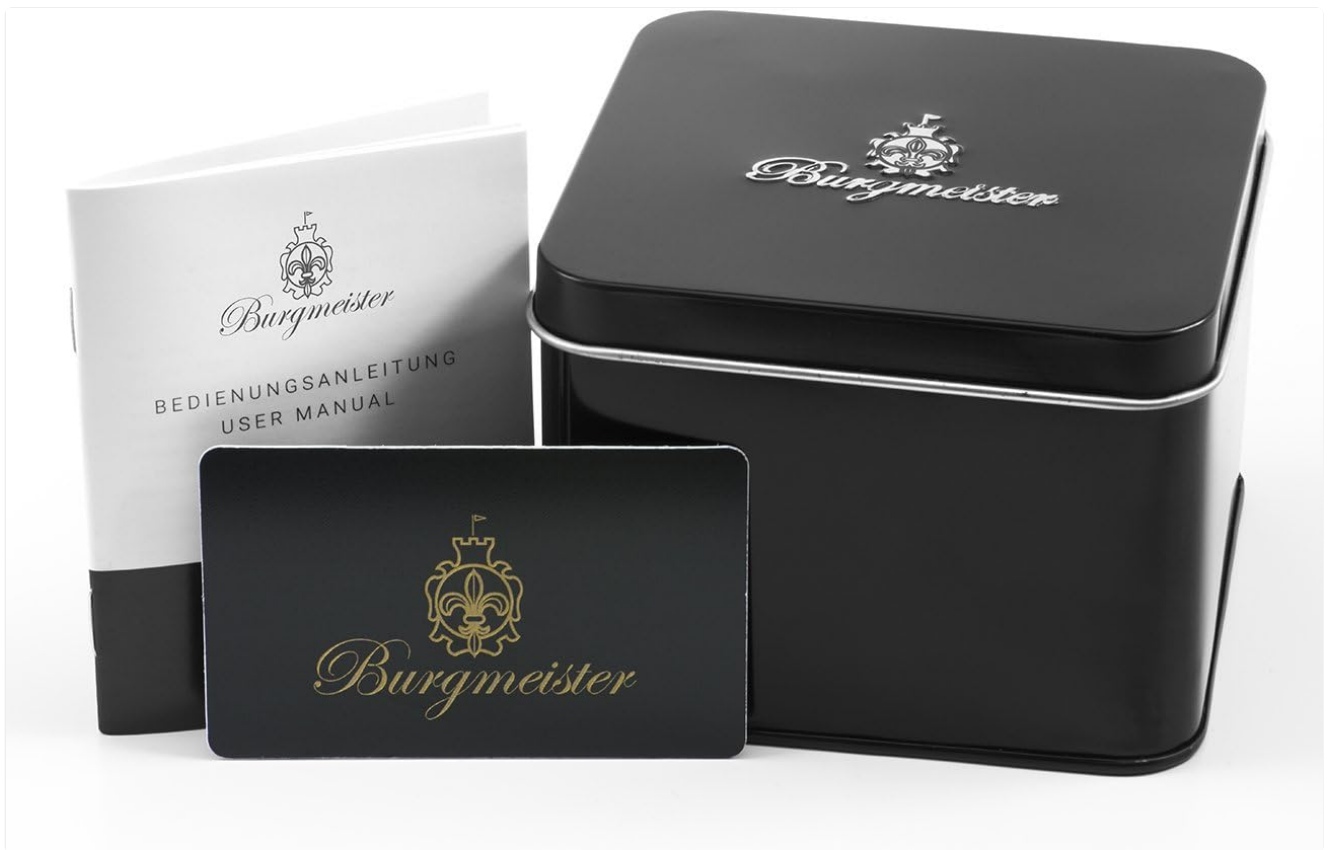
Figure 3: The Burgmeister watch comes in a protective box, accompanied by a user manual and warranty information.