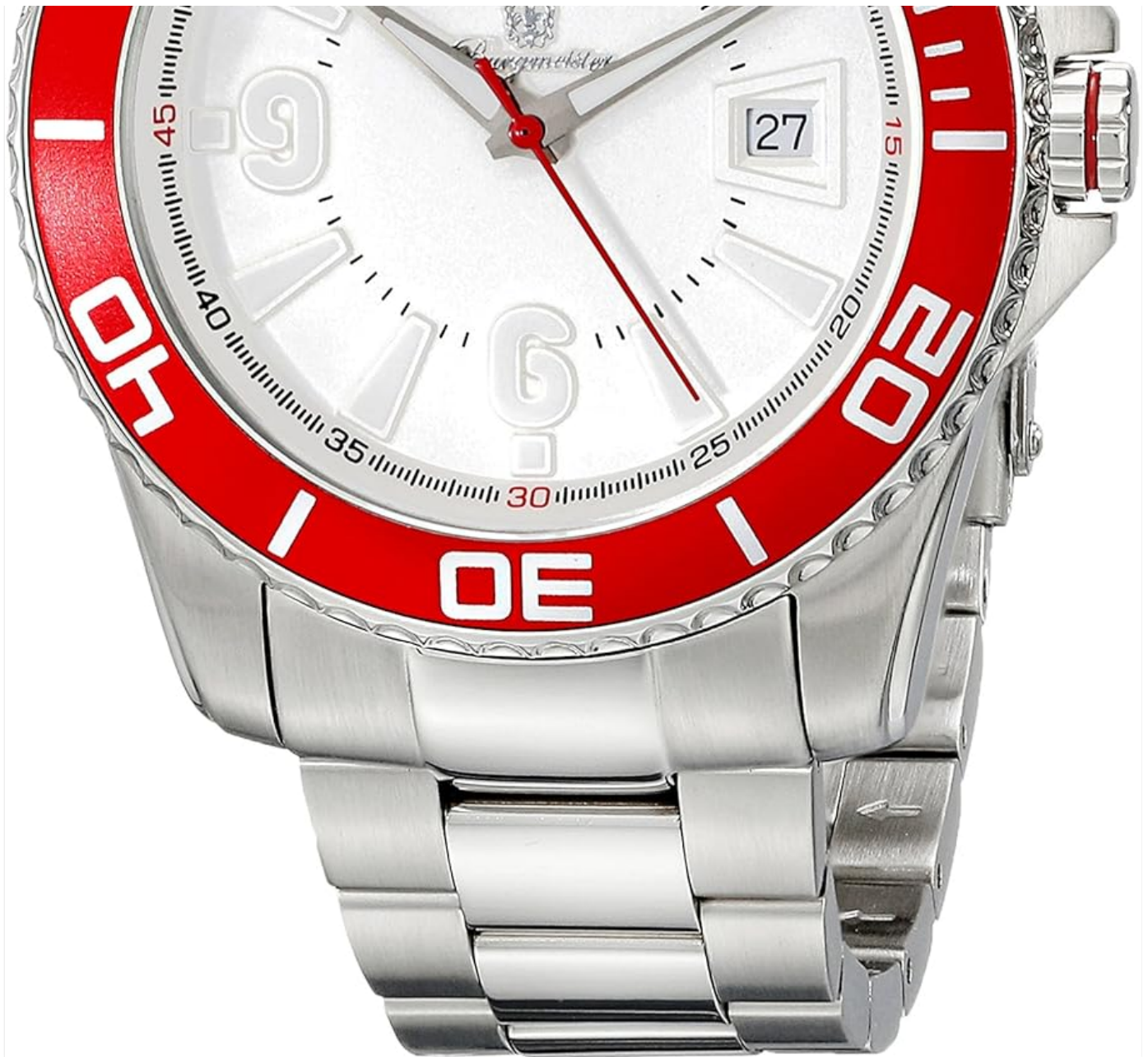
Figure 1: Front view of the Burgmeister BM531-111 Quartz Analog Watch, featuring a silver stainless steel bracelet, white dial, and a red bezel with minute markers.