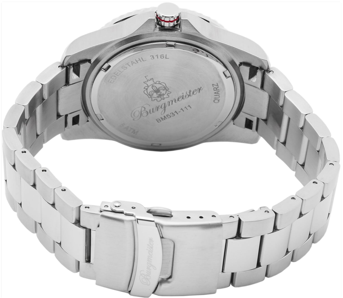
Figure 6: Rear view of the watch case, displaying the model number BM531-111 and water resistance rating of 5 ATM.