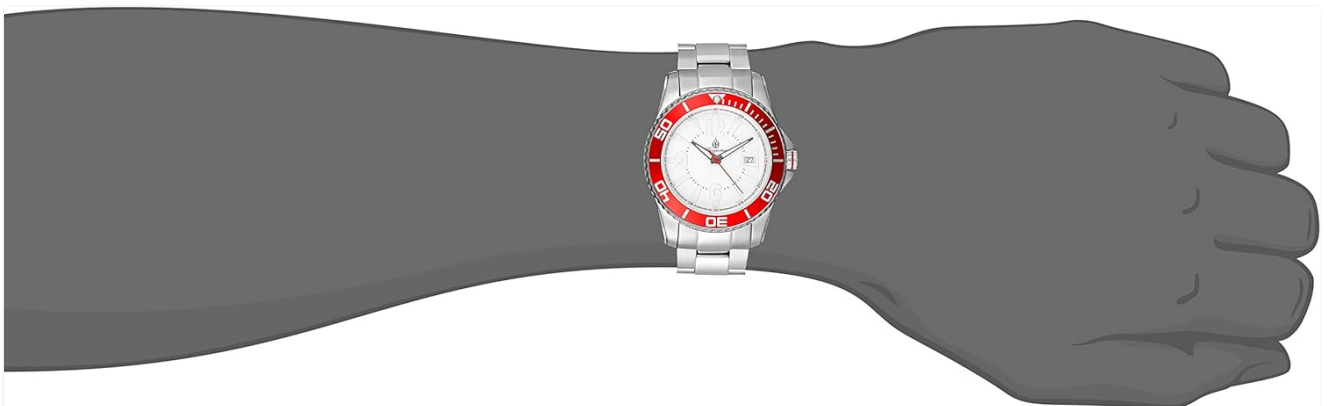
Figure 4: The watch worn on a wrist, demonstrating its fit and appearance.