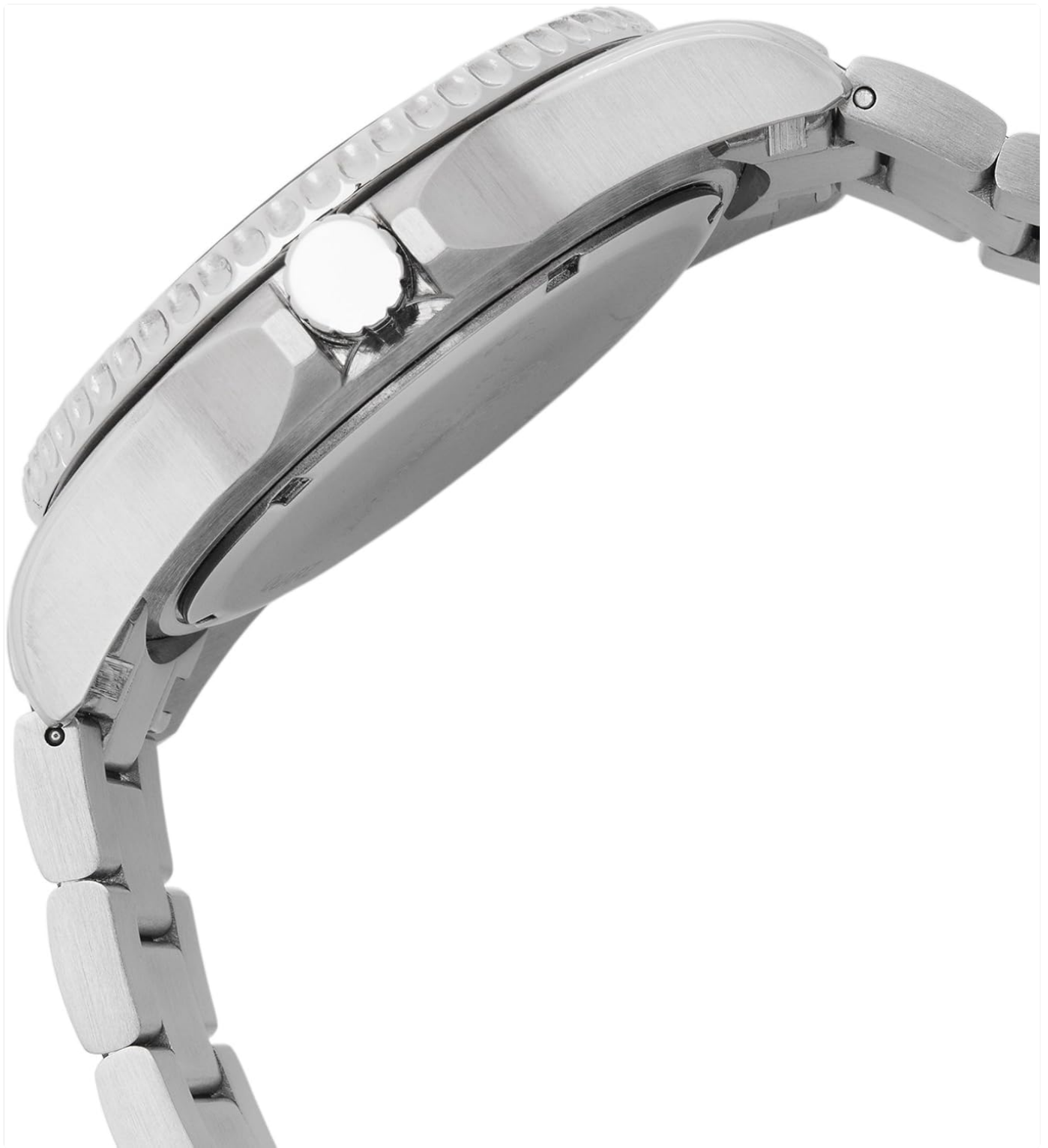
Figure 2: Side view of the watch, highlighting the crown used for adjustments.