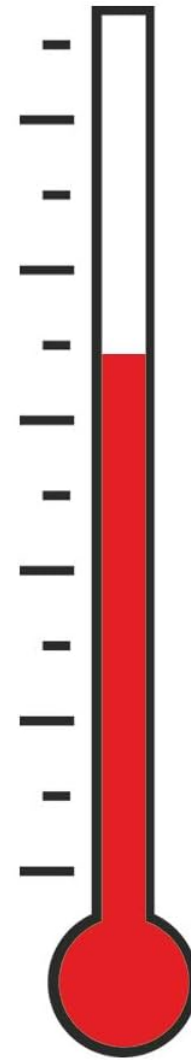
Image 6.2: Visual representation of the maximum water temperature setting, indicating the adjustable temperature range.