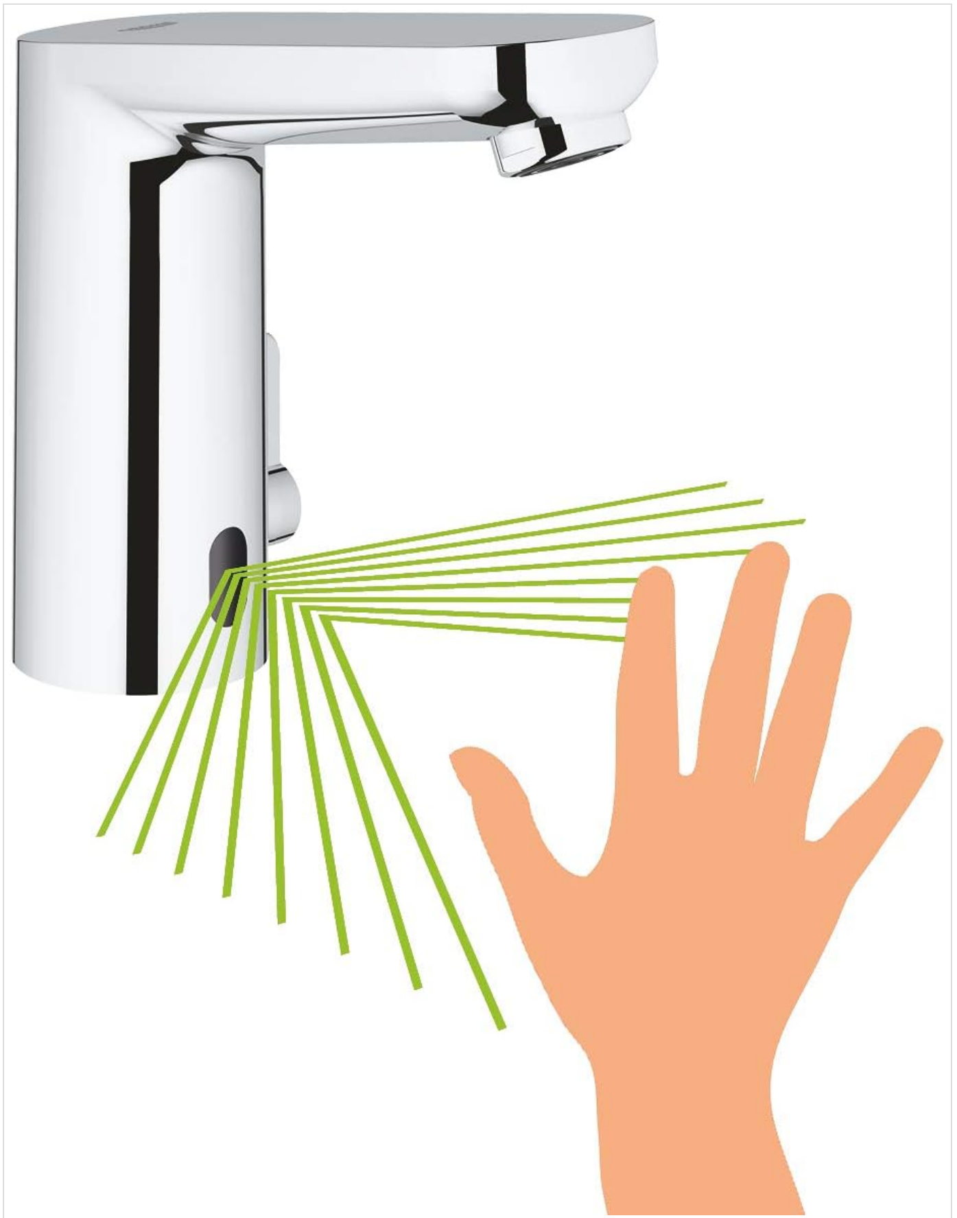
Image 6.1: Illustration of the infra-red sensor detecting a hand, initiating water flow for touchless operation.