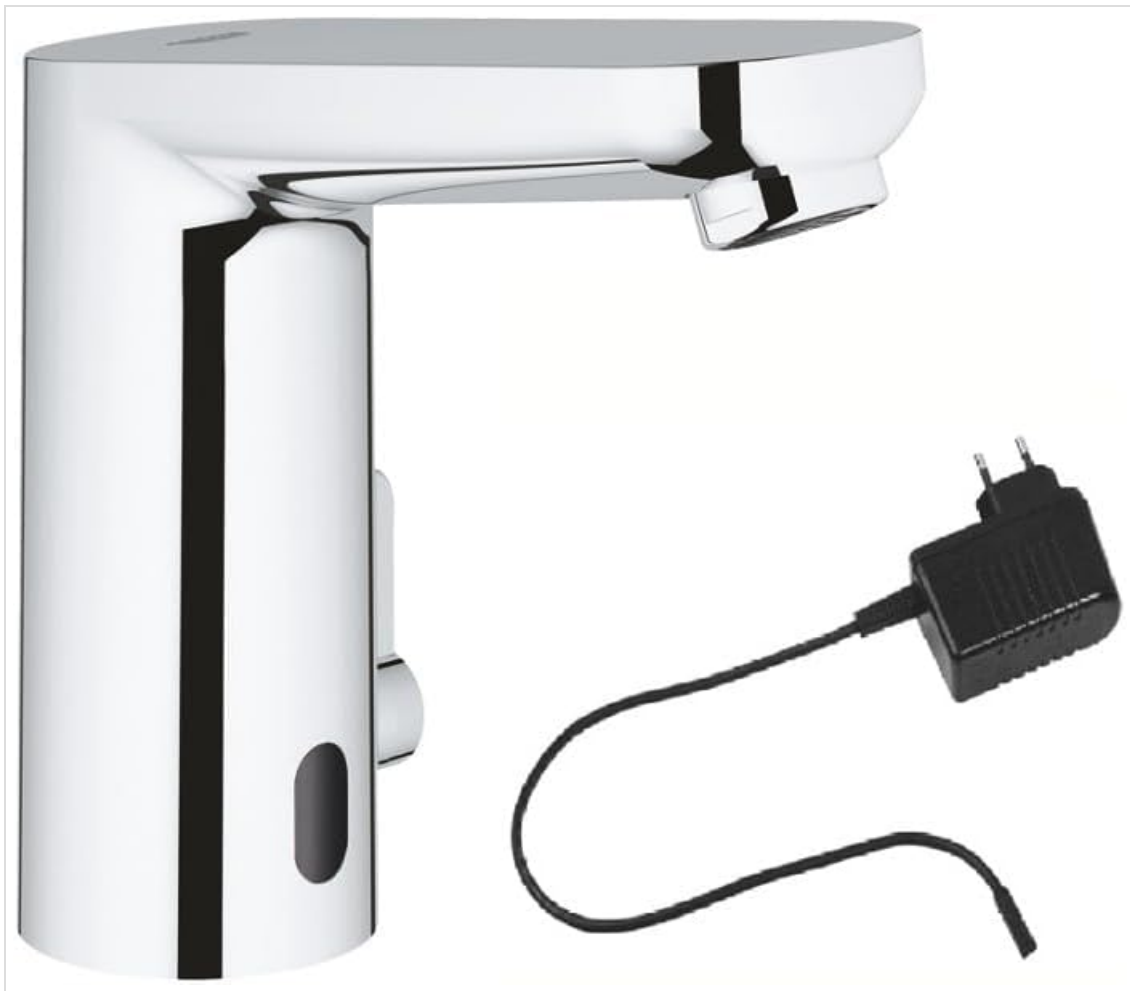
Image 5.1: The GROHE Eurosmart Cosmopolitan E mixer shown with its accompanying power adapter, highlighting the electrical connection requirement.