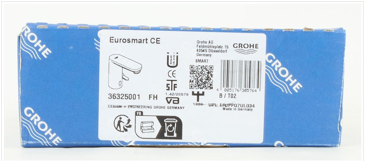
Image 9.2: The product packaging displaying GROHE branding and a QR code, which can be scanned for product information and support.

For technical assistance, spare parts, or warranty inquiries, please contact GROHE customer service. You can find contact information on the official GROHE website or by scanning the QR code on the product packaging.