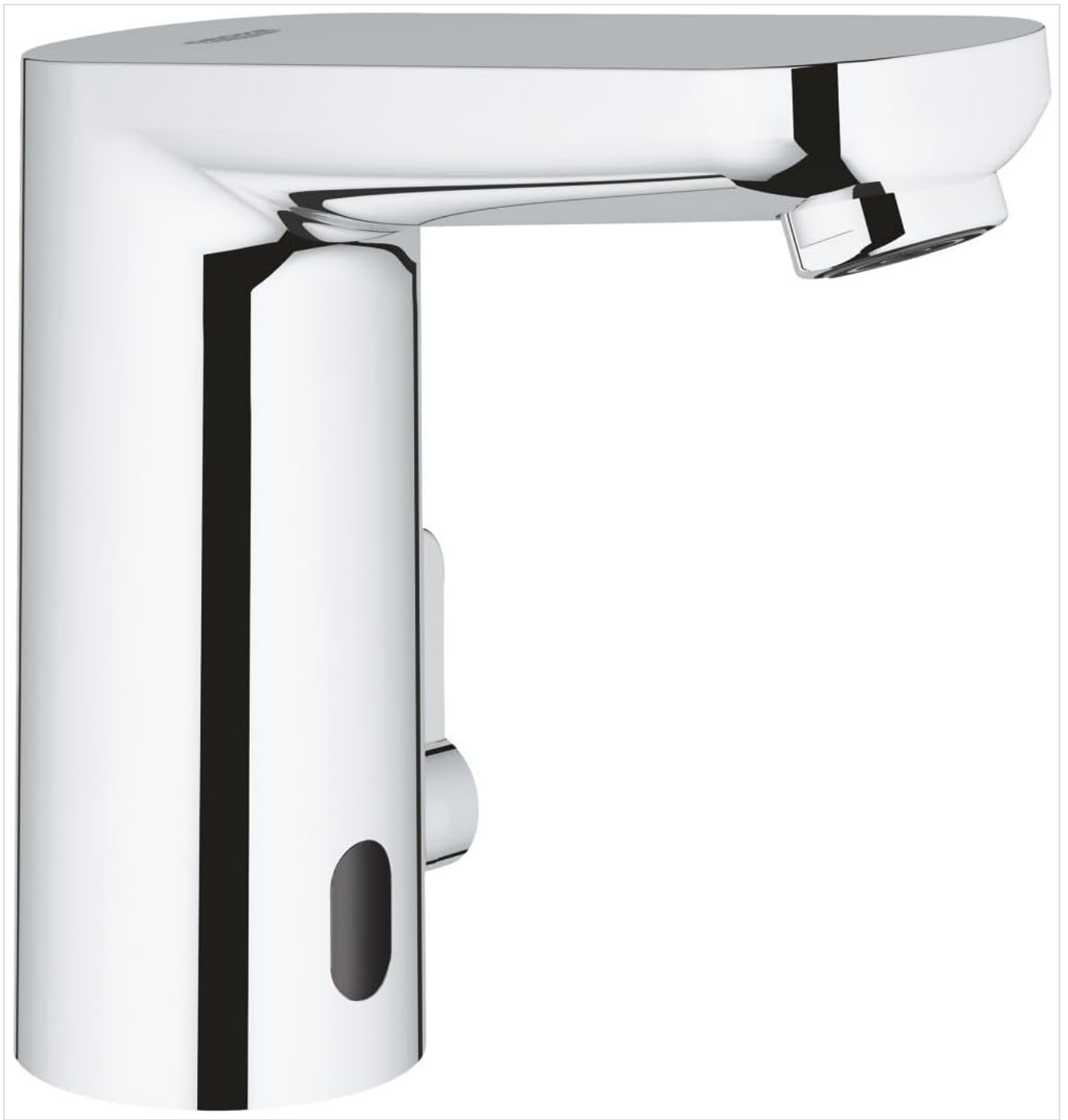
Image 1.1: The GROHE Eurosmart Cosmopolitan E Infra-Red Basin Mixer, showcasing its modern design and chrome finish.