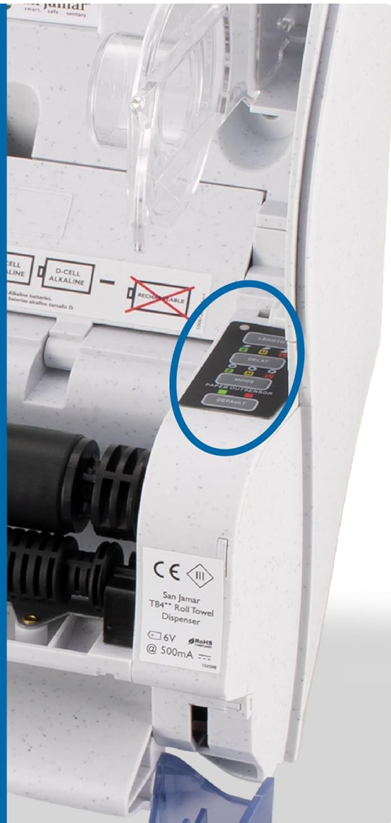
Figure 2: Internal view showing battery placement and keypad.

Compatible with 1.5" core diameter rolls. Ideal for restrooms, offices, kitchens, and healthcare facilities.