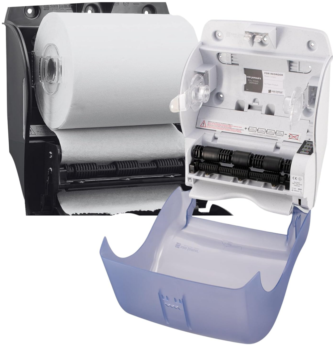
Figure 3: Loading a new paper towel roll into the dispenser.