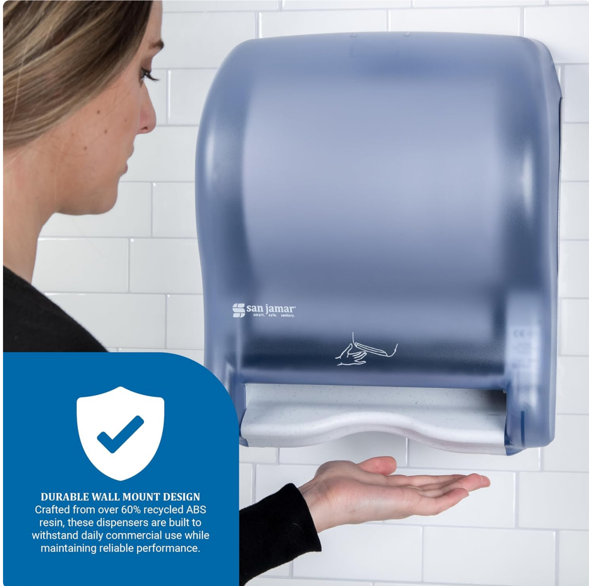
Figure 1: Dispenser mounted on a wall, ready for use.

The dispenser is designed for wall mounting. Choose a suitable location that allows for easy access and proper clearance for paper dispensing. Use appropriate fasteners for your wall type. Ensure the dispenser is securely mounted to prevent movement during use.