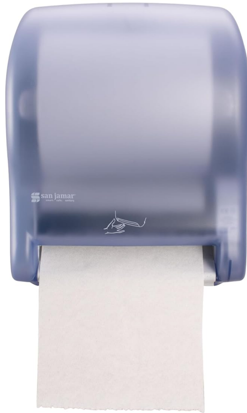
Figure 4: Paper towel dispensed automatically.