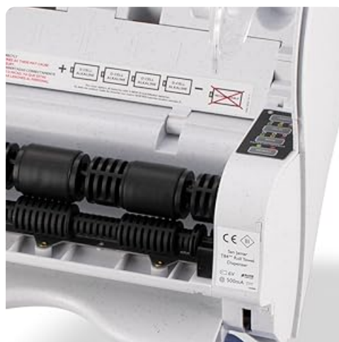
Figure 5: Internal keypad for settings adjustment.

The dispenser allows for customization of paper length and dispensing delay using the internal keypad. Open the dispenser cover with the key to access the keypad. You can select paper lengths of 8", 12", or 16". Dispensing delays can be set to 1.5 seconds, 3 seconds, or no delay, depending on traffic and preference.