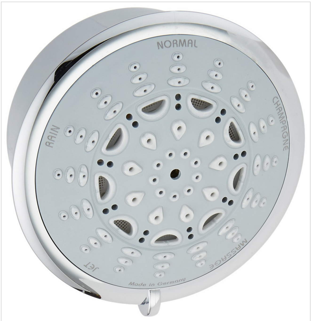
Figure 1: Front view of the Grohe Relexa Rustic 100 5-Spray Showerhead.