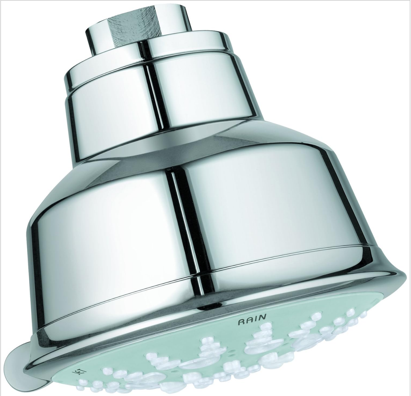
Figure 2: Rear view of the showerhead, illustrating the connection point for installation.

This showerhead is designed for wall-mounted installation. For detailed, step-by-step instructions, please refer to the dedicated Installation Guide included with your product. Ensure all local plumbing codes are followed during installation.