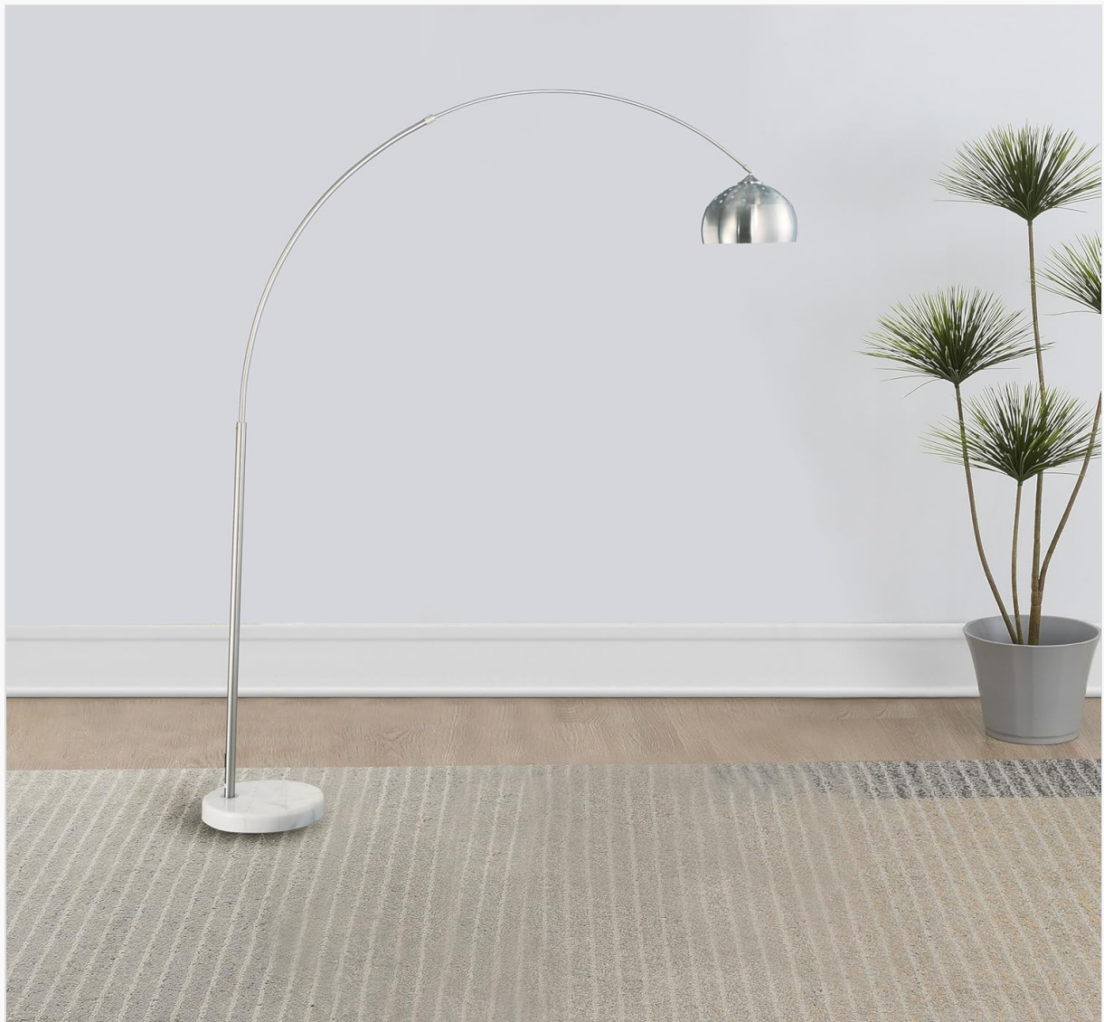
Image: The Coaster Krester Arc Floor Lamp positioned in a modern living room, showcasing its elegant design and how it complements the space.