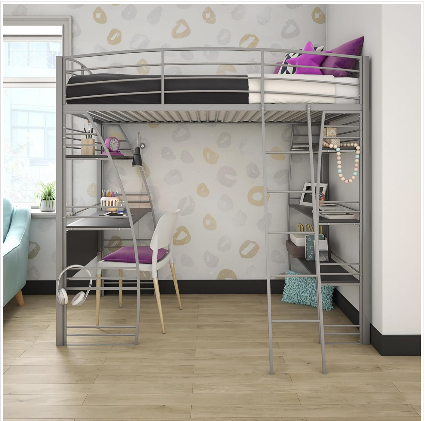
Figure 4: A view of the loft bed's integrated desk and shelving, demonstrating how the space can be utilized for study and storage.