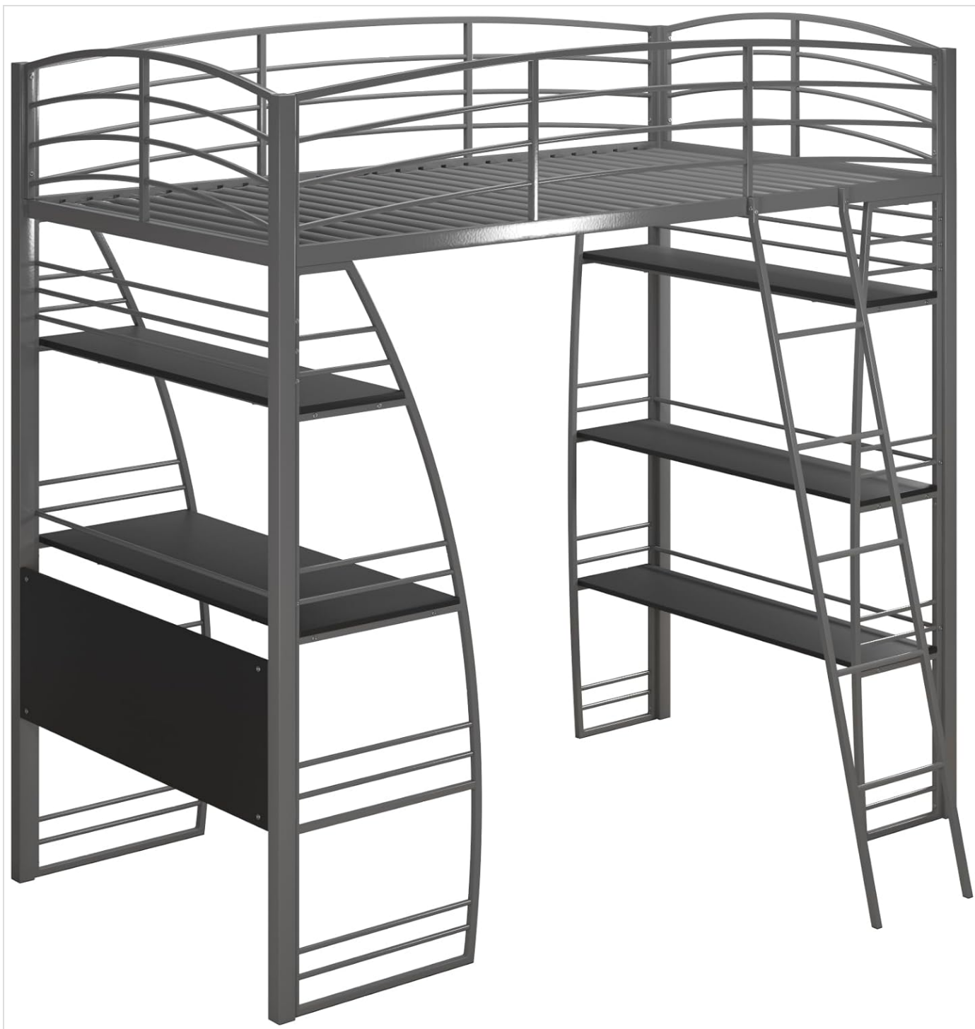
Figure 1: DHP Studio Loft Bunk Bed, Twin size, in Silver finish. This image shows the overall structure including the elevated bed, integrated desk, and shelving units.