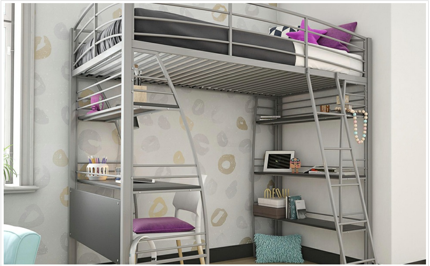
Figure 3: The DHP Studio Loft Bunk Bed fully assembled in a room, showcasing the bed, desk, and shelving units.

Video 1: An overview of the DHP Studio Loft Bed, demonstrating its features and providing visual context for assembly and usage. This video is provided by Dorel Industries (Seller).