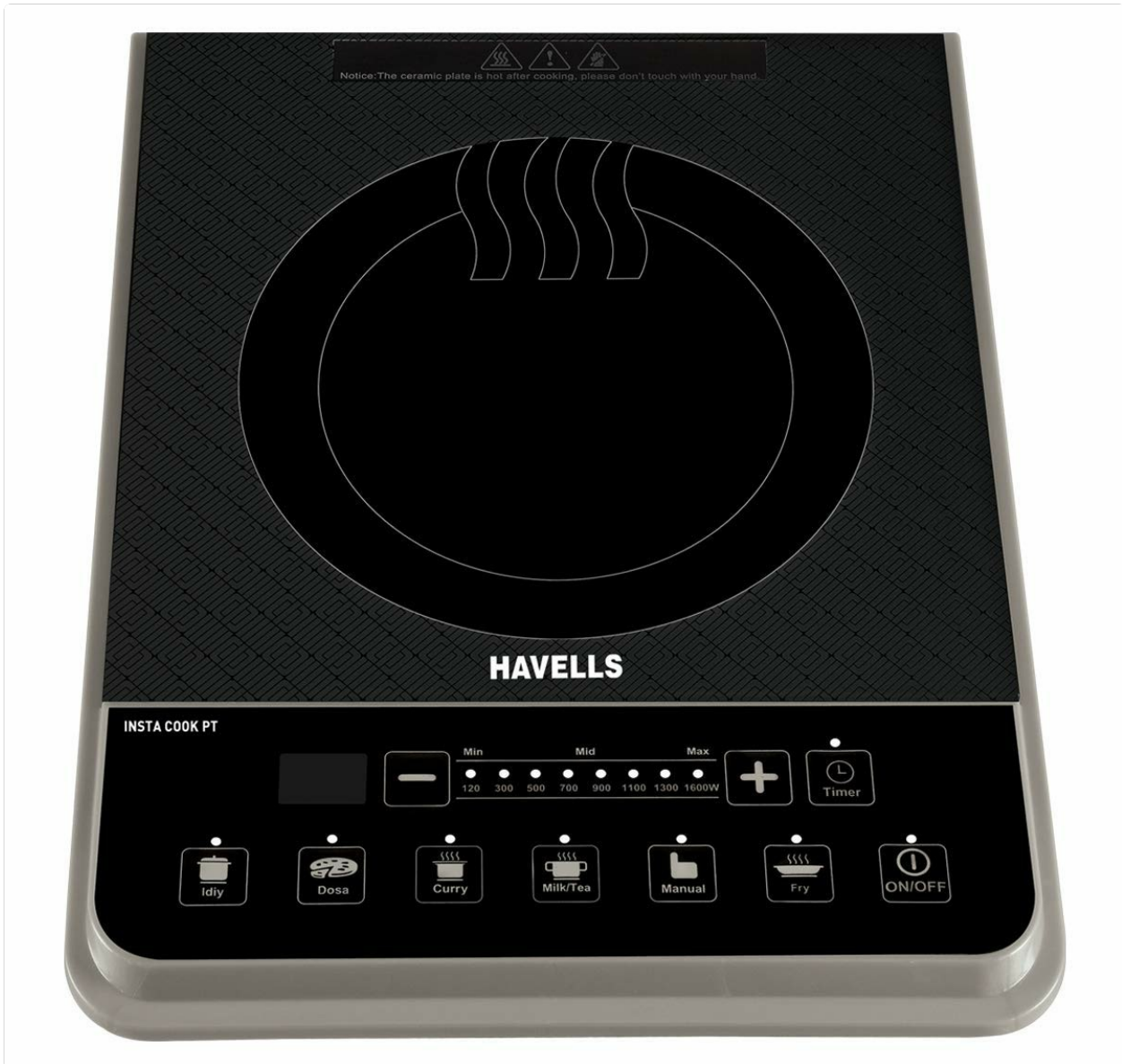
Figure 3.1: Havells Insta Cook PT 1600-Watt Induction Cooktop

The Havells Insta Cook PT 1600-Watt Induction Cooktop features a sleek design with an easy-to-use control panel.